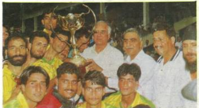
Jubilant J&K Police Football Team posing with the DGP