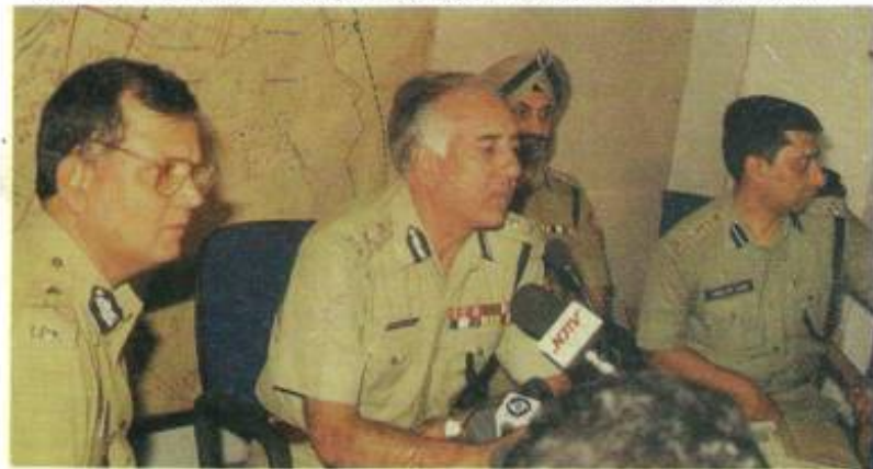
DGP speaking at the press conference at Jammu on Aug., 20

Jammu Police smashed one of the ISI modules by arresting 11 ultras, all belonging to Lashkar-e-Toiba outfit. The module was part of ISI's greater designs to trigger violence in all major Indian