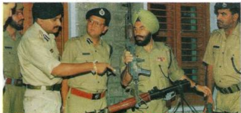
Weapons and Ammunition recovered by Police in Poonch District being shown to IGP, Jammu Zone, during his visit of border districts