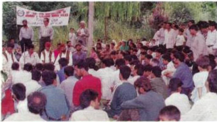
A View of the cultural programme organised by 7th Bn at Nehru Botanical Garden, Srinagar on Aug,08

Over 50 youth have joined these classes. A wooden bridge in the village is being repaired at a cost of about Rs 75,000.