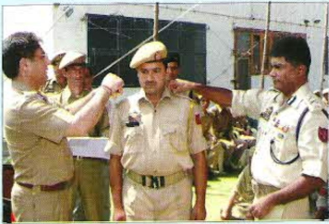
DGP J&K and IGP Kashmir decorating a newly promoted official at DPL Srinagar on September 06, 2010

ensure dignity and honour of common man. The DGP emphasized that Police serves as a bridge between public and the government and as such police should always endeavour to instill a sense of trust & faith among the people.