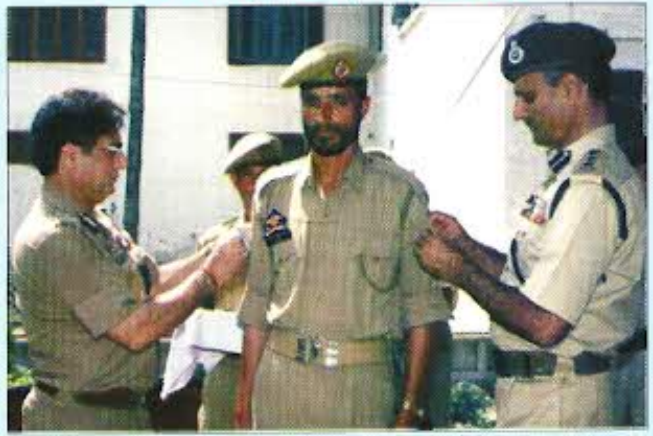
DGP J&K and SSP Srinagar pinning ranks to a newly promoted official at DPL Srinagar on September 06, 2010

Police for their remarkable contribution in saving the lives of people and public property. Appreciating their role, the DGP said that J&K Police has demonstrated great valour and courage while fighting the militancy during the past two decades and has kept the flag of J&K Police aloft. The DGP said that the primary role of the police is to maintain peace and order in the society and