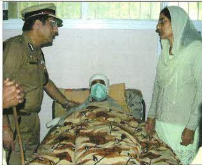
Above & below: DGP J&K personally visiting the injured police personnel in the intensive care unit of SKIMS Soura.