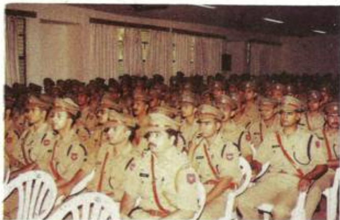
Trainees at SKPA, Udhampur keenly listening to the C.M.

Elaborating on the imperatives of "Ideal Policing", Dr. Farooq Abdullah, C.M, J&K, said that justice has to be dispensed to all, irrespective of religious, political and regional considerations, in his address to trainee officers, including 53 Dy. SsP, 35 Prosecuting Officers and 106 Sub Inspectors, all new entrants, at Sher-e-Kashmir Police Academy, Udhampur, on August, 16. Exuding confidence that they shall become the role model for others, Dr. Abdullah gave them a piece of advice- "Police Service, which you chose to join willingly, involves greater responsibilities and obligations. Don't You ever shy from the responsibilities and do your duty till last breath with honour and dignity." "You have to keep up the highest traditions of the force by befriending people and receiving bullets from the front while defending the unity and integrity of the country", the C.M added.