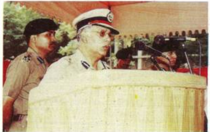
DGP, J&K, addressing a Darbar at Jammu, on August, 03