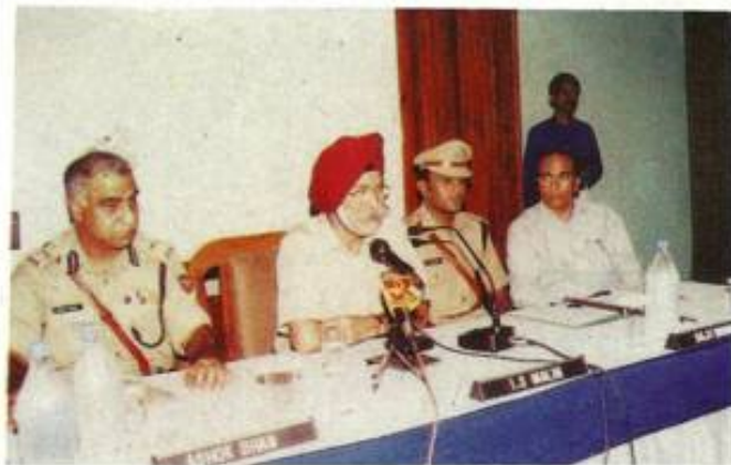
Chief Secretary, J&K, addressing the KAS probationers

In his inaugural address, the Chief Secretary elaborated on the essence of 'training' and said that the training was important to infuse and develop better quality and competence among the young officers, which shall provide them an opportunity to gain varied experience in running the administration. While giving them the tips of efficient and effective administration, he stressed on maintaining integrity, remaining physically and mentally sound and healthy, updating the knowledge with day to day advancement in Science and Information Technology and inculcating social and moral values.