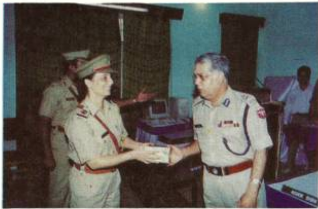
۳۱ اگست کو شیر کشمیر پولیس اکادمی اڈھپور میں DGP جموں و کشمیر KAS افسران کی تربیت کی الوداعی تقریب پر انعامات دیتے ہوئے۔