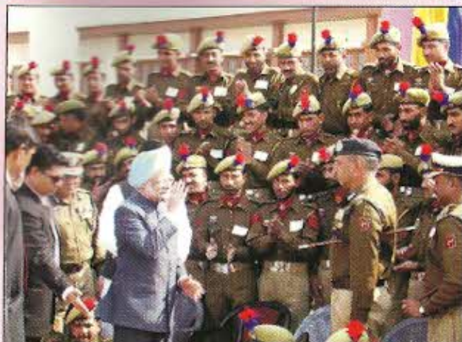
Dr. Manmohan Singh, Hon'ble Prime Minister of India interacting with the officers and jawans of J&K Police at RTC CRPF Humhama during sanik Sammelan on October 29, 2009.