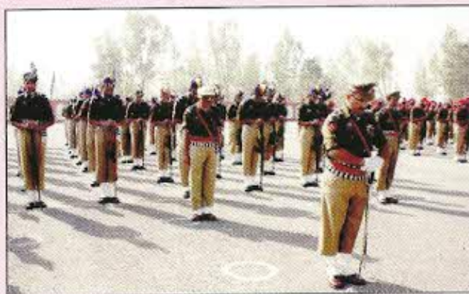
A view of the Police Commemoration Day Parade held at Zewan, Srinagar on October 21, 2009.