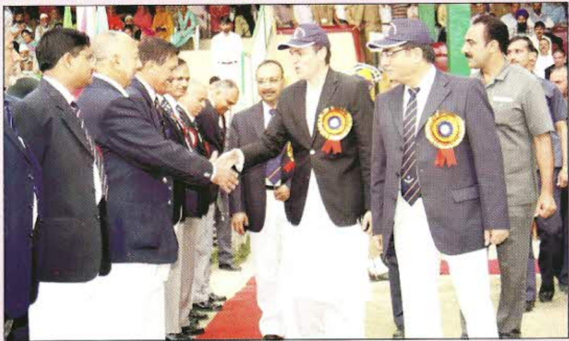
Shri Omar Abdullah, Hon'ble Chief Minister, J&K shaking hands with the senior Officers of J&K Police during the closing ceremony of 11 th J&K Police Martyrs Memorial Football Tournament-2009 at Bakshi Stadium, Srinagar on October 08, 2009