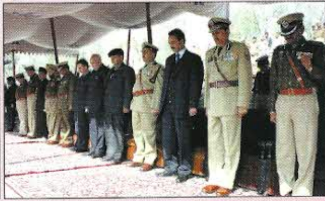
Senior Police Officers paying their obeisance to the Police Martyrs during the Police Commemoration Day-2009.