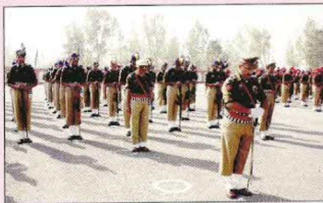
A view of the Police Commemoration Day Parade held at Zewan, Srinagar on October 21, 2009.

operations – be it fighting the militancy or maintaining law and order in the state. The C.M. assured the families of Police Martyrs that the entire state is with them and that they should not feel alone.