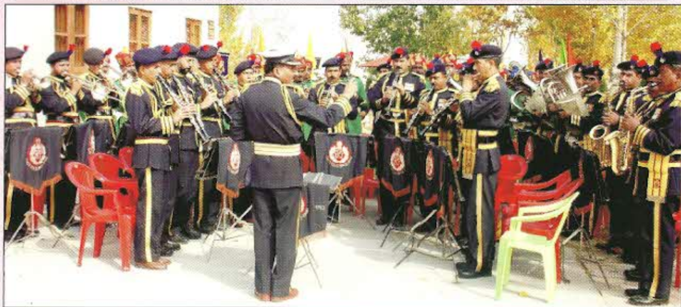
A view of the J&K Police Brass Band display at RTC CRPF Humhama, Srinagar during the visit of Dr. Manmohan Singh, Hon'ble Prime Minister of India on October 29, 2009.