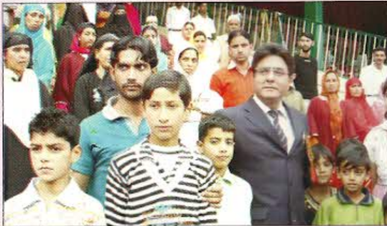
DGP J&K with the NOKs of Police Martyrs during closing ceremony of 11th JKPMFBT on October 8, 2009.

The NOKs of the J&K Police Martyrs were specially invited on the occasion. Hon, ble C.M and DGP J&K interacted with the NOKs of Police Martyrs and presented Clour T.V sets and gift packs to them.