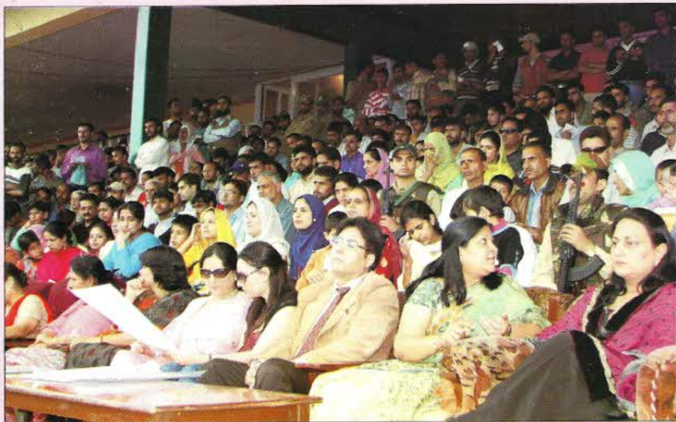
Senior police officers and their families witnessing the raffle draw held during police-public mela at Bakshi Stadium, Srinagar on October 04, 2009.