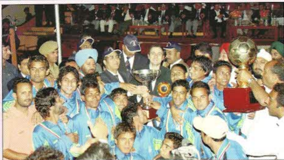
J&K Police Football Team players holding the winners trophy of 11th JKPMFBT-2009 posing for a photograph with the Hon'ble CM, and DGP J&K on the closing ceremony of the Tournament.

Shri Omar Abdullah, Hon'ble Chief Minister, J&K was the Chief Guest on the closing ceremony held at Bakshi Stadium, Srinagar. The function was attended by a large number of civil and Police officers besides large