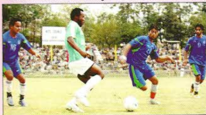
J&K Police & J K Bank football team Players in action during the final match of 11th JKPMFMT-2009 on October 8, 2009 at Baksh stadium Srinagar

number of people and NOKs of the Police Martyrs. While addressing the gathering on the occasion, Hon'ble C.M lauded the role of J&K Police in restoring peace and maintaining law and order in the state and hoped that the coming days would be more peaceful and conducive. "Let us pray and work for complete peace and tranquility in the state so that we live, progress and develop in a conducive atmosphere- the C.M. said. Recalling the sacrifices made by police personnel, the C.M paid a rich tribute to the police Martyrs and emphasized that they shall be highly remembered in the long run.