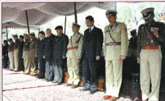
Senior Police Officers paying their obeisance to the Police Martyrs during the Police Commemoration Day-2009.