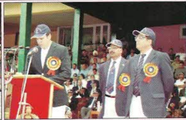
Shri Omar Abdullah Hon'ble CM J&K addressing the gathering during the closing ceremony of 11th J&K Police Martyrs Memorial Football Tournament held at Bakshi Stadium Srinagar on October 08, 2009.

The 13 days long 11th J&K Police Martyrs Memorial Football Tournament -2009 organized by J&K Police in collaboration with J&K Football Association commenced from September 26, 2009 and concluded on October 08, 2009.