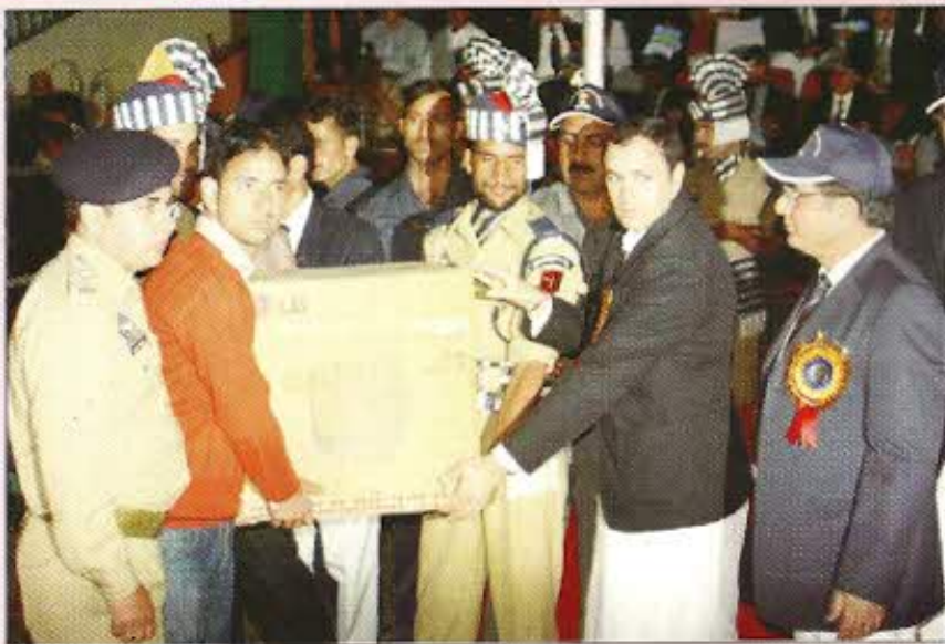
Hon'ble CM J&K presenting colour TV sets to the NOKs of J&K Police Martyrs on the closing ceremony of 11th J&K Police Martyrs Memorial Football Tournament-2009 on October 08, 2009.