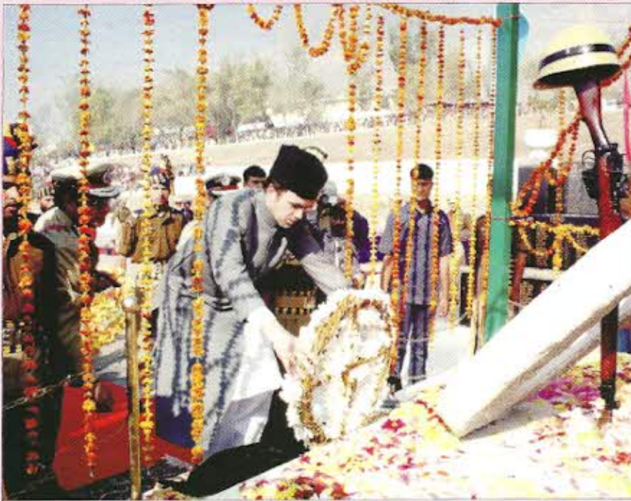
Shri Omar Abdullah, Hon'ble Chief Minister, J&K laying the wreath on the J&K Police Martyrs Memorial Zewan Srinagar on the occasion of Police Commemoration Day-2009

While speaking on the Police Commemoration Day, the DGP, J&K said that the day is being observed throughout the country as a mark of homage to the 10 CRPF personnel who laid down their lives on October 21, 1959 while repulsing the Chinese attack at Hot Springs in Ladakh region of J&K. He said that nearly 5300 security forces personnel including 900 men and officers of J&K Police have laid down their lives while fighting militancy in the state during the last two decades of turmoil.