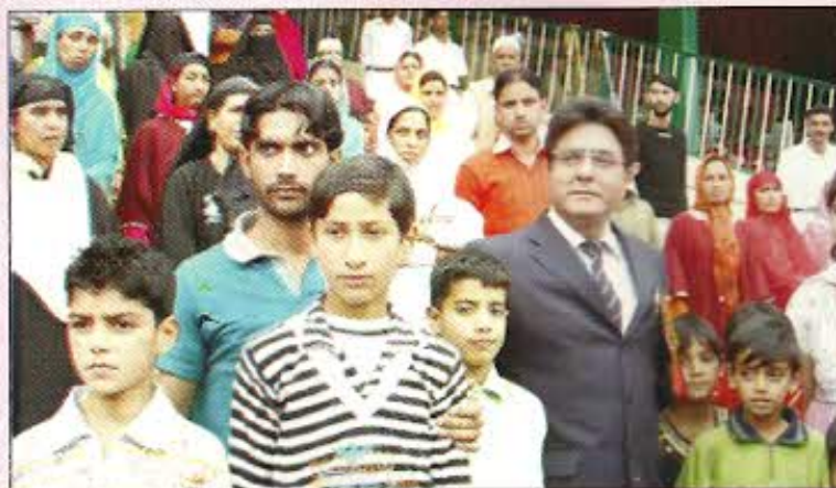
DGP J&K with the NOKs of Police Martyrs during closing ceremony of 11th JKPMFBT on October 8, 2009.

The NOKs of the J&K Police Martyrs were specially invited on the occasion. Hon, ble C.M and DGP J&K interacted with the NOKs of Police Martyrs and presented Clour T.V sets and gift packs to them.