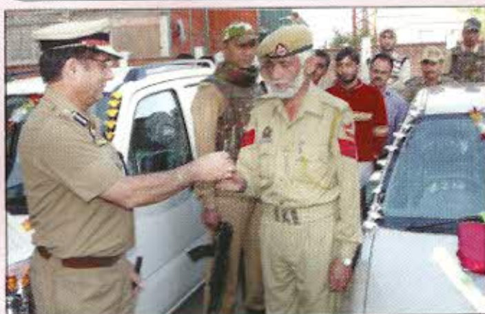
The winner of the car in raffle draw, receiving the keys from DGP, J&K.