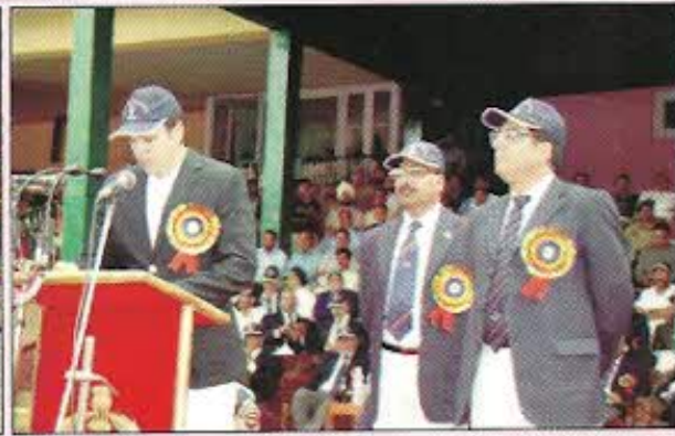
Shri Omar Abdullah Hon'ble CM J&K addressing the gathering during the closing ceremony of 11th J&K Police Martyrs Memorial Football Tournament held at Bakshi Stadium Srinagar on October 08, 2009.

The 13 days long 11th J&K Police Martyrs Memorial Football Tournament -2009 organized by J&K Police in collaboration with J&K Football Association commenced from September 26, 2009 and concluded on October 08, 2009.