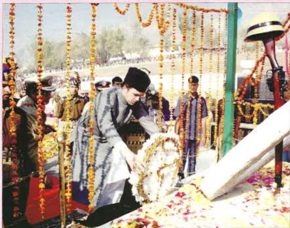
Shri Omar Abdullah, Hon'ble Chief Minister, J&K laying the wreath on the J&K Police Martyrs Memorial Zewan Srinagar on the occasion of Police Commemoration Day-2009

While speaking on the Police Commemoration Day, the DGP, J&K said that the day is being observed throughout the country as a mark of homage to the 10 CRPF personnel who laid down their lives on October 21, 1959 while repulsing the Chinese attack at Hot Springs in Ladakh region of J&K. He said that nearly 5300 security forces personnel including 900 men and officers of J&K Police have laid down their lives while fighting militancy in the state during the last two decades of turmoil.