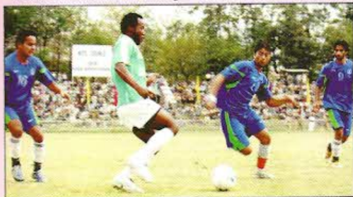
J&K Police & J K Bank football team Players in action during the final match of 11th JKPMFBT-2009 on October 8, 2009 at Baksh stadium Srinagar

number of people and NOKs of the Police Martyrs. While addressing the gathering on the occasion, Hon'ble C.M lauded the role of J&K Police in restoring peace and maintaining law and order in the state and hoped that the coming days would be more peaceful and conducive. "Let us pray and work for complete peace and tranquility in the state so that we live, progress and develop in a conducive atmosphere- the C.M. said. Recalling the sacrifices made by police personnel, the C.M paid a rich tribute to the police Martyrs and emphasized that they shall be highly remembered in the long run.