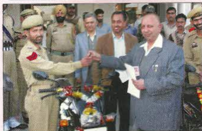
Shri Z.H.Chishti IPS IGP (Mod) PHQ J&K presenting keys of the motorcycle to its winner.