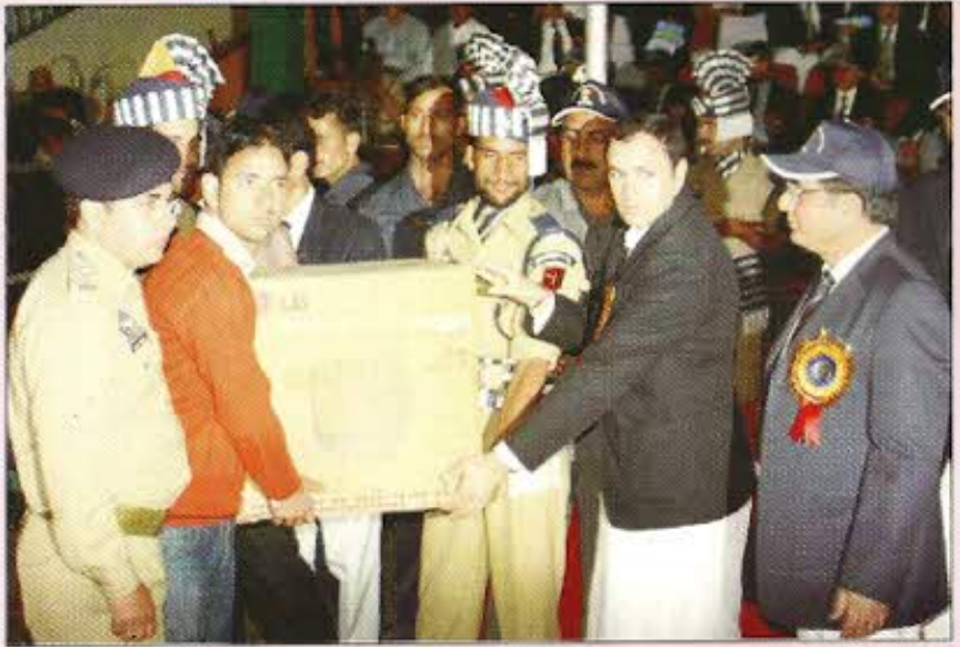
Hon'ble CM J&K presenting colour TV sets to the NOKs of J&K Police Martyrs on the closing ceremony of 11th J&K Police Martyrs Memorial Football Tournament-2009 on October 08, 2009.