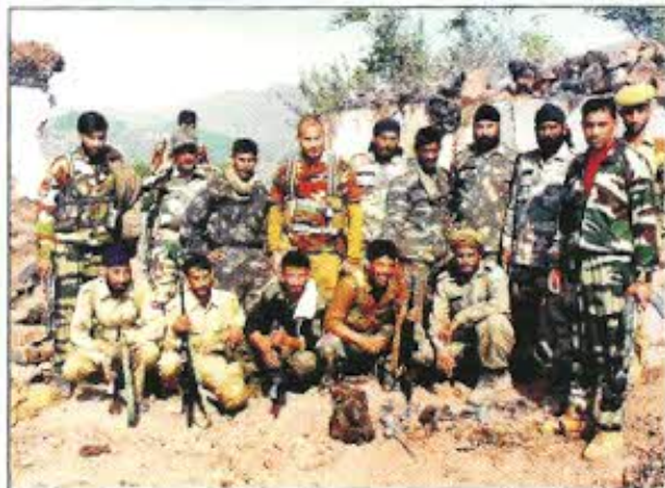
J&K Police team at an encounter site at Saroti Top Poonch on 28/29 October 2009

During the month of October 2009, J&K Police killed 15 dreaded militants, apprehended 05 militants whileas 04 militants surrendered across the state. The arms and ammunition recovered during this period include 19 AK-47/56 Rifles, 54 AK Magazines, 971 AK rounds, 36 hand grenades, 13 pistols, 10 pistol magazines, 49 pistol rounds, 06 wireless sets, 03 RPG shells, 01 country made gun, 01 Rocket launcher, 01 revolver, 19 anti-personal mines, 02 IEDs, 13 KG RDX, 01 Rifle 8mm, 01 timer, 03 detonators, 05 electronic detonators, 13 kg explosive, 16 mines besides 02 blankets, 05 pouches, 02 pencil cells, 01 dry battery, 06 mobile phones with charger and batteries, 04 sim cards, Rs.4,30,000/- cash meant for hawala money, Rs.1,54,000 fake currency, 01 Satellite Phone and 01 solar charger.