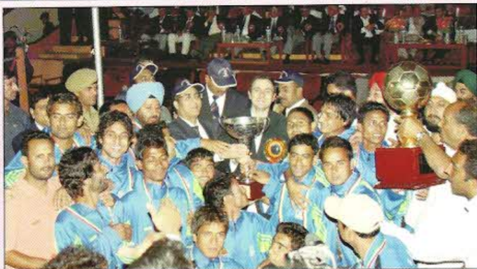
J&K Police Football Team players holding the winners trophy of 11th JKPMFMT-2009 posing for a photograph with the Hon'ble CM, and DGP J&K on the closing ceremony of the Tournament.

Shri Omar Abdullah, Hon'ble Chief Minister, J&K was the Chief Guest on the closing ceremony held at Bakshi Stadium, Srinagar. The function was attended by a large number of civil and Police officers besides large