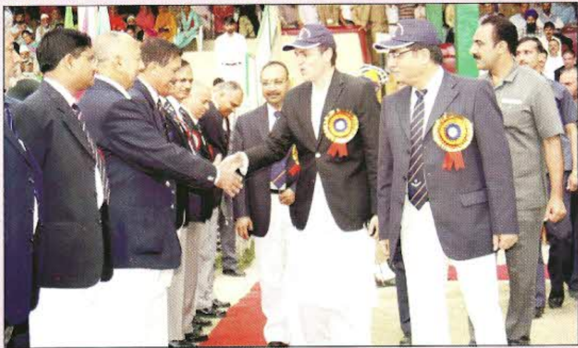
Shri Omar Abdullah, Hon'ble Chief Minister, J&K shaking hands with the senior Officers of J&K Police during the closing ceremony of 11 th J&K Police Martyrs Memorial Football Tournament-2009 at Bakshi Stadium, Srinagar on October 08, 2009