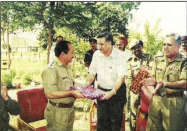
لوکری سے سبکدوش ہونے پر، ۳۰ ستمبر کو جناب سالگرہ ام پرینہار ڈپٹی سپرنٹنڈنٹ پولیس، کے اعزاز میں دی گئی الوداعی پارٹی کے موقعہ پر، یادگاری تحفہ لیتے ہوئے۔