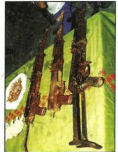
Weapons recovered by SOG, Srinagar, on Sept, 07