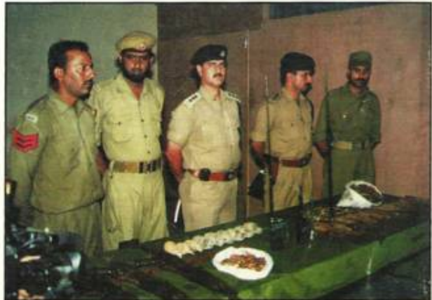
۷ ستمبر کو سیکش اور پریشن گروپ سرینگر، برآمد شدہ اسلحہ و ایمونیشن کی نمائش کرتے ہوئے۔