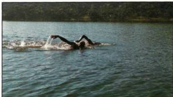
A Sportsman of J&K Police, preparing for participation in All India Aquatic competition, in Dal lake, Srinagar

Recognizing the sports and games as essential for good health and physical fitness which provides an opportunity for get together and building camaraderie and team spirit, J&K Police is all set to host two national level sports events in All India Police Golf Tournament, scheduled to be held in Srinagar (Oct. 17-19) and All India Police Band Competition, scheduled to be held in Srinagar (Oct. 23-29). Police Headquarters has constituted two organising committees for the conduct of the two