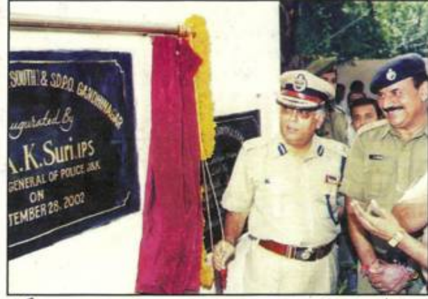
ریاستی پولیس کے ڈائریکٹر جنرل، ۲۸ ستمبر کو جموں میں SP سادھو اور SDPO گاندھی نگر کے دفاتر کی نئی تعمیر شدہ عمارت کی رسم افتتاح پھیل لاتے ہوئے۔