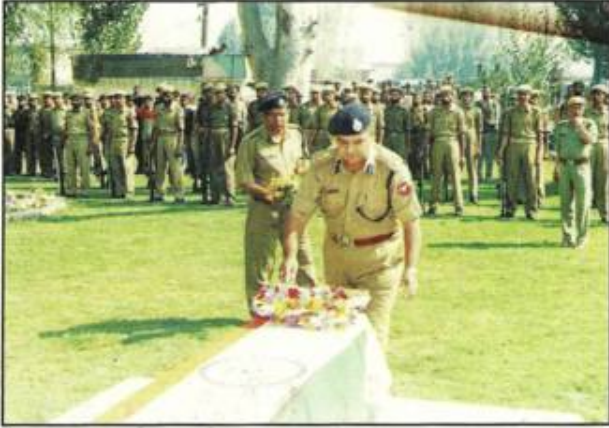
۲۳ ستمبر کو جناب بشیر احمد ڈار، کمانڈنٹ ۱۳ او ایس ہٹالین ریاستی سطح پولیس، پولیس کے ایک شہید کو گل ہا عقیدت پیش کرتے ہوئے۔