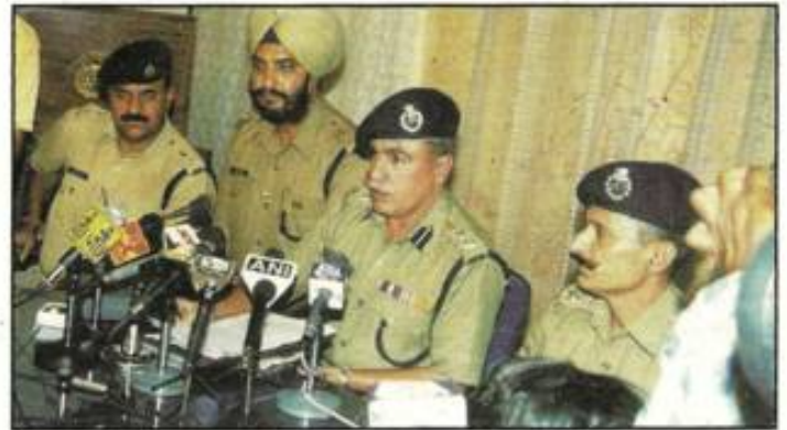
SSP, Jammu (centre) briefing the press about the arrest of terrorists by Jammu Police, on September, 06

had been operating for quite some time and was involved in a number of subversive activities including killings of 20 odd security personnel and 7 civilians, besides a series of explosions. With the arrest of aforementioned 7 terrorists, the Rajiv Nagar, Jammu massacre of July, 13 was completely worked out.