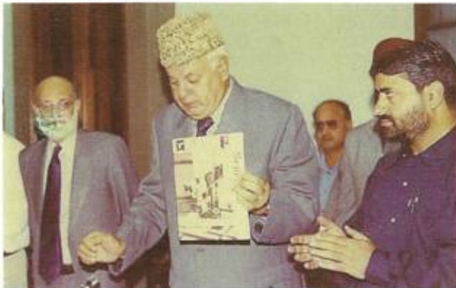
Chief Secretary, J&K (Left), C.M., J&K, (Centre) and MOS Home, J&K (Right) at the inaugural function