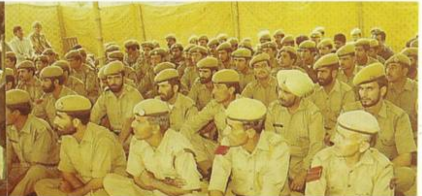
جناب راجا عجاز علی خان، ڈپٹی انسپکٹر جنرل پولیس، ۸ اکتوبر کو ریاستی Auxiliary پولیس کے ملازمین سے ایک ”درہار“ کے دوران خطاب کرتے ہوئے۔