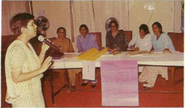
”سپرنگ بورڈز تانہ ترقیاتی پروگرام“ کے تحت ایک ورک شاپ کا منظر جو ۱۵ ستمبر کو آرٹڈ پولیس ہیڈ کوارٹر کے کانفرنس ہال میں منعقد ہوئی۔