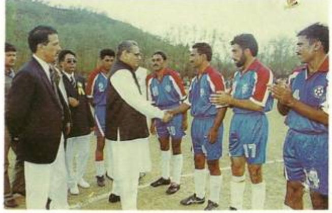
نارتھ کشمیر فٹ بال ٹورنامنٹ، جو بارہمولہ میں ریاستی پولیس کے اشتراک و تعاون سے منعقد پایا گیا، اختتامی تقریب پر ۱۶ ستمبر کو مہمان خصوصی، جناب محمد شفیع، وزیر تعلیم، کھلاڑیوں سے متعارف ہو رہے ہیں۔