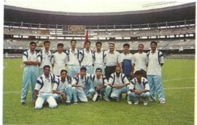
J&K Police Football XI at the 50th All India Police Football Championship, Kolkata.