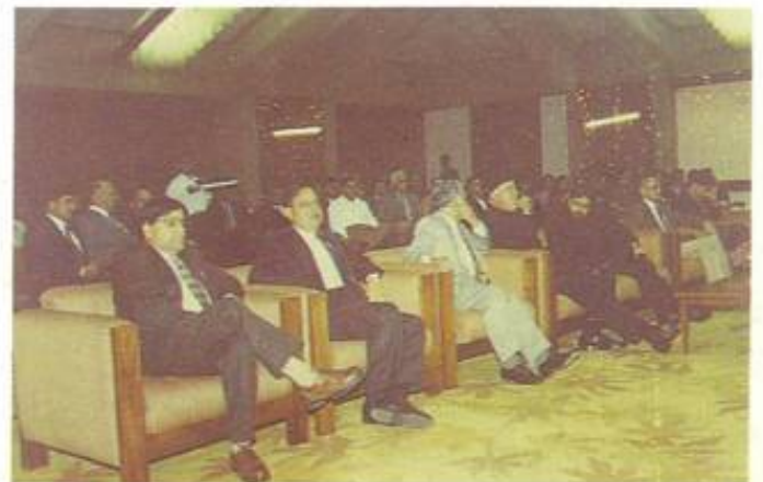
Participants of 2-day Seminar, at Srinagar, on Sept, 14.