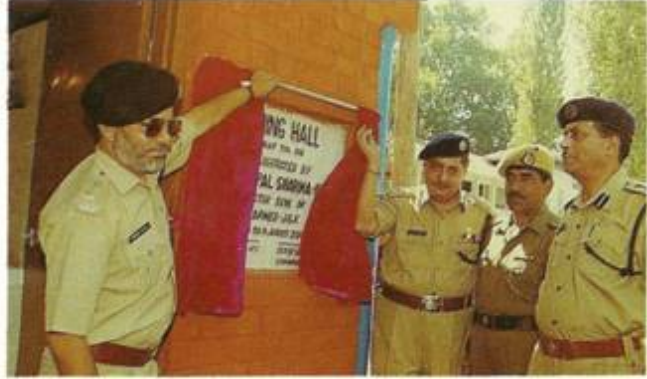
یکم اکتوبر سرینگر میں جموں و کشمیر آرٹڈ پولیس کی ساتویں سالین کے نئے تعمیر شدہ ڈائمنگ ہال کی رسم افتتاح کا منظر۔