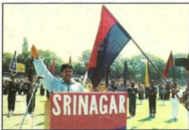
A view of the oath ceremony held at the Inaugural function at Bakshi stadium Srinagar on Sept. 4.

The matches were played at two venues of Amar Singh College and Bakshi Stadium grounds. The league round was complete on Sept. 9 and pre quarter final round, played on knockout basis, was completed on Sept. 11, in which teams from Nagaland, CRPF, SSB, J&K, M.P, Rajasthan, Maharashtra, Assam, U.P., Manipur, Karnatka, and Bihar qualified.