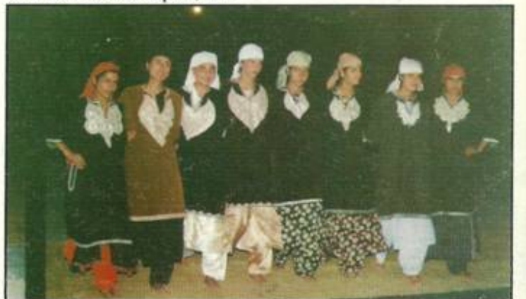
A view of the Kashmiri Folk dance presented by the Women Police Personnel, J&K Police during the Football Championship