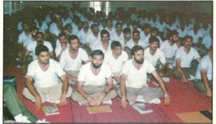
A view of the training programme held in DPL, Jammu