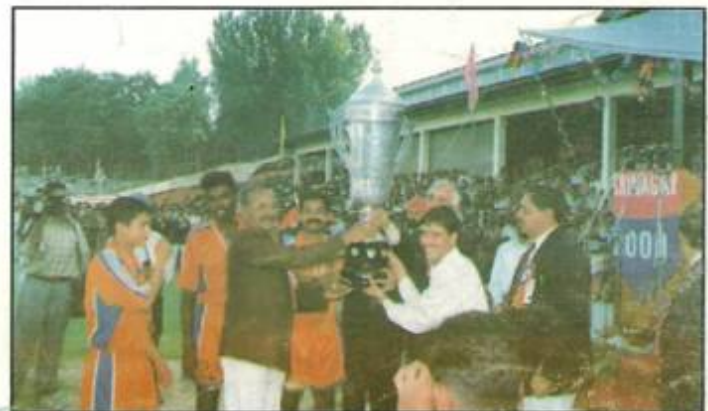
Jubilant Karnatka team displaying the Cup at the concluding function on Sept. 16