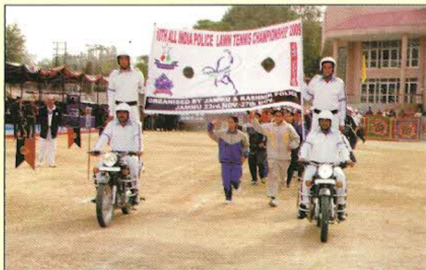
The dare devils of J&K Police displaying the banner of 10th All India Police Lawn Tennis Championship 2009 during the closing ceremony