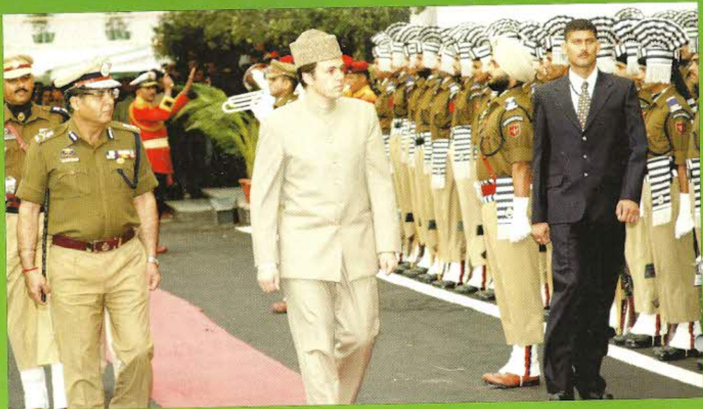
Above: Shri Omar Abdullah, Hon'ble CM J&K inspecting the Guard of Honour on the occasion of opening of Civil Secretariat in winter capital at Jammu on November 09