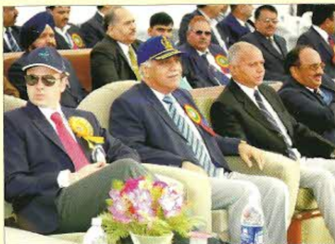
Hon'ble CM J&K along with other dignitaries witnessing the final match