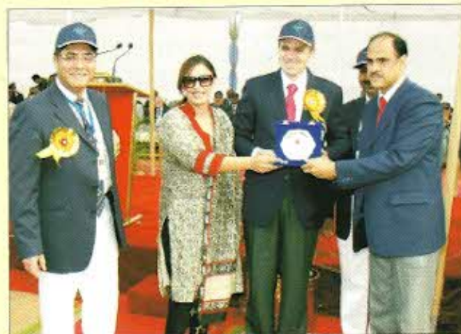
Hon'ble CM J&K presenting memento to a participant of the championship and his wife during the closing ceremony