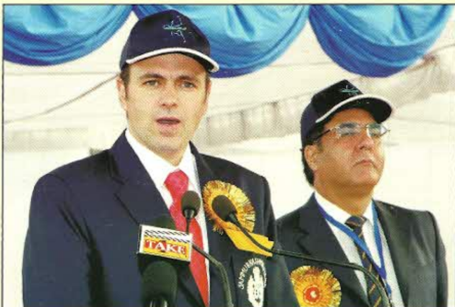
Shri Omar Abdullah, Hon'ble Chief Minister J&K addressing the gathering during the closing ceremony of 10th All India Police Lawn Tennis Championship at Jammu on November 27, 2009

The department of Youth Services & Sports has been directed to focus on creating wide ranging sports infrastructure across the state as the government has earmarked adequate funds in the current years plan for the purpose at the district level--- Hon'ble CM added.