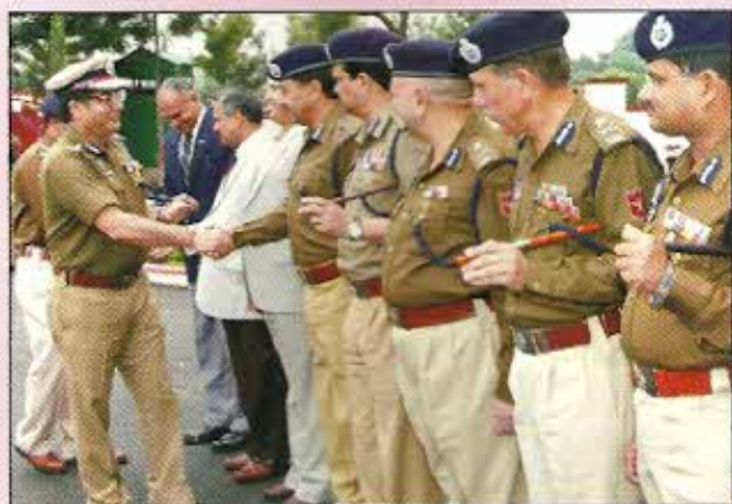
DGP J&K shaking hands with the senior police officers during the reopening of PHQ J&K at Jammu

The DGPJ&K had a round of various Police establishments at PHQ complex and interacted with the officers and jawans. He made enquires about their accommodation and transport facilities available to them and other welfare matters.