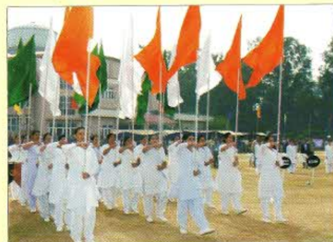
March past by Women Police contingent of J&K Police holding the multi coloured flags during closing ceremony