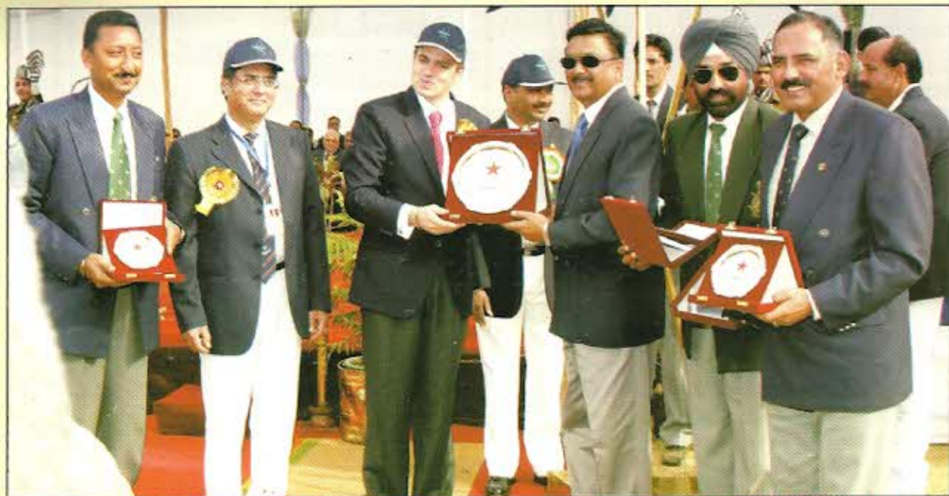
Shri Omar Abdullah, Hon'ble Chief Minister J&K presenting mementoes to the participants of 10th All India Police Lawn Tennis Championship at Jammu during the closing ceremony on November 27, 2009