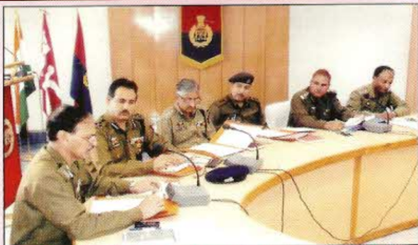
A view of the meeting on disaster management presided over by Shri S.Gopal Reddy IPS IGP HG/CD/Aux. Police J&K on November 12, 2009

The main purpose for holding this meet was to make the general public aware for taking preventive measures during natural and man made disaster and also to provide First Aid and carry out rescue and evacuation operations during accidents, Earthquake, floods etc. Shri P.R.Manhas, IPS, DIG HG/CD/Aux.