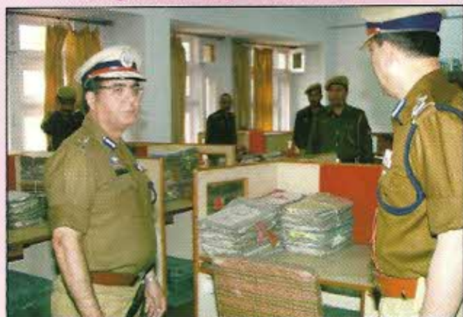
DGP J&K inspecting various sections of PHQ on the opening day at Jammu.