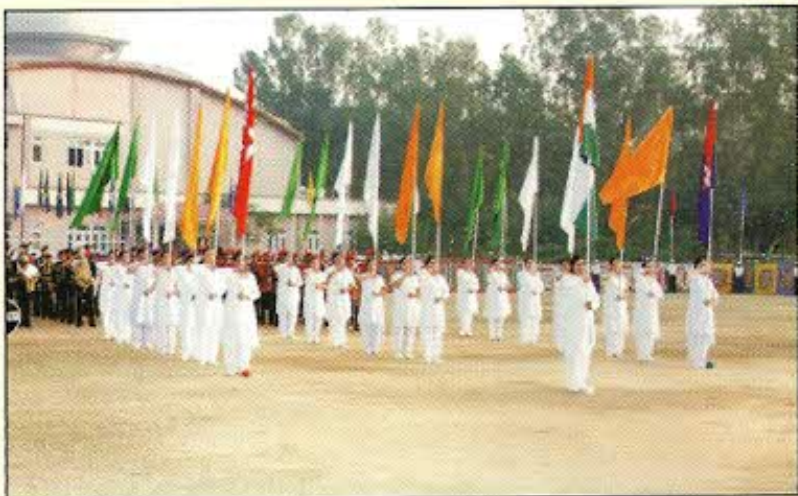
A view of the inaugural ceremony of 10th All India Police Lawn Tennis Championship 2009 at Gulshan Ground Jammu on November 23, 2009

While wishing the visiting teams all success, the Chief Guest at the inaugural function also wished for visitors comfortable stay in the hospitable environment of the winter capital of the state.