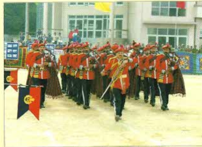
A view of the display of Pipe Band of J&K Police during the closing ceremony