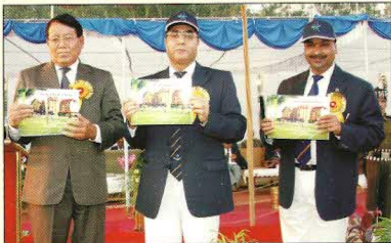
A view of the Release of Souvenir of 10th All India Police Lawn Tennis Championship 2009 on the inaugural ceremony on November 23, 2009