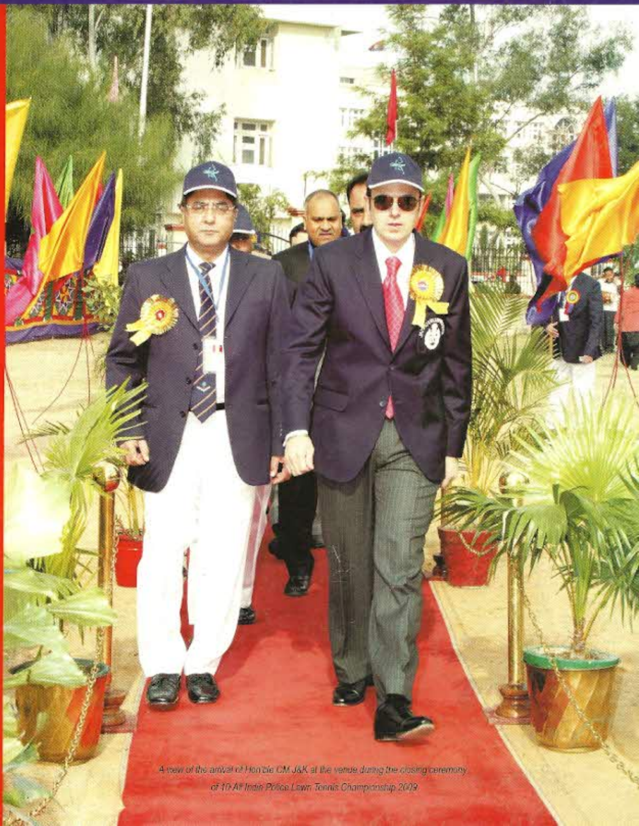
A view of the arrival of Hon'ble CM J&K at the venue during the closing ceremony of 10 th All India Police Lawn Tennis Championship 2009