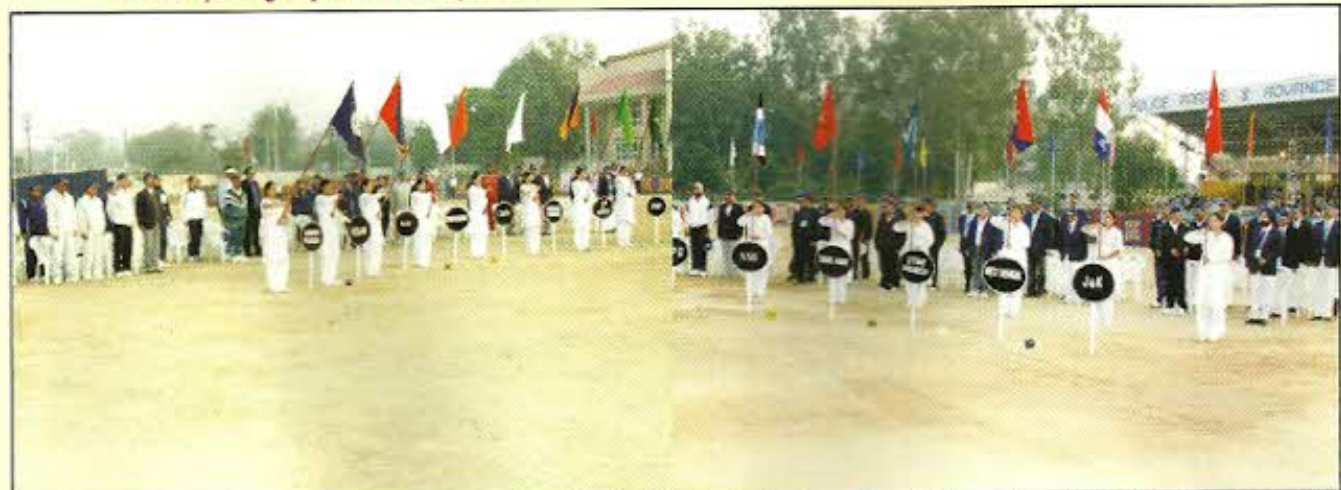
A view of the line up of the participating teams of 10th All India Police Lawn Tennis Championship 2009 on the inaugural ceremony on November 23, 2009 at Gulshan Ground Jammu

"We swear that we will take part in 10th All India Police Lawn Tennis Championship in fair competition, respecting the regulations, which govern them and with the desire to participate in them in true spirit of sportsmanship for the honour of our nation and glory of sports".