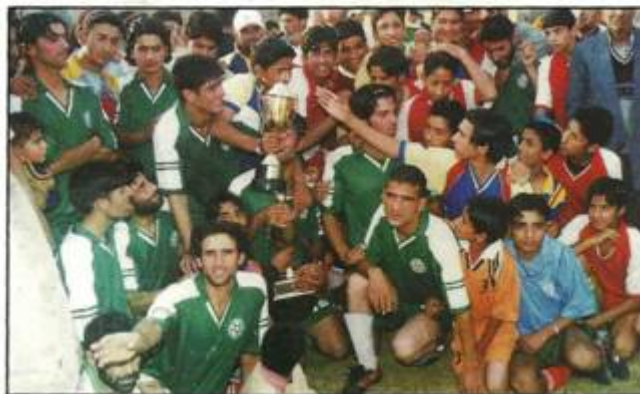
Group photograph of the finalists of Dilsoz Football Tournament, organized by J&K Police under Civic Action Programme

The final was played between Dilsoz Club Natipora- XI and Red Novelty Channapora- XI, in which Dilsoz Club Natipora- XI emerged winners, beating their rivals by four Goals to two, in tiebreaker.