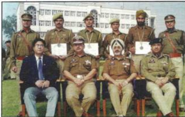
Felicitated sports personnel posing for a photograph with DGP, J&K, and other senior police officers during the function held on Nov. 06