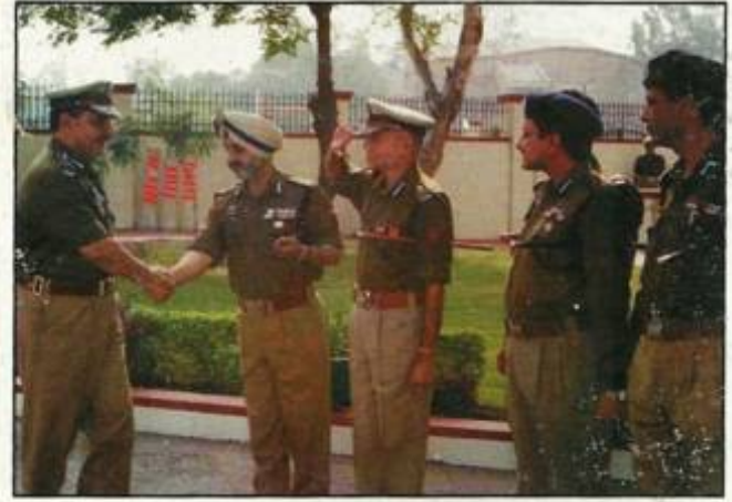
۶ نومبر کو جموں میں دربار کھلنے کے موقع پر ریاستی پولیس کے ڈائریکٹر جنرل جناب گوپال شرما کی آمد پر پولیس کے افسران اعلیٰ موصوف کا استقبال کرتے ہوئے۔