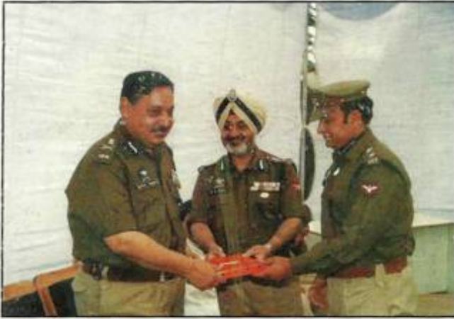
۶ نومبر کو جموں کے ساحل پولیس ہیڈ کوارٹر میں منعقدہ ایک تقریب پر ریاستی پولیس کے ڈائریکٹر جنرل جناب گوپال شرما سپورٹس ایفسر شری فیصل قریشی Dy SP کو یادگاری تحفہ پیش کرتے ہوئے۔