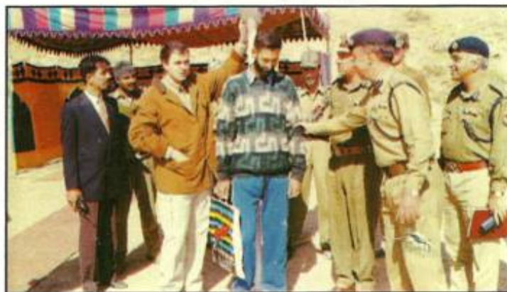
A view of on-the-spot recruitment drive at village Salena (Ganderbal). Sh. Omar Abdullah, Union Minister of State is also seen in the picture.

He also congratulated Principal and his staff for having imparted quality training to the trainees which was quite evident from their turnout and the drill.