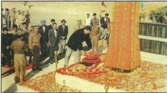
ABOVE: Sh. Omar Abdullah, Union Minister of State laying a wreath at the Police Martyrs Memorial.

On Oct. 21, 41st Annual Police Commemoration Day was observed throughout the State with the renewed commitment to wipe-out militancy and bring back peace and tranquillity.