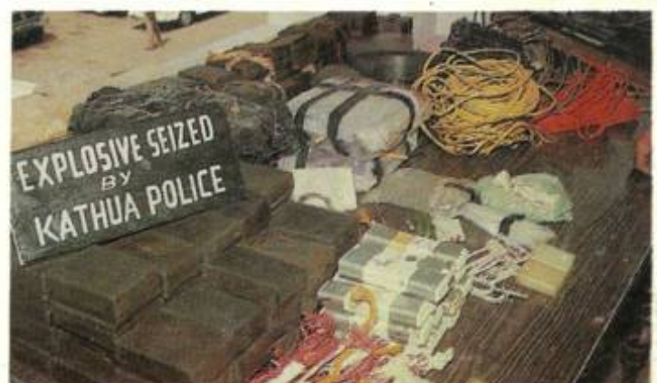
Explosives recovered by Kathua Police from the Border belt.

Acting on the intelligence inputs that Inter-Services Intelligence (ISI) has pushed in large