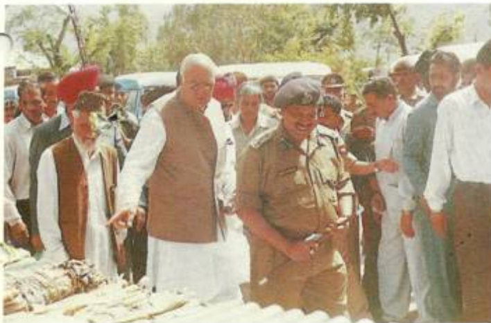
Dr. Farooq Abdullah, CM, J&K, inspecting the weapons & Ammunition recovered by Police in Poonch District, on April 13.