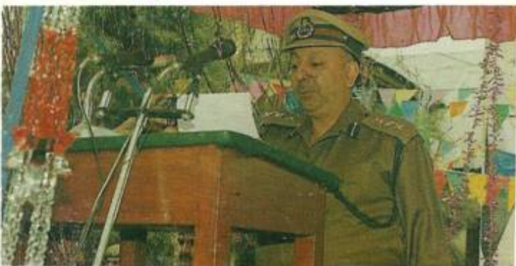
Below : Commandant, 1st battalion, Auxiliary Police, Srinagar, Addressing the Jawans on the Raising Day function at Barzulla, Srinagar, on April 01.