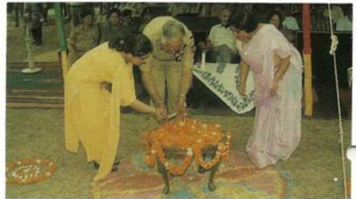
DGP, J&K, Lighting the traditional lamp on the first Annual day function of J&K Police Public School, Jammu, on April, 27.

The first Annual Day function of J&K Police Public School was celebrated in the DPL campus, Jammu,