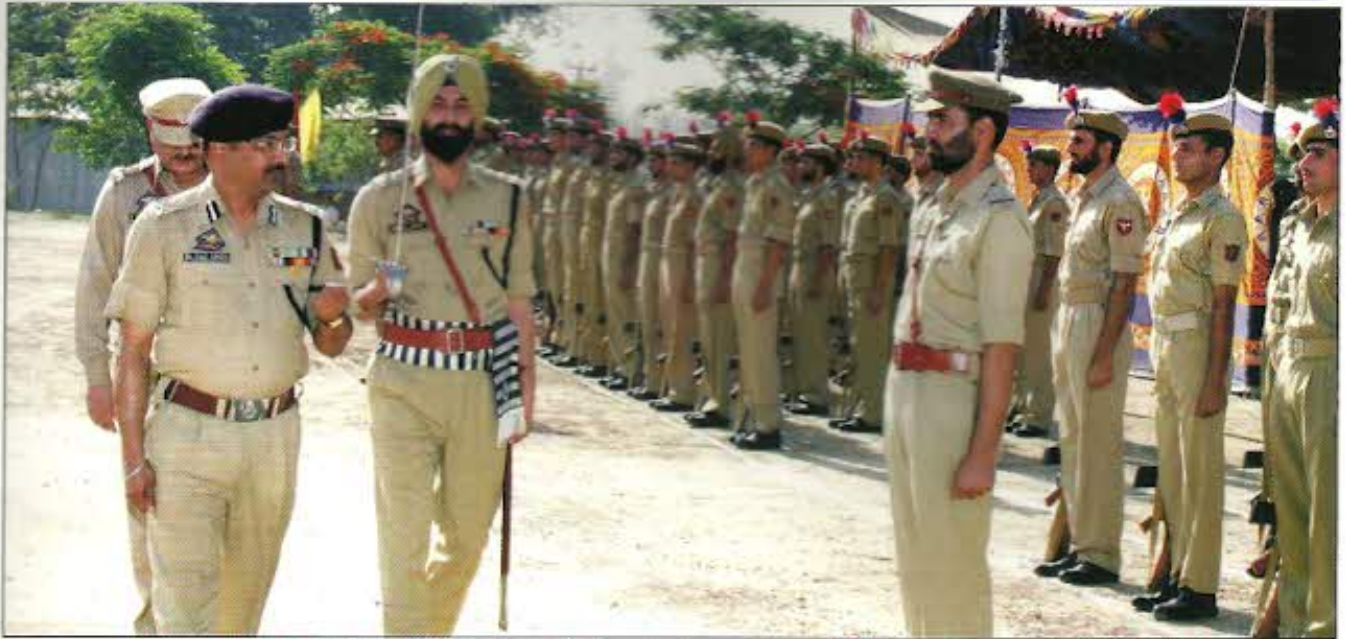
IGP Armed J&K Shri Dilbag Singh IPS conducting the inspection of 4 th Raising Day parade of IRP 11 th Bn. at Miran Sahib Jammu on May 16, 2010

Raised vide Govt. Order No. 167(P) of 2006 dated 16.05.2006, IRP 11 th Battalion celebrated its 4th