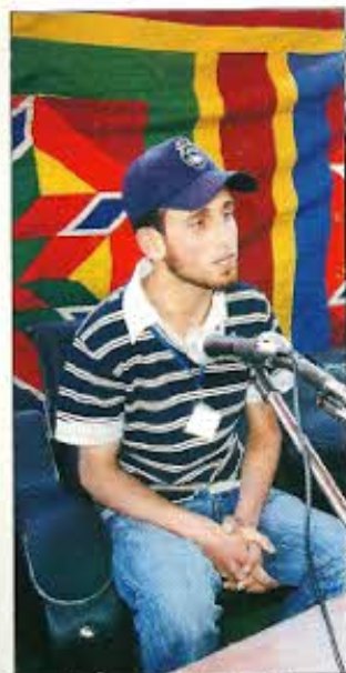
A student sharing his experience after Bharat Darshan Tour during the function at DPL Srinagar