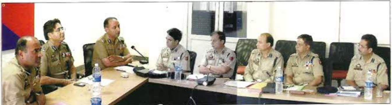
A view of the crime review meeting chaired by DGP J&K at PCR Srinagar on May 15, 2010