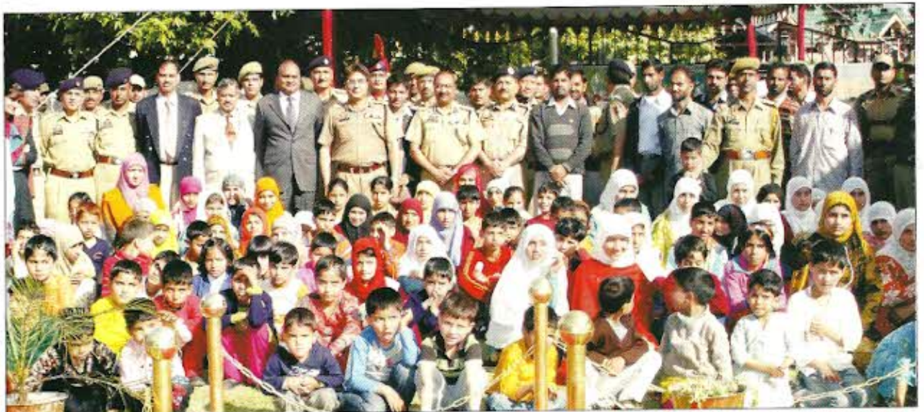
A group photograph of Valley based orphan children of Basera-e-Tabasum with DGP J&K and other senior Police officers clicked in the lawns of PHQ J&K at Srinagar on May 11, 2010

While addressing the function DGP J&K urged the NGOs to provide a helping hand to the deserving students in getting education so that they get expertise in different fields of life. He said that J&K Police is