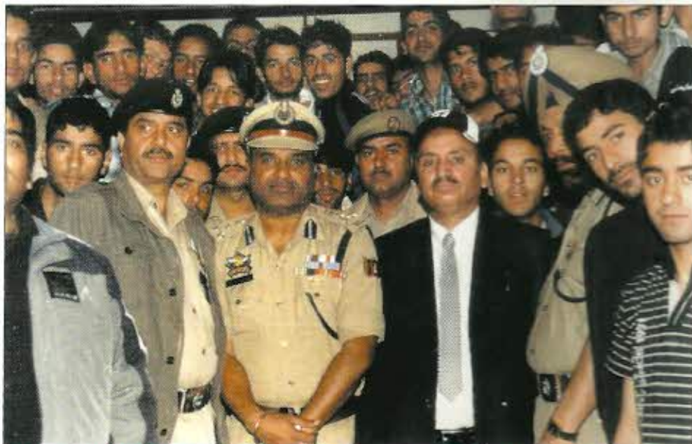
After returning from the tour Students of Distt. Budgam and senior police officers including DIG CKR Shri H.K. Lohia IPS and SSP Budgam Shri Aftab Ahmad Kakroo posing for a photograph on May 05, 2010 at DPL Budgam

A similar six days long Bharat darshan/ educational tour was organized by SP Budgam for 68 students of various govt. schools of distt. Budgam and on their return from the tour a function presided by DIG CKR was organized at DPL Budgam to bid farewell to these students.