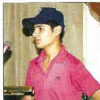
A Jammu based student sharing his experience after Bharat Darshan Tour during the function at Jammu

The DIG Jammu-Kathua Range interacted with the children who expressed their satisfaction with the tour arrangements