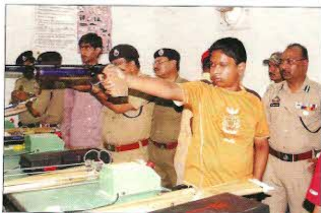
Children practising shooting from the weapon presented to J&K Police Indoor Shooting Range Jammu by the DGP J&K on May 26, 2010

The weapons provided to the shooting range include Air Pistol Morini and Air Rifle Feinwerkbau (P-700) procured from National Rifle Association of India through J&K Rifle Association.