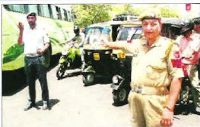
A woman Headconstable of J&K Police is seen performing traffic regulation duty in Jammu city immediately after the idea mooted by DGP J&K was implemented in the two capital cities of the State