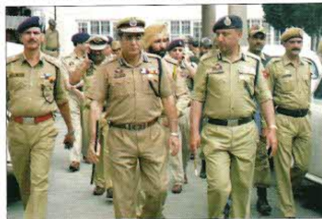
Visit of DGP J&K to ZPHQ Kashmir, Hqrs. of HG/CD/Aux. Police, Security and PHC on May 10, 2010