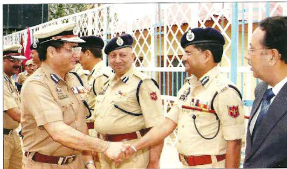
DGP J&K being received by senior police officers at PHQ srinagar on May 10, 2010

During the meeting detailed discussions were