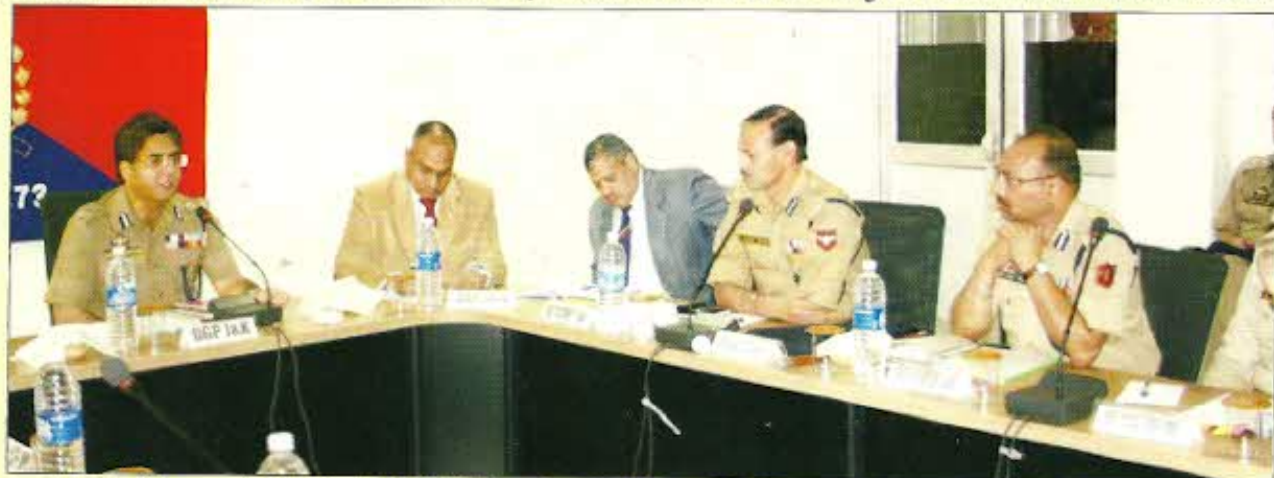
A view of the meeting chaired by DGP J&K on May 24, 2010 at PCR Srinagar to review the security arrangements for smooth conduct of Shri Amar Nath Ji Yatra 2010

During the meeting all the issues pertaining to foolproof security arrangements for smooth conduct of yatra were discussed and necessary instructions issued to the concerned officers for strict compliance. The meeting was attended by senior officers of all wings of Jammu & Kashmir Police.