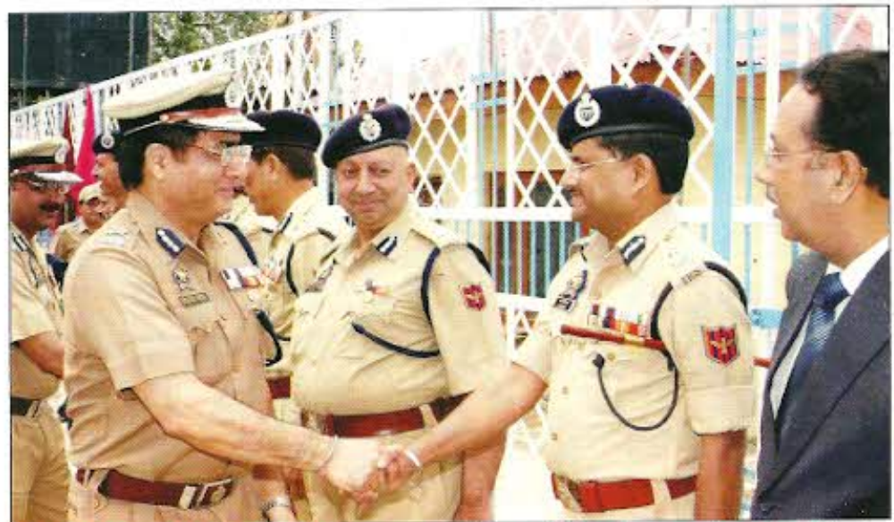
DGP J&K being received by senior police officers at PHQ srinagar on May 10, 2010

During the meeting detailed discussions were