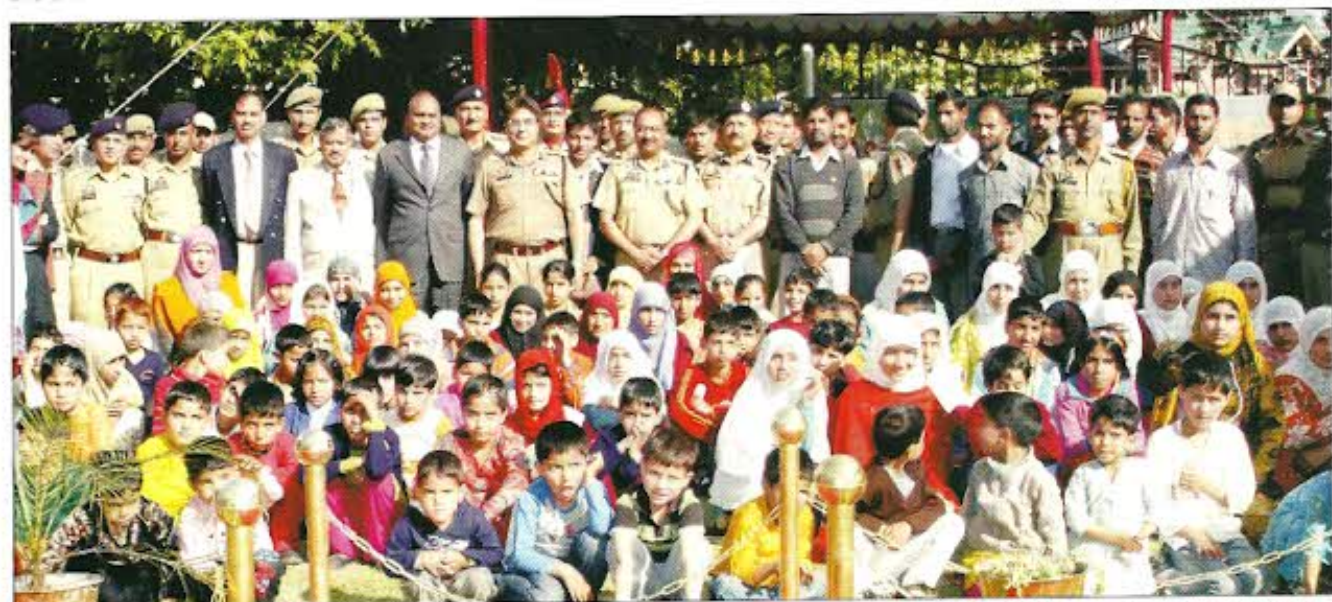
A group photograph of Valley based orphan children of Basera-e-Tabasum with DGP J&K and other senior Police officers clicked in the lawns of PHQ J&K at Srinagar on May 11, 2010

While addressing the function DGP J&K urged the NGOs to provide a helping hand to the deserving students in getting education so that they get expertise in different fields of life. He said that J&K Police is