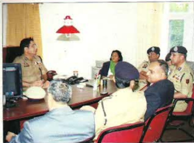
DGP J&K chairing a meeting of senior officers in CID Hqrs. at Srinagar on the opening of durbar on May 10, 2010

held for ensuring better traffic management in the cities of Srinagar, Jammu and major towns of the State. The DGP also stressed upon the Traffic Police to strictly maintain the smooth flow of traffic preferably in the peak hours of morning and evening