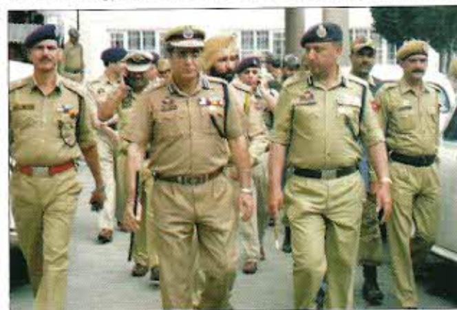
Visit of DGP J&K to ZPHQ Kashmir, Hqrs. of HG/CD/Aux. Police, Security and PHC on May 10, 2010