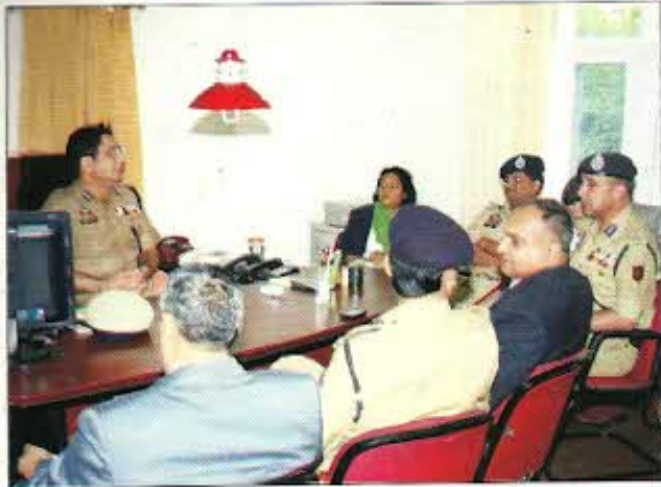
DGP J&K chairing a meeting of senior officers in CID Hqrs. at Srinagar on the opening of durbar on May 10, 2010

held for ensuring better traffic management in the cities of Srinagar, Jammu and major towns of the State. The DGP also stressed upon the Traffic Police to strictly maintain the smooth flow of traffic preferably in the peak hours of morning and evening