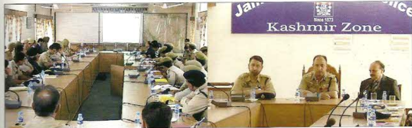
A view of the training session organized by IGP Kashmir for the Dy. SsP and SHOs of Kashmir Zone at ZPHQ Srinagar on May 17, 2010

Bank of India (RBI) for imparting training to our SHOs and supervisory officers, so that they are in a better position to identify fake currency and take further legal action into the matter".