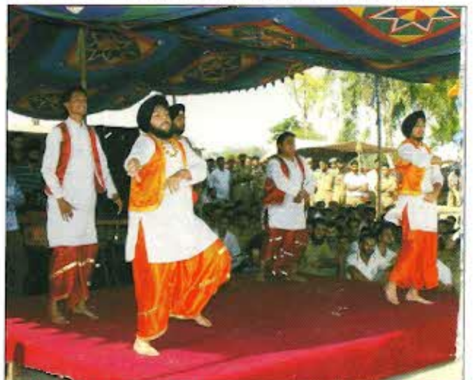
A view of the Punjabi Bhangra presented by jawan of IRP 11 th Bn. during the Raising Day celebration of their unit on May 16, 2010

The IGP Armed advised the concerned Commandants to extend every possible help to the