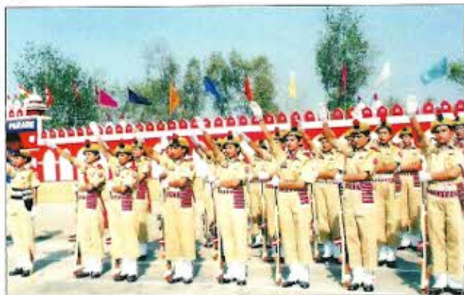
Lady constables taking the oath of allegiance during the passing out parade at Sher-i-Kashmir Police Academy Udhampur on May 04, 2010