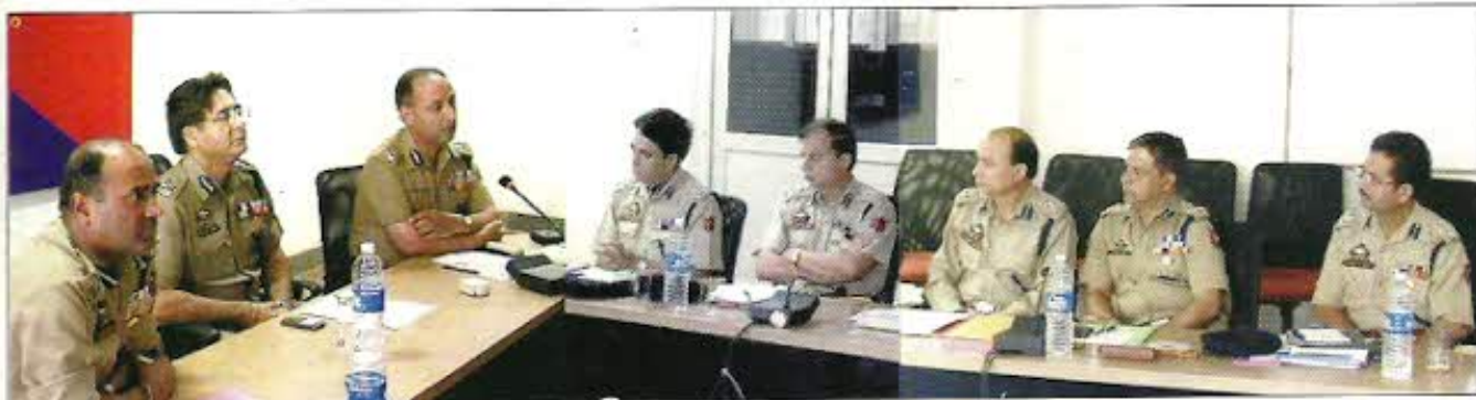
A view of the crime review meeting chaired by DGP J&K at PCR Srinagar on May 15, 2010