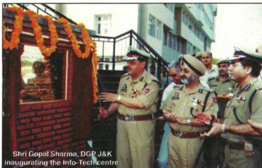
Shri Gopal Sharma, DGP J&K inaugurating the Info-Tech centre

The centre, equipped with latest state-of-art-technology gadgets, shall provide fast and dependable means of communication and prove as a force multiplier for providing prompt and best possible service to the people: DGP, J&K.