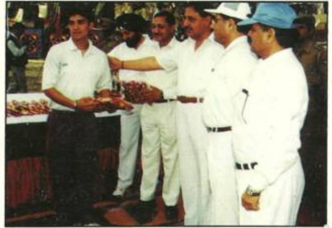
۲۳ مارچ میں کھیل کے میدان میں حاصل امتیازی کامیابی کے سلسلہ میں ۱۹ مارچ کو منعقدہ ایک تقریب پر ریاستی پولیس کے ڈائریکٹر جنرل کھیل اڑیوں کو تحفہ جات اور انعامات سے نوازتے ہوئے۔