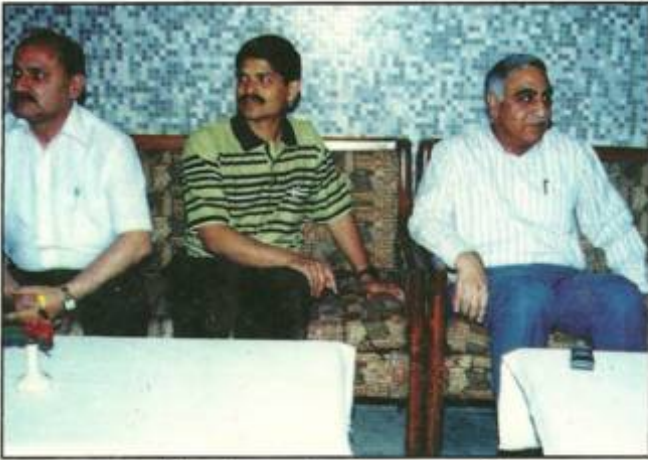
ڈاکٹر اشوک بھان (دائیں سے نمبر ایک) ایڈیٹریل ڈائریکٹر جنرل پولیس کی وینچلس آرگنائزیشن میں محفل وینچلس کیشر کی تقریب پر ۲۳ مارچ کو ان کے اعزاز میں دئے گئے استقبال پر کھینچی گئی تصویر۔