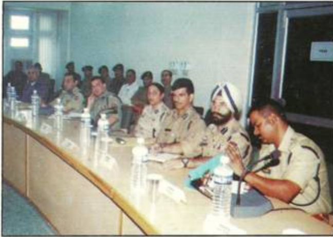
۲۳ مارچ کو جموں کے آرٹس پولیس ہیڈ کوارٹر میں منعقدہ ریاستی سطح پولیس کے کانفرنس ساجہان کی سالانہ کانفرنس کی افتتاحی تقریب کا ایک منظر۔