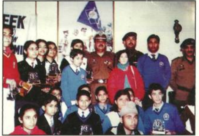
روڈ سٹیٹ ہفتہ کے دوران عوام الناس کو 'ٹریفک سے متعلق واقفیتی پروگرام' کے سلسلہ میں نمایاں کردار ادا کرنے کے سلسلہ میں سکولی بچوں کو یادگاری تحفہ جات سے نوازنے کی تقریب پر کھینچی گئی ایک گروپ تصویر۔