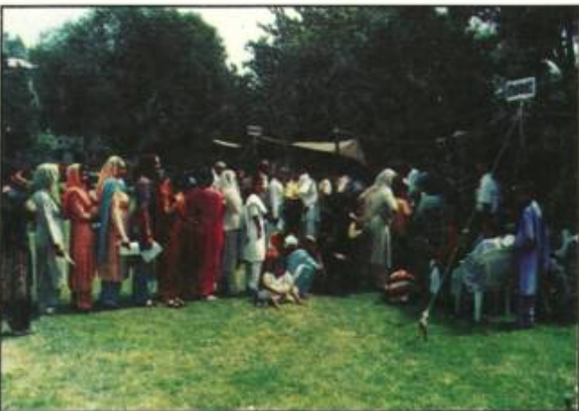
۳۰ مارچ کو ضلع پولیس لائن جموں میں ریاستی پولیس کی جانب منعقدہ ایک 'مٹھ ٹیڈکپ' میں ڈاکٹری مشورہ وادویات حاصل کرنے کی خاطر لوگوں کی بھیڑ کا ایک منظر۔