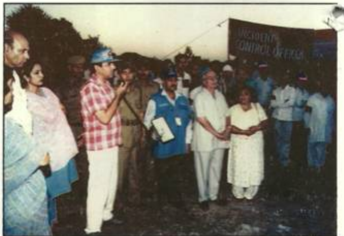
واقفیتی پروگرام برائے بول ڈینس کے تحت منعقدہ ایک تقریب کے دوران جناب شیخ اودیس احمد ڈپٹی انسپکٹر جنرل پولیس ہوم گارڈس بول ڈینس ایک مظاہرہ پیش کرتے ہوئے۔