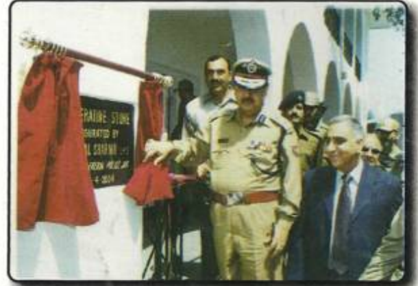
۱۹ اپریل کو پولیس کنٹرول روم سرینگر کے احاطہ میں گواہ بریٹو ڈیپارٹمنٹل سنور کی نئی تعمیر شدہ عمارت کی افتتاحی تقریب کے رسم پر ریاست کے ڈائریکٹر جنرل جناب گوپال شرمہ۔