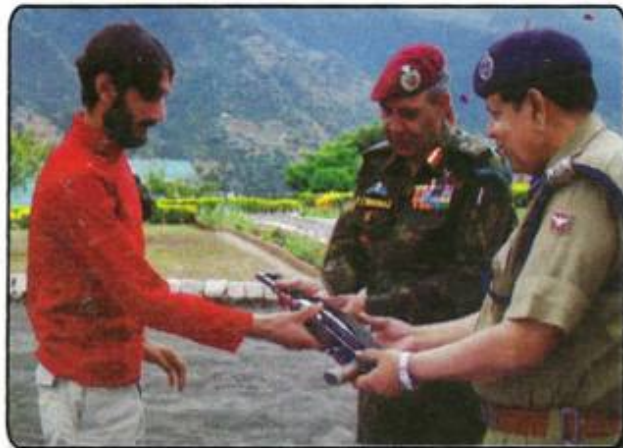
DIG, Udbampur-Doda Range (right) receiving a gun from a surrender militant at function held at Batote on April 17.

Surrendering and laying down arms before the Police and Army authorities, by the terrorists, has become a continuing process in the state. The surrenders during the month of April included: