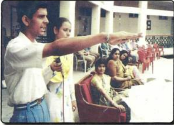
۲۱ اپریل کو پولیس پبلک سکول جموں میں منعقدہ ایک تقریب پر محترمہ و ملا شرمہ چیئر پرسن سٹیٹمنٹ پبلسٹی پولیس پبلک سکول۔