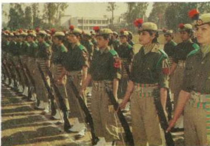
A contingent of women police participating in ceremonial parade at the venue of investiture ceremony.