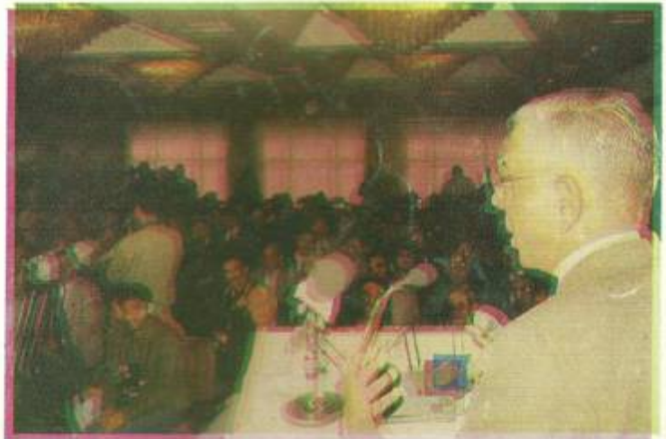
Shri M.K. Narayanan, former Director IB, delivering the lecture.