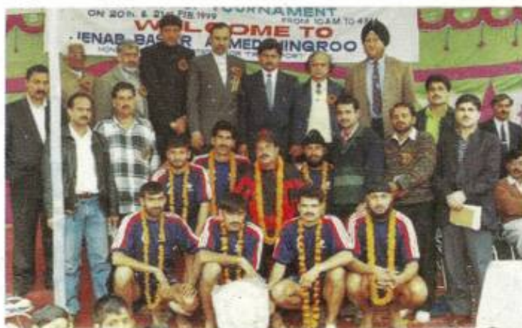
J&K Police team, winners of Kabaddi tournament.

★ Hockey team of J&K Police won the State Hockey championship defeating Baramulla district.