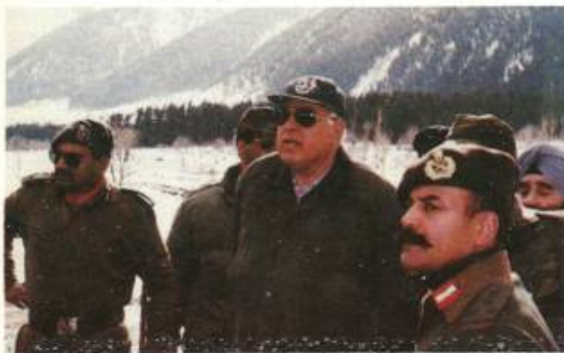
Dr Farooq Abdullah, Chief Minister, during a visit to Marwah in Doda district.

Chief Minister, Dr Farooq Abdullah, has lauded the role of Border District Police in Jammu and shown his desire to further expand this concept in the state to build a second line of defence to thwart attempts of