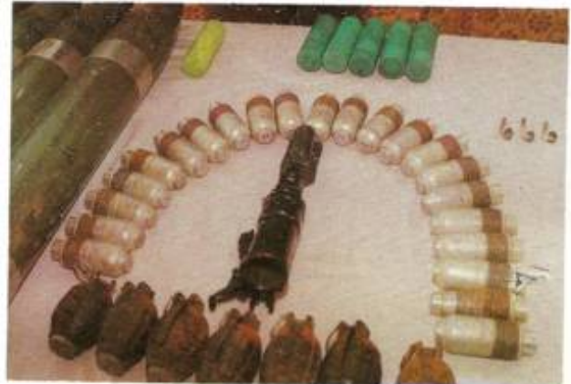
Some recoveries made by STF Kupwara

The State Police will shortly acquire a Fire Arms Training Simulator (FATS) and a computerised Finger Print record system. The FATS will be used for imparting training in firing of sophisticated weapons without wasting ammunition. For the first time a Finger Print Bureau will be set up in the State as hitherto the State Police has been using services of the Finger Print Bureau at Phillaur in Punjab. The Finger Print equipment will be able to store 30,000 ten-digit prints which can be compared with chance prints obtained from a scene of crime. It can handle 50 ten-print searches and 5 latent print searches per day.