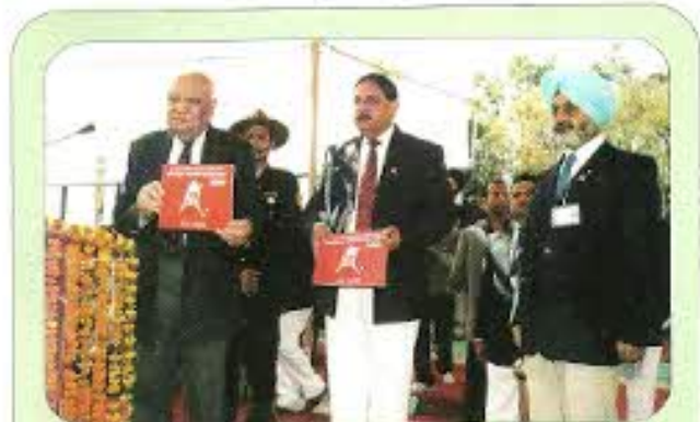
HE, the Governor, Lt General (Retd) S.K. Sinha J&K while releasing the Souvenir at the inaugural function

An exhibition match was played between J&K Police veterans and J&K Hockey Association veterans at the inaugural function, which was won by J&K Police veterans by two goals to nil. HE, the Governor gave away the winner and runner up trophies to the teams.