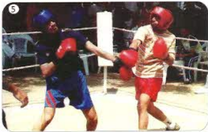
1, 2, 3, 4 and 5: Sportsmen in action in the events of Volleyball, Hockey, Tug of War, Wrestling and Boxing.