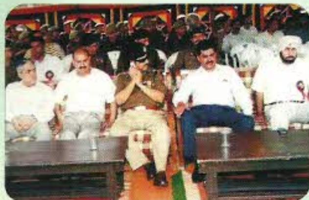
A cross section of guests at the inaugural function of Police Friendship Cricket Tournament.