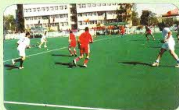
J&K Police veterans XI and J&K Hockey Association veterans XI in action during the exhibition match at the inaugural function