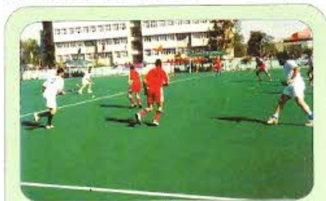
J&K Police veterans XI and J&K Hockey Association veterans XI in action during the exhibition match at the inaugural function