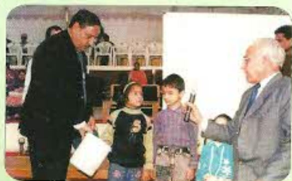
A view of the Raffle Draw at the venue of Mela