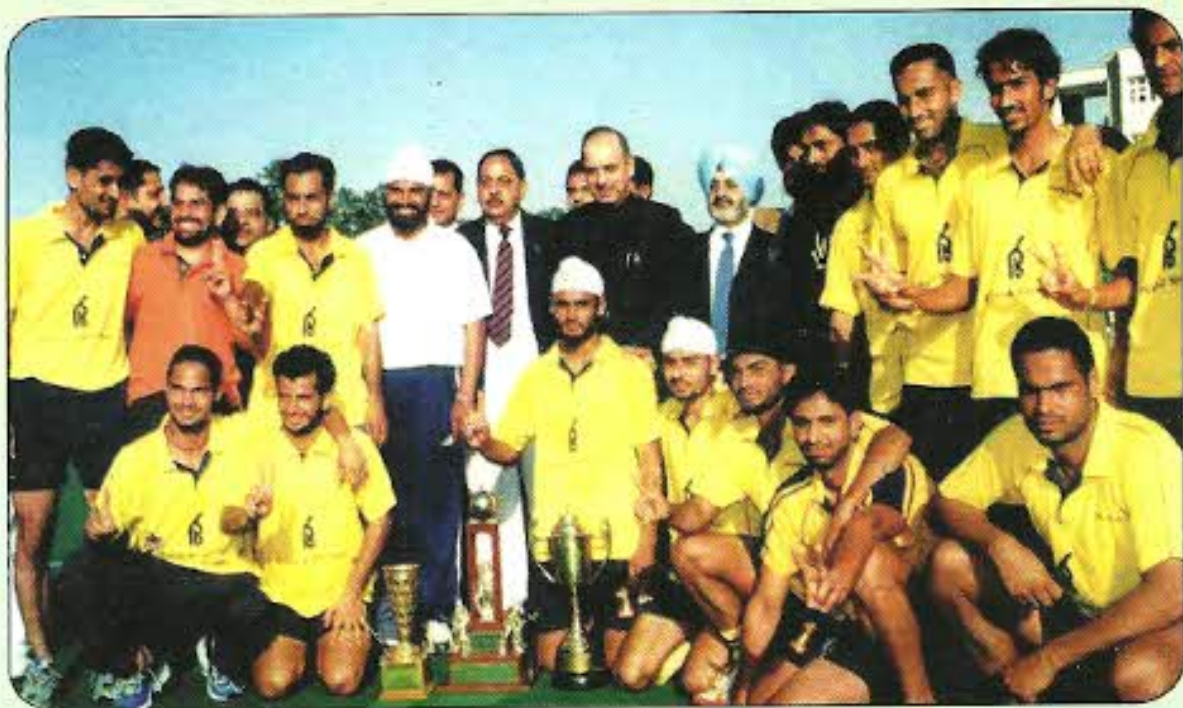
Jubilant Punjab & Sindh Bank XI, the winners of the Tournament, posing for a group photograph with Hon'ble CM J&K