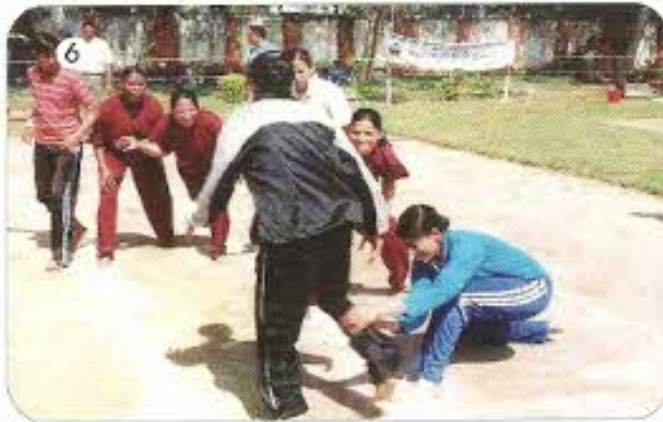
1, 2 and 3: Shri Gopal Sharma, DGP J&K presenting Trophies to sportswomen of J&K Police. 4, 5 and 6: sportswomen of J&K Police in action in the events of Handball, Basketball and Kabaddi, during Interbattalion sports meet - 2007.