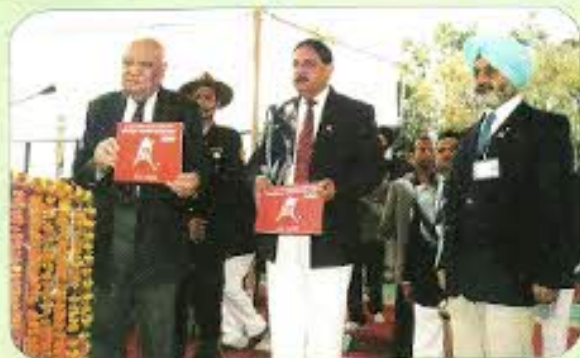
HE, the Governor, Lt General (Retd) S.K. Sinha J&K while releasing the Souvenir at the inaugural function

An exhibition match was played between J&K Police veterans and J&K Hockey Association veterans at the inaugural function, which was won by J&K Police veterans by two goals to nil. HE, the Governor gave away the winner and runner up trophies to the teams.