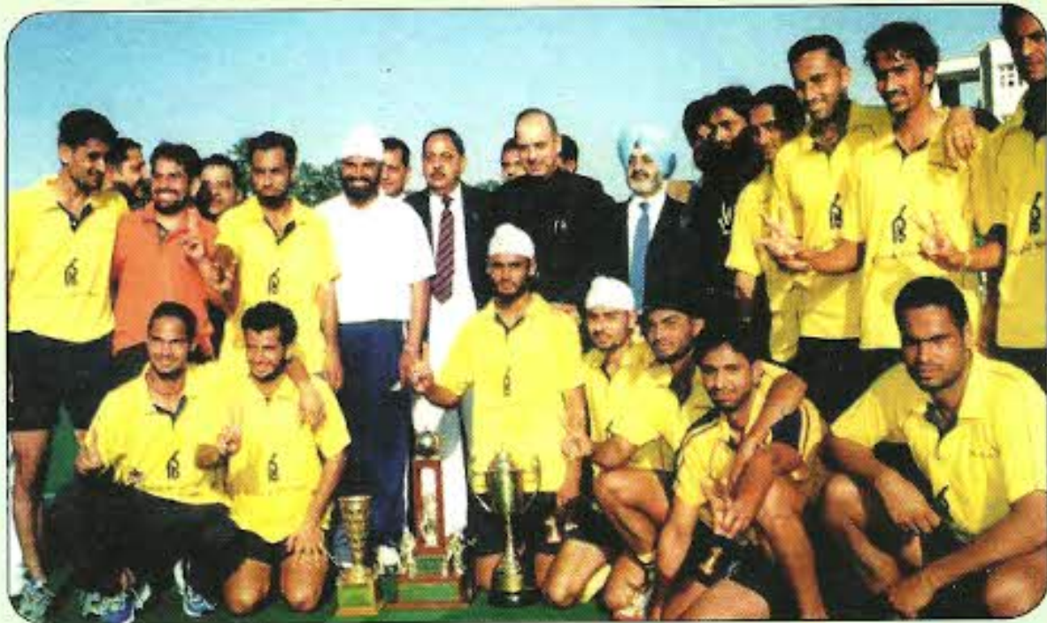
Jubilant Punjab & Sindh Bank XI, the winners of the Tournament, posing for a group photograph with Hon'ble CM J&K