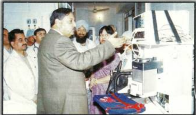
DGP, J&K inaugurating the hi-tech instruments at Police Hospital, Srinagar on February 19