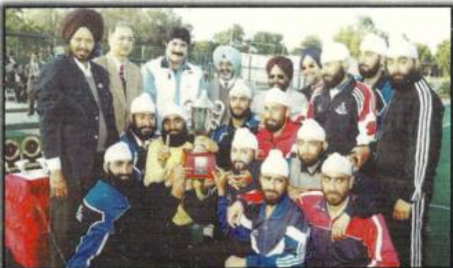
Jubiliant J&K Police Hockey team that clinched the Gajinder Memorial State Hockey Championship Trophy