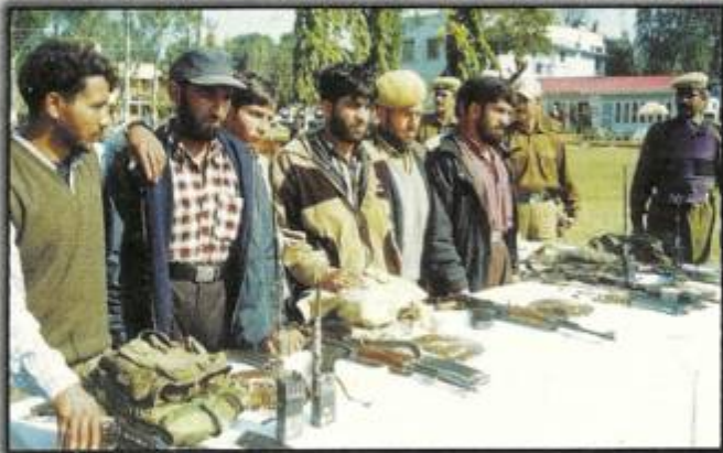
Below: Weapons and ammunition laid down by the militants at Kathua on display