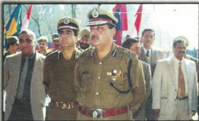
DGP J&K flanked by the senior officers at the conclusion of the route march of Armed Police at Sidhra