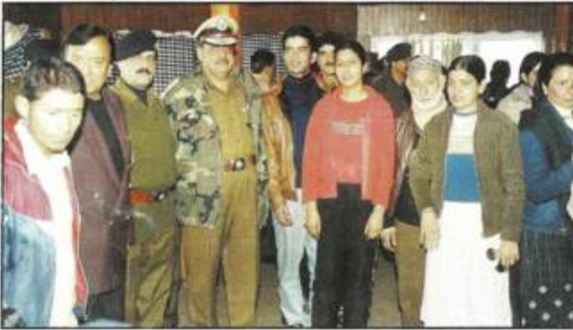
مہارانی کالج پورہ ندویشی ہے پور کی طالبات کی تحریک میں سرکاری کھیلوں میں شرکت کی اختتامی تقریب پر لی گئی ایک تصویر۔