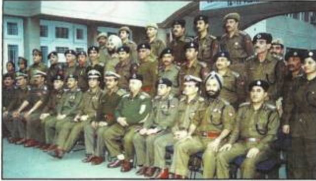
ریاستی مسلح پولیس کے کمانڈنٹ صاحبان کی سالانہ کانفرنس کے اختتام پر لی گئی ایک گروپ تصویر۔