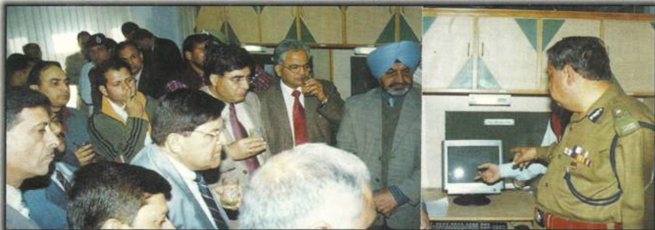
DGP, J&K Inaugurating the J&K Police website at the Police Headquarters, Jammu on Feb. 21.

www.jkpolice.com — J&K POLICE WEBSITE ON THE INTERNET