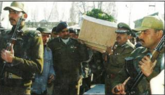
شہید مہاشن بھٹ ڈی آئی۔ سی کے جسدِ خاکی کو ریاستی پولیس کے اہلکار پیکٹر جزل اور کشمیر زون کے انسپکٹر جزل کنڈھادیے ہوئے۔