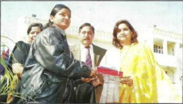
محترمہ وائس مہارانی کالج پورہ ندویشی ہے پور کی طالبات کو جموں میں منعقدہ ایک تقریب کے دوران فوٹو اہم پیش کرتے ہوئے۔