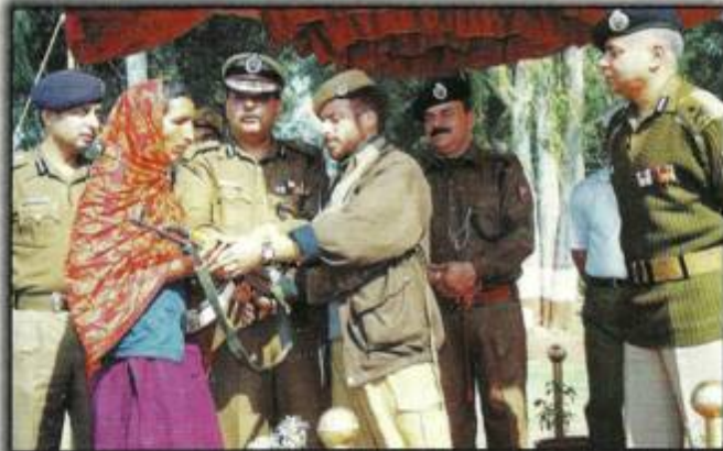
Above: Militants surrendering before the Police and laying down arms at Kathua on Feb. 14

Speaking on the occasion, the DGP expressed hope that many more militants will give up the path of violence and take advantage of the Rehabilitation Policy of the Government.