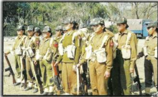
A contingent of Women Police personnel of J&K Armed Police—participants of the Marathon route march

With a view to ensuring the physical fitness, increasing the stamina and on-foot mobility of its men and achieving 'Zero Response Time' for prompt arrival in dealing with the situations, J&K Armed Police took out a 10 KM-long Road March in Jammu on February ,27. This marked the revival of such exercises as are necessary for building a vibrant force.