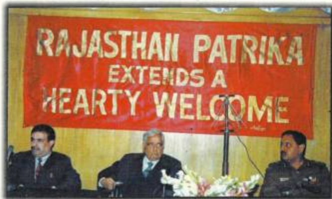
Hon'ble Chief Minister J&K (Centre), DGP, J&K (Right) and Vice Chancellor Jammu University (left) at the function to felicitate the visiting girls at Jammu on Jan 22

With an eye on fine tuning the relationship, understanding each other's religious, linguistic, cultural and ethnic character and to beef-up the inter-state/inter-regional harmony, J&K Police organized and sponsored the tour of 26-member girl student's contingent of Maharani College University, Jaipur (Rajasthan) to J&K state under the Civic Action Programme.