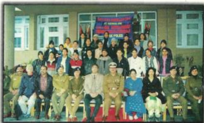
Group Photograph of the visiting girls at Police Headquarters, Jammu (Jan 22).

In the course of interaction with the visiting students, the DGP said that the tour would help them explore knowledge about the situation on ground in the state of Jammu and Kashmir. The interaction with other girl students in the state would also help them understand each other, which is essential for exploding the myths and building harmonious relations, the DGP added. "During your sojourn in the state, I hope that you shall enjoy and cherish the scenic and cultural beauty and