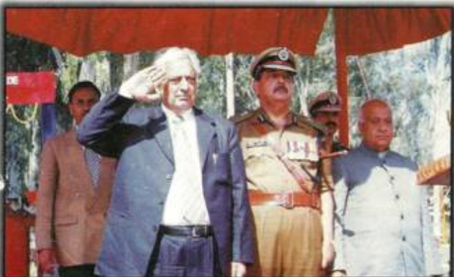
Hon'ble C.M, Jenab Mufti Mohammad Sayeed, taking salute at Prithinandan Singh Police Training School, Kathua

An Attestation cum Passing-out-Parade of 670 recruit constables including 14 women constables was held at Prithinandan Singh Police Training School, Kathua on February 26. Hon'ble Chief Minister, Jenab Mufti Mohammad Sayeed, who was the Chief Guest on the occasion, inspected the parade and took salute. Hon'ble Deputy Chief Minister, Shri Mangat Ram Sharma, and a host of senior civil and Police officers were present.