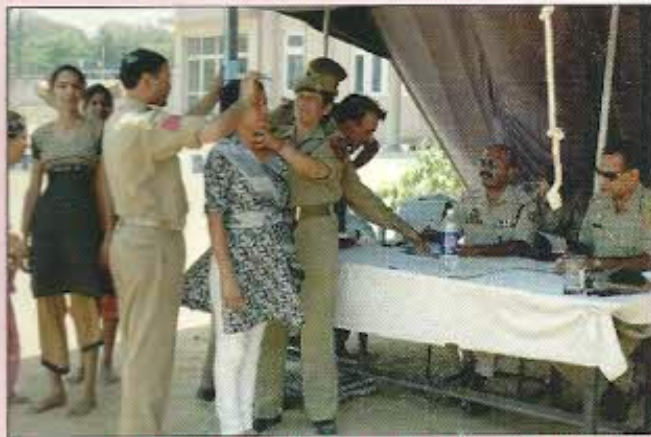
A view of the recruitment of Lady Constables in J&K Police at Gulshan Ground Jammu on June 21, 2010