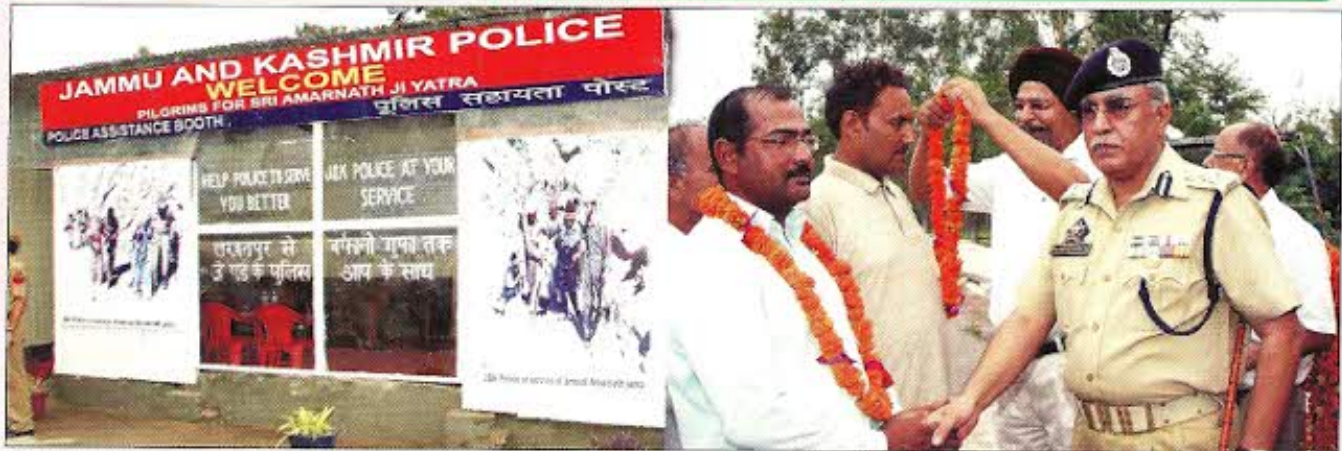
Shri Farooq Khan IPS DIG Jammu-Samba-Kathua Range during the inauguration of Assistance Booth-cum-Facilitation Centre for Shri Amar Nath Ji Yatris at Lakhanpur on June 29, 2010

Shri Farooq Khan IPS DIG Jammu-Kathua Range inaugurated the Assistance Booth-cum-Facilitation Centre for Shri Amarnath Yatris at Lakhanpur on June 29, 2010. While inaugurating the