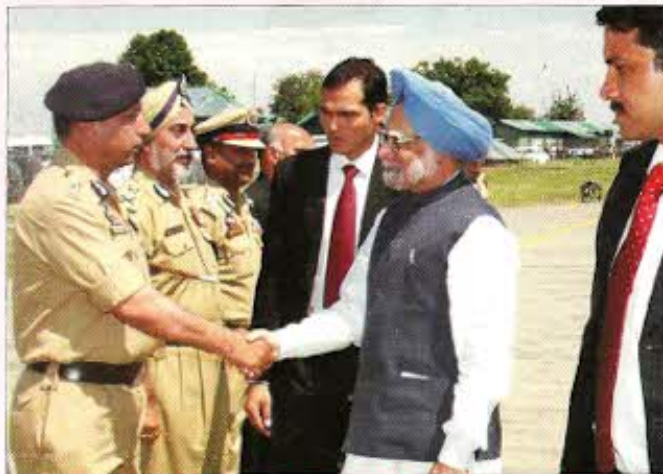
Shri Manmohan Singh Hon'ble Prime Minister of India during his arrival at the Srinagar International Airport on June 07, 2010