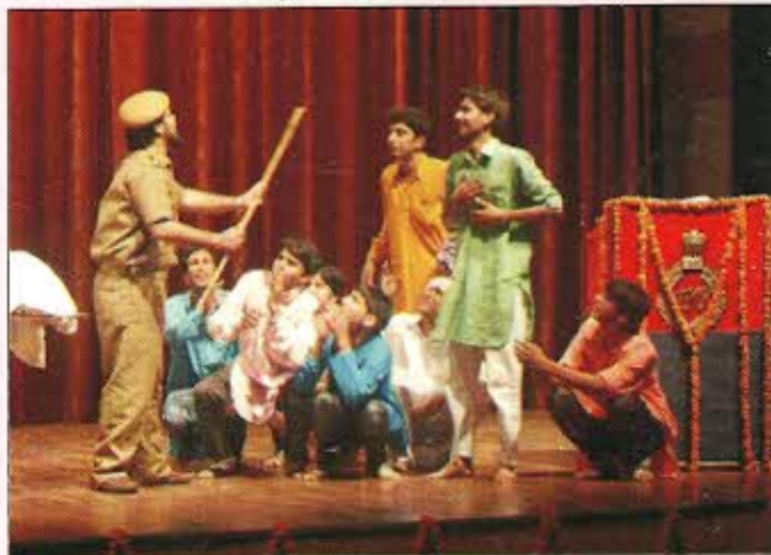
Young Artists of Natrang presenting a skit during a function held at Police Auditorium Gulshan Ground Jammu in connection with Anti Drugs & Illicit Trafficking Day on June 26, 2010

could save the society from the clutches of this social evil. He urged the youth to shun the way of drugs and start a constructive approach to life.