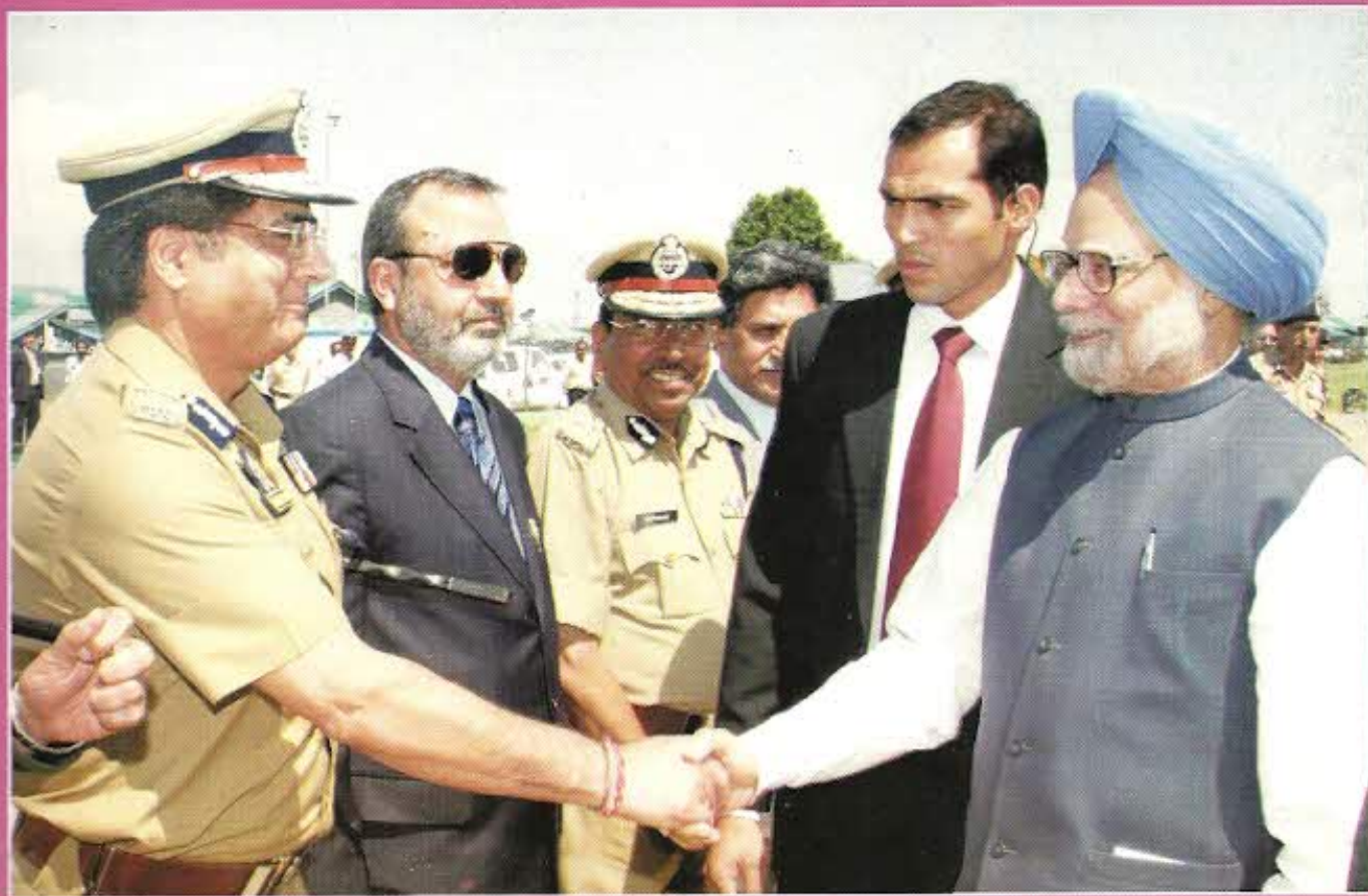
Shri Kuldeep Khoda IPS DGP J&K greeting Shri Manmohan Singh Hon'ble Prime Minister of India at Srinagar during the later's visit to Jammu & Kashmir on June 07, 2010