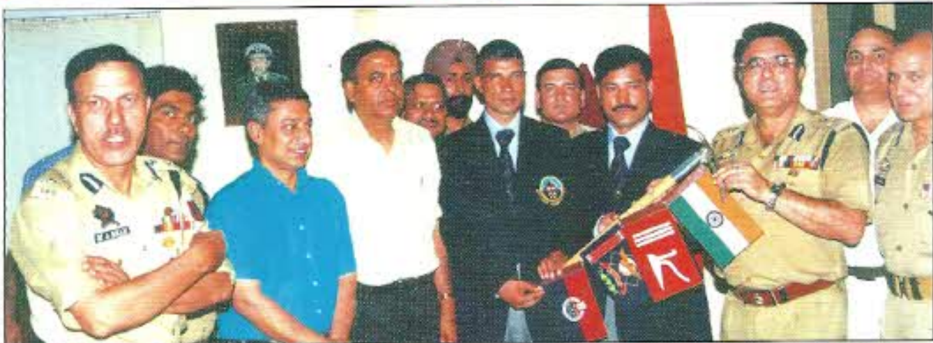
J&K Police mountaineers presenting the flag to Shri Kuldeep Khoda IPS DGP J&K during flag-in ceremony at Srinagar on June 23.

Police for scaling Mount Everest and unfurling J&K Police flag at the World's highest peak. Speaking on the occasion DGP J&K expressed satisfaction over the fact that J&K Police had taken up the Mount Everest Expedition for the first time and achieved a feat by successfully scaling it.