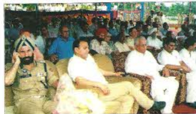
۱۴ جون ۲۰۰۹ء کو پولیس ٹریننگ سکول کشمیر میں منعقدہ پاسنگ آؤٹ پر پڈ کے موقع پر حاضرین کی ٹینیسی کی ایک تصویر۔