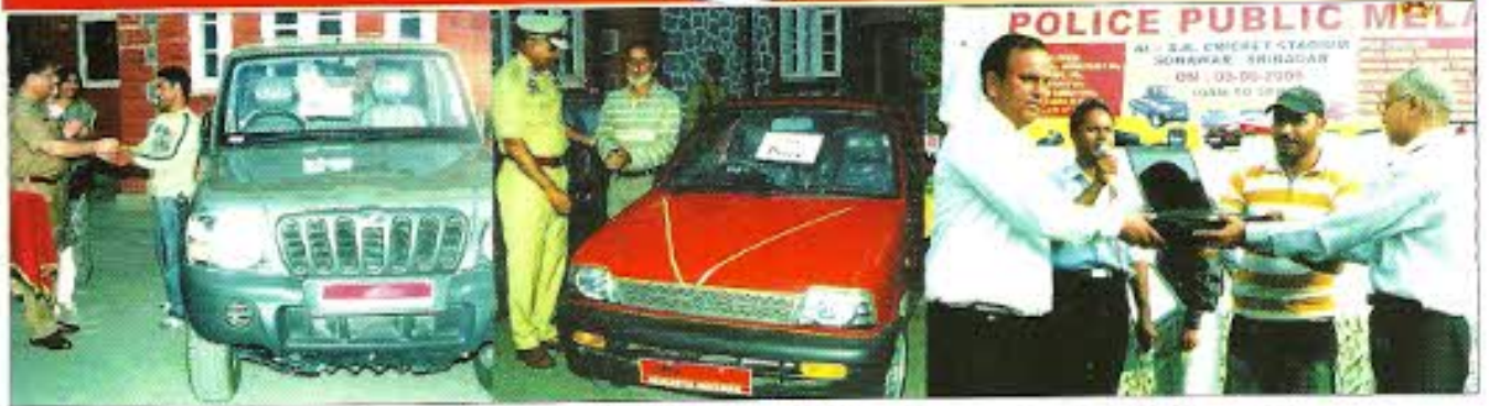
(بائیں سے دائیں) ایس ایچ او پولیس کے سربراہ جناب گلڈ پیٹھ لاجپور زون کے آئی۔ جی۔ بی جناب کے راجندر اکمار اور آئی۔ جی۔ بی بیڈگوارڈس جناب بی۔ ڈیل گپتا پولیس پبلک میٹنگ میں منعقدہ ریئل ڈراما میں اعلیٰ ہونی کار بھگوانی مارونی اور ایس ٹاپ بل ترتیب ان کے جیسٹے والوں کو ۱۸ جون ۲۰۰۹ء کو سونپے ہوئے۔