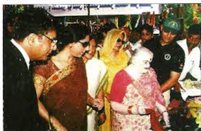
Chief Guest's visit to various stalls during Police Public Mela at Srinagar

A one day Police Public Mela was organized by J&K Police Wives Welfare Association (PWWA) at Sher-e-Kashmir Cricket Stadium Sonawar, Srinagar on June 8, 2008.