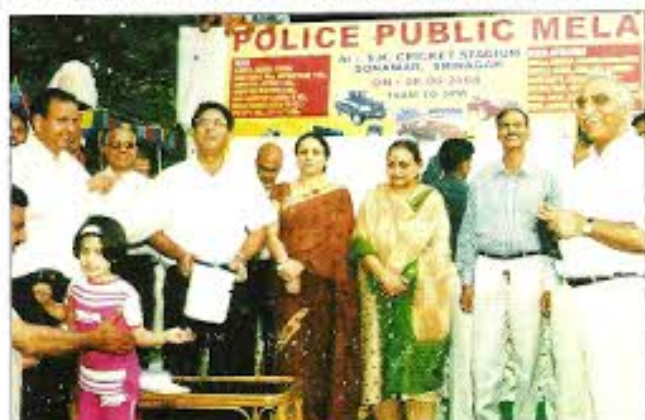
DGP J&K accompanied by senior police officers and members of PWWA conducting the raffle draw during the Police Public Mela at Srinagar