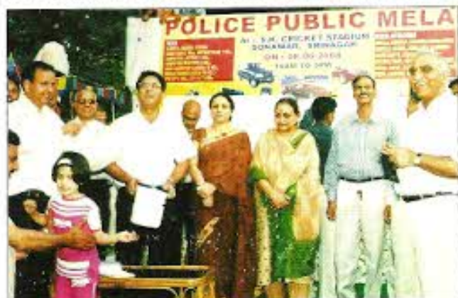
DGP J&K accompanied by senior police officers and members of PWWA conducting the raffle draw during the Police Public Mela at Srinagar