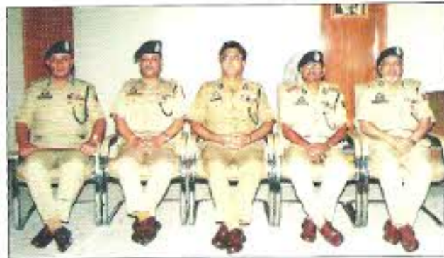
۱۰ جون ۲۰۰۹ء کو PHQ سرنگرم میں ترقی یافتہ آئی۔ جی۔ بی ساجان کی ریپ ایس ایچ او پولیس کے سربراہ جناب گلڈ پیٹھ لاجپور کے ساتھ ٹینیسی کی ایک تصویر۔