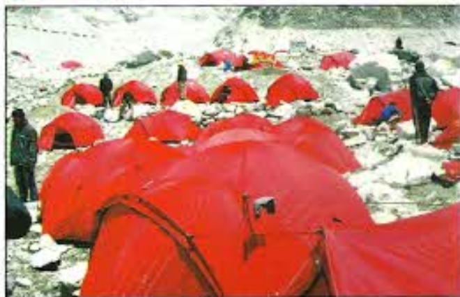
Glimpses of Mount Everest Expedition – 2008