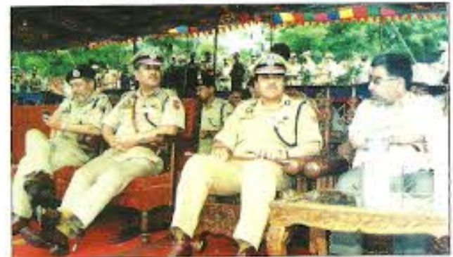
۲۰ جون ۲۰۰۹ء کو پولیس ٹریننگ سکول مٹی گاؤں سرنگرم میں منعقدہ پاسنگ آؤٹ پر پڈ کے موقع پر اعلیٰ پولیس افسران کی ٹینیسی کی ایک تصویر۔