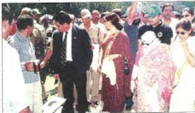
مہمان خصوصی کے سربراہ ایس ایچ او پولیس کے افسران اعلیٰ اور میران ولفیئر ایڈیشن ۱۸ جون ۲۰۰۹ء کو سرنگرم میں منعقدہ پولیس پبلک میٹ کے دوران مختلف سالوں کا معاہدہ کرتے ہوئے۔