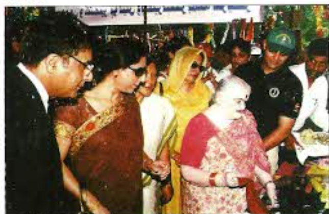
Chief Guest's visit to various stalls during Police Public Mela at Srinagar

A one day Police Public Mela was organized by J&K Police Wives Welfare Association (PWWA) at Sher-e-Kashmir Cricket Stadium Sonawar, Srinagar on June 8, 2008.