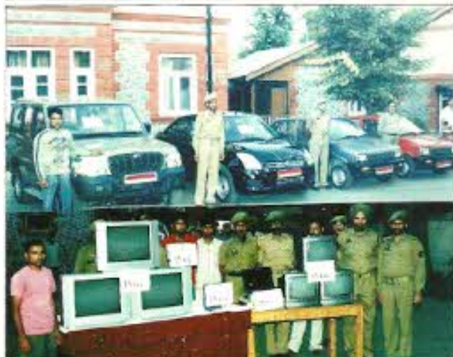
Winners standing with their respective raffle draw prizes of Police Public Mela held at Srinagar on June 8, 2008

The first prize Scorpio Car was won by Ticket No.B-32905, Second prize Maruti Desire was won by ticket No.A-09456, third prize(three Maruti 800) were won by ticket No.A-28825,B-66190 and B-89450, fourth prize(seven Motor cycles) were won by ticket numbers B-48713,A-13691, B-05327, A-62390, C-23721, A-74285, and B-31862, 5 th prize(five computer Laptops) have gone to ticket numbers B-14106,A-06504,C-84576,A-66096 and A-61492. The 6 th prize (Five computer desktops) were won by ticket numbers C-86735, A-52836, A-69673, A-42640, and B-66730. The 7 th Prize(Ten Sony Handicams) were won by