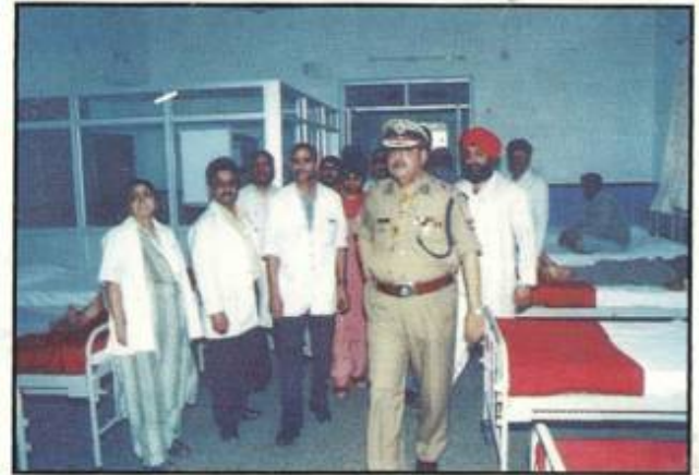
۱۸ ریاستی پولیس کے ڈائریکٹر جنرل جناب گوپال شرما پولیس ہسپتال جموں کے وارڈ کا معائنہ کرتے ہوئے۔