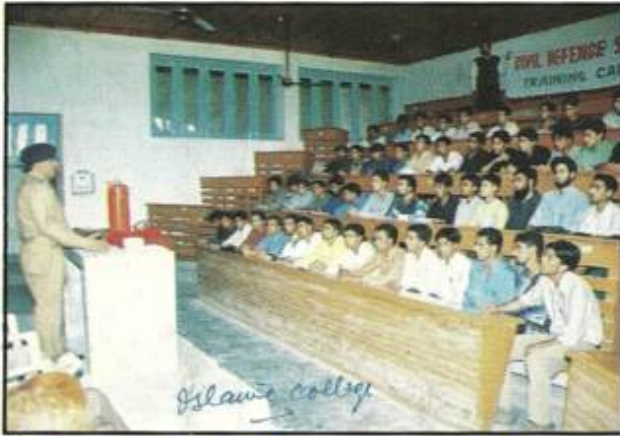
اسلامیہ کالج سرینگر میں منعقدہ ایک دس روزہ بولڈ ڈیفنس تربیتی کیمپ کی اختتامی تقریب پر ۲۶ ریاستی شرعی نظام سرور پوجا بان SP شرکا کا طلبہ کو بولڈ ڈیفنس کی افادیت کے بارے میں درس دیتے ہوئے۔