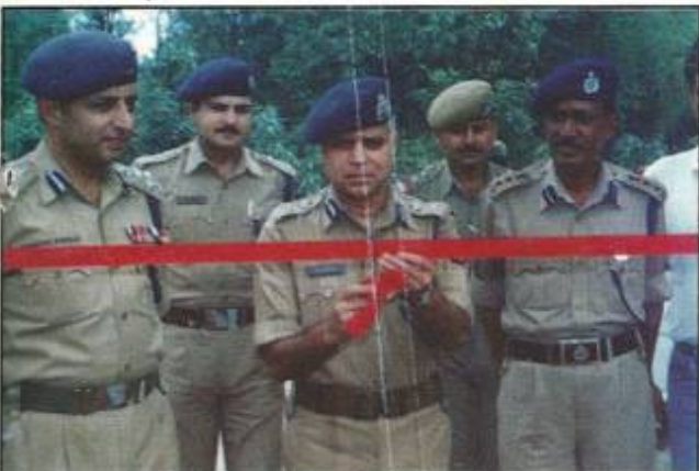
Inauguration of Border Police Post Purmandal—Ribbon Cutting by Shri P.L. Gupta, IGP, Jammu Zone