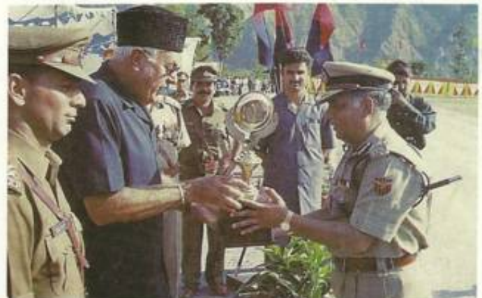
DGP J&K receiving a memento from C.M., J&K, at STC Talwara, Reasi, on May, 30.