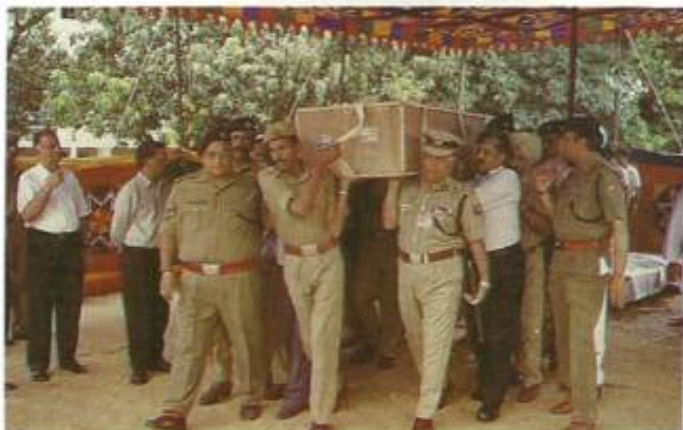
The last journey of a Police martyr (of May, 13) at Jammu.