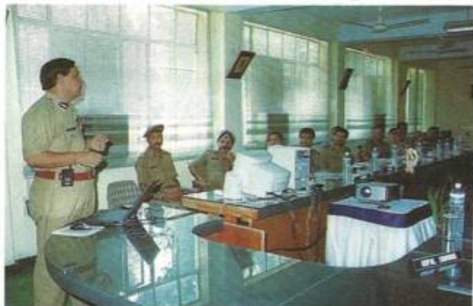
ADGP, Armed, speaking at the inaugural function