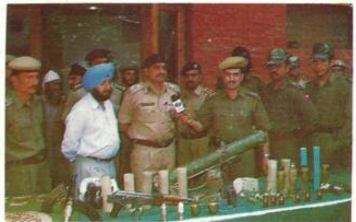
Weapons recovered by SOG Srinagar on May, 05.