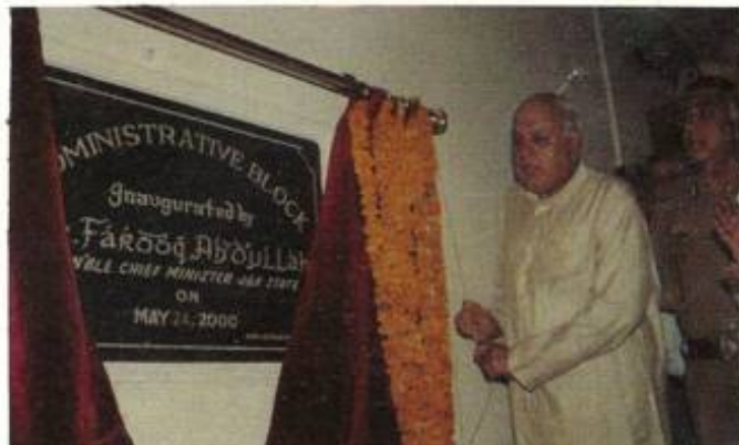
Dr. Farooq Abdullah, CM J&K, inaugurating the newly constructed Administrative Block.

furnishing items besides provisions for ACs, water coolers and approach road. The complex has been taken over to house the offices of ADGP/IGP Armed Police, Managing Director, J&K Police Housing Corporation, IGP, Home Guard/Civil Defence, DIG, Armed Police and Director Police Telecommunication.