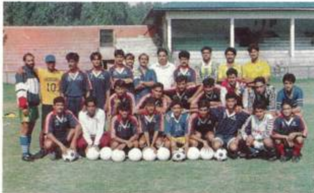
Above: Jubilant Football XI of J&K Police displaying the trophy. Below: Handball team of J&K Police, which clinched the Champions Trophy at Mini-Stadium Jammu.

J&K Police Football-XI clinched Senior Knockout Football trophy by defeating J&K Bank-XI by a solitary goal in the final match which was played at Bakshi Stadium, Srinagar, on June 29.