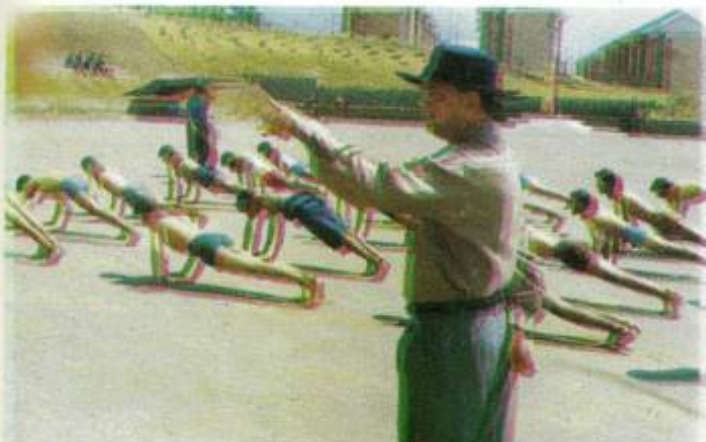
Recruitment of constables for IR-V and VI in progress at Zewan Armed police complex.