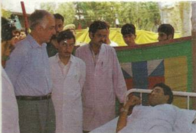
DGP inaugurating blood donation camp at Srinagar.