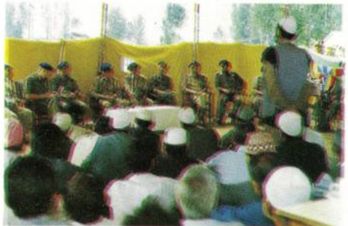
Darbar of retired J&K Armed police personnel being addressed by IGP Armed Police J&K at Srinagar.

To discuss various issues related to welfare and to interact with