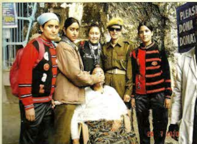
J&K Woman Police Rescue team at Service in Holy Cave.