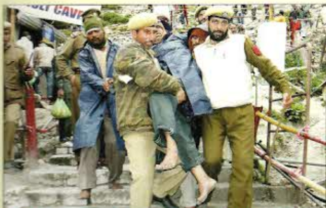
J&K Police police personnel carrying the ailing pilgrims from Holey cave to Base camp during Shri Amarnath Ji annual pilgrimage-2010.