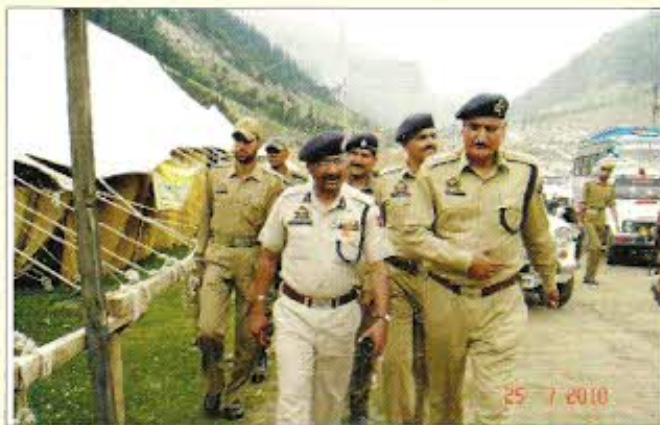
Shri Dilbag Singh IPS IGP Armed J&K reviewing the security arrangements at Baltal base Camp during Shri Amarnath Ji annual pilgrimage-on July 25, 2010