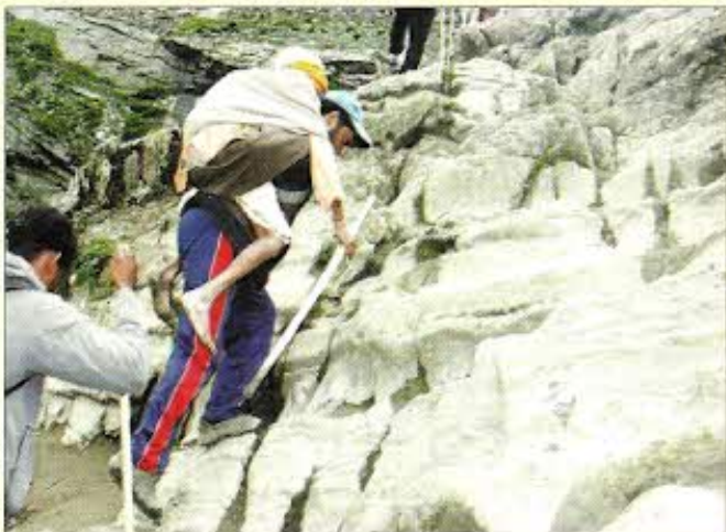
J&K Police Mountaineers carrying the old aged and infirm sadhoos on their back uphill to Shri Amarnath Ji cave during Shri Amarnath Ji annual pilgrimage-2010.