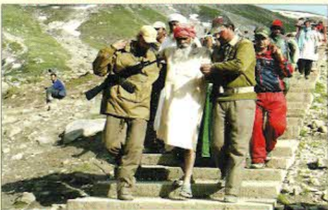
J&K Police extending a helping hand to aged and infirm sadhoos during Shri Amarnath Ji annual pilgrimage-2010.