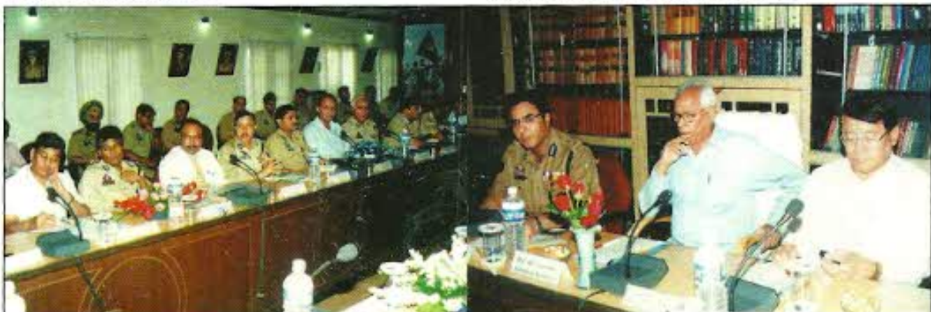
H.E the Governor J&K (C) accompanied by Chief Secretary J&K (R) and DGP J&K(L) addressing the senior police officers at PHQ J&K Srinagar