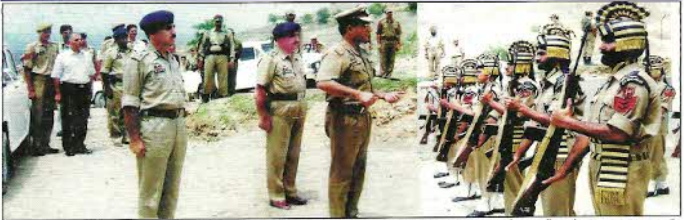
کھیری مل پش (ایسٹ ناگ) میں نو تعمیر کردہ ہائلین ہیڈ کوارٹرز کی رسم افتتاحی عمل لانے کے سلسلے میں 19 جولائی 2008ء کو ریاستی پولیس کے سربراہ جناب گلڈ پ گھڈاسلائی لیتے ہوئے۔