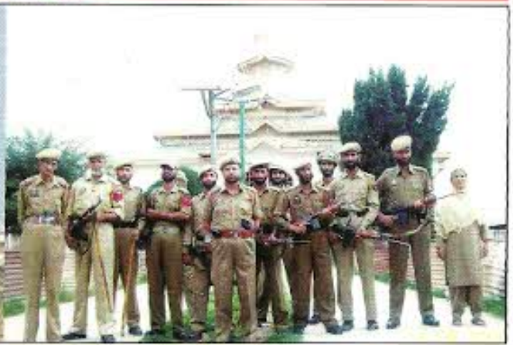
زیارت شریف حضرت نورالدین نورانیؒ چرام شریف پر جموں و کشمیر آرٹ پولیس کا حفاظتی دست اپنے فرائض منصبی انجام دیتے ہوئے۔

پراسحاب اور استقامت کے ساتھ اُلفت رکھتا ہو اور غصہ نہ کرتا ہو، لوگوں کے بُرے اقوال پر صبر و استقلال سے کام لیتا ہو، تکالیف برداشت کرنے کی قوت رکھتا ہو، دوسروں کو نصیحت کرنے کے بجائے خود عمل پیرا ہو، جولاچ، غروں، ریاکاری، تکبر اور طمع کا قلعہ قمع کرے، خدمت خلق اور فلاح کے کاموں میں عُمر صرف کرے وہی مسلمان کہلانے کا مستحق ہے۔ انہوں نے فرمایا خُدا (بھگوان) کی ذات اقدس ذرے ذرے میں موجود ہے۔ ہندو مسلمان سب حضرت آدم کے اولاد ہیں، ان میں کوئی فرق نہیں اگر تم دانا اور عاقل ہو تو اپنے وجود کو پہچان لو۔ اپنے آپ کو پہچاننا ہی خُدا شناسی کا راز ہے۔