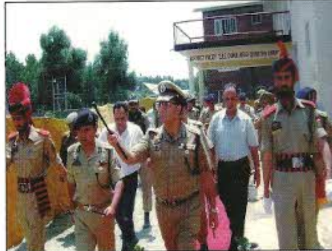
DGP J&K accompanied by senior police officers during inaugural function of District Police Telecom Hqrs. Anantnag on July, 19, 2008