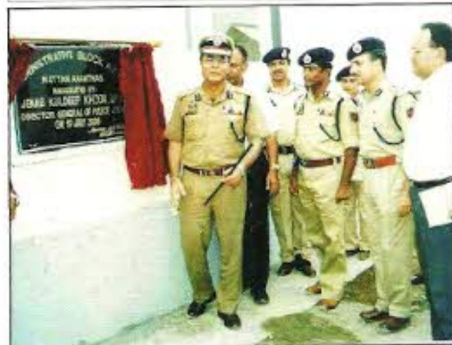
DGP J&K accompanied by senior police officers and SE PHC J&K inaugurating the Armed Police Complex at Kheribal Mattan on July, 19, 2008