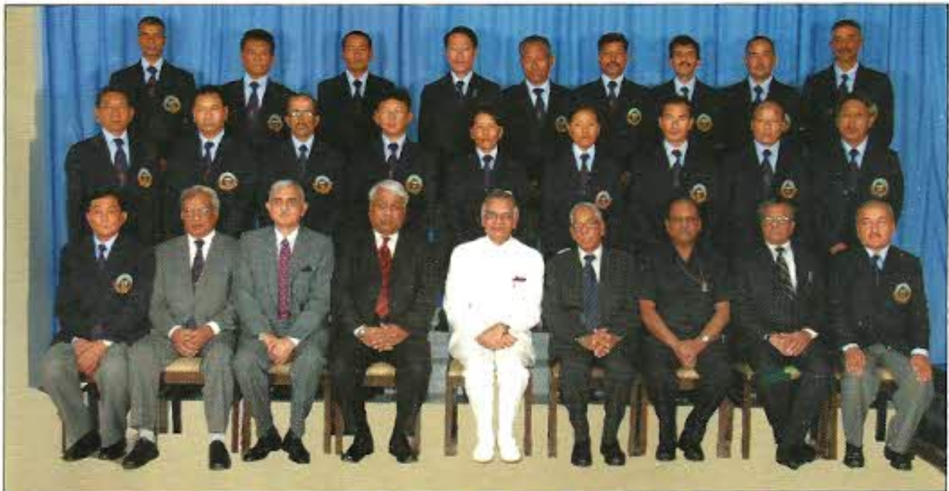
A group photograph of Mount Everest Expedition Team-2008 with Hon'ble Union Home Minister of India and other dignitaries taken on July, 21, 2008 at DRDO Bhawan New Delhi