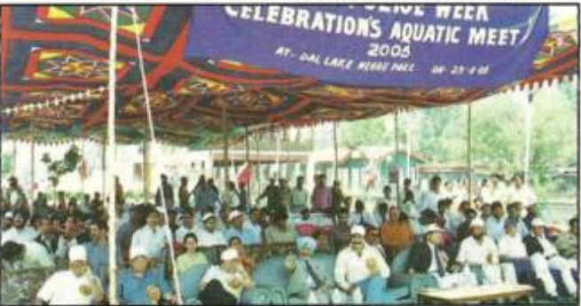
سرینگر میں منعقدہ 'پولیس ہفتہ' کے دوران ۲۳ جون کو 'آبی کھیلوں' کے مقابلہ کی اختتامی تقریب کا منظر۔