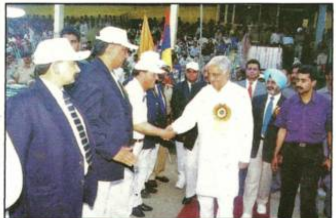
Hon'ble Chief Minister, Jenab Mufti Mohammad Sayeed, being introduced to the organising committee members at the concluding function.