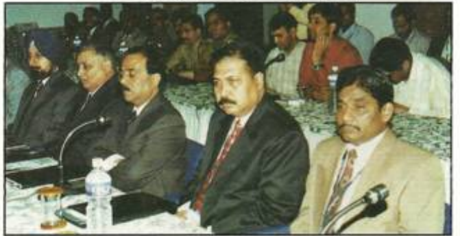
سرینگر میں منعقدہ شمالی ریاستوں کے سربراہان پولیس کی دوروزہ کانفرنس میں شرکا، پولیس کے افسران اعلیٰ۔