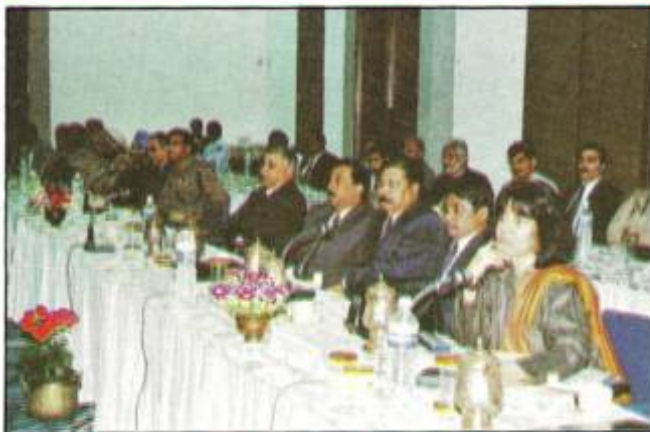
A cross section of participants at the inaugural session of 3 rd Conference of North Zone DsGP at SKICC, Srinagar on June 06.

In his inaugural speech, Jenab Mufti Mohammad Sayeed, Hon'ble Chief Minister, lauded the role of J&K Police in bringing a significant turn around in the situation and expressed confidence in that the State police would continue to play an important role in strengthening the peace in the State. While emphasizing on the need for reforms in policing methods, suiting to the societal needs, aspirations and expectations of the community, Hon'ble C.M. advised the participants to win over the hearts and minds of people through human and polite approach.