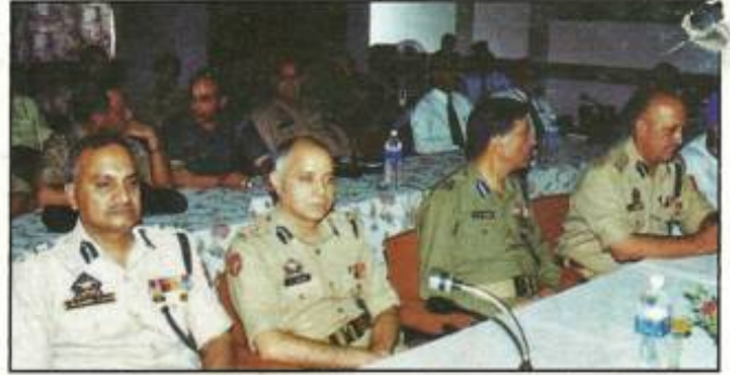
سرینگر میں منعقدہ ملنگ کی شمالی ریاستوں کے سپرنٹنڈنٹ صاحبان کے دوروزہ علاقائی ورکشاپ کی اختتامی تقریب پر ریاستی پولیس کے افسران اعلیٰ۔