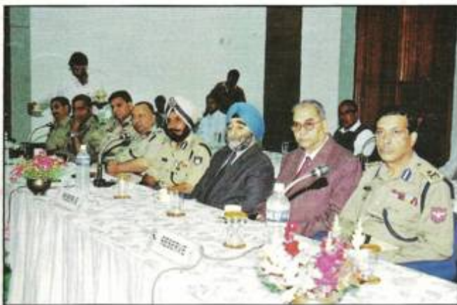
A cross section of participants at the pre-lunch session of 3 rd Conference of North Zone DsGP.

This was followed by a lively question-answer session.