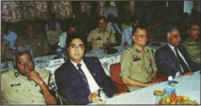
سرینگر میں منعقدہ ملنگ کی شمالی ریاستوں کے سپرنٹنڈنٹ صاحبان پولیس کے دوروزہ علاقائی ورکشاپ کی اختتامی تقریب پر ریاستی پولیس کے افسران اعلیٰ۔