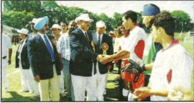
پولیس شہدا (مشتاق) یادگاری فٹ بال ٹورنامنٹ ۲۰۰۵ء کی اختتامی تقریب پر جناب گوپال شرما ڈائریکٹر جنرل پولیس شرکا رکھلاڑیوں سے متعارف ہوتے ہوئے۔