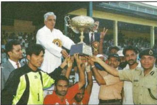
Jenab Mufti Mohammad Sayeed, Hon'ble C.M., J&K, presenting winners Trophy to BSF Jalandhar at the concluding function on June 22 at Bakshi Stadium, Srinagar.