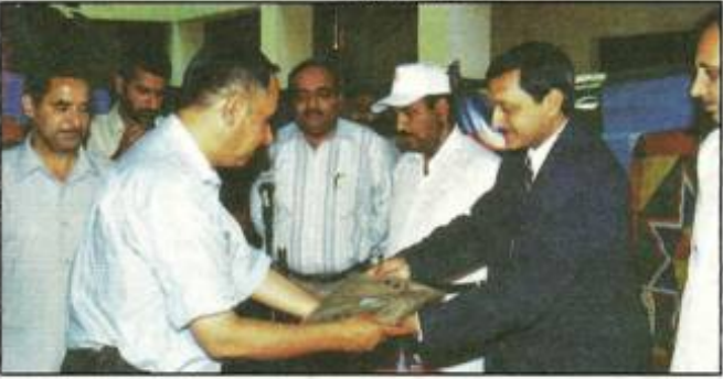
۲۳ جون کو سرینگر میں منعقدہ ایک خصوصی تقریب پر جناب نوین اگر وال انسپکٹر جنرل پولیس 'ہوم گارڈس' بول ڈیٹنس اور Auxiliary پولیس بول ڈیٹنس کے وارڈنوں کو 'دوروی' تقسیم کرتے ہوئے۔