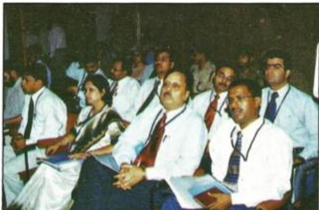
A cross section of the delegates of the 2-day Regional Workshop of North Zone Superintendents of Police.

Speaking on the occasion, the DGP, J&K said that the efficacy and efficiency of police was ultimately judged by the people and this depended on the quality of the delivery of services by the Police. The workshop would enable the officers to interact and share each other's experiences, which would go a long way in bringing the professional excellence, the DGP added.