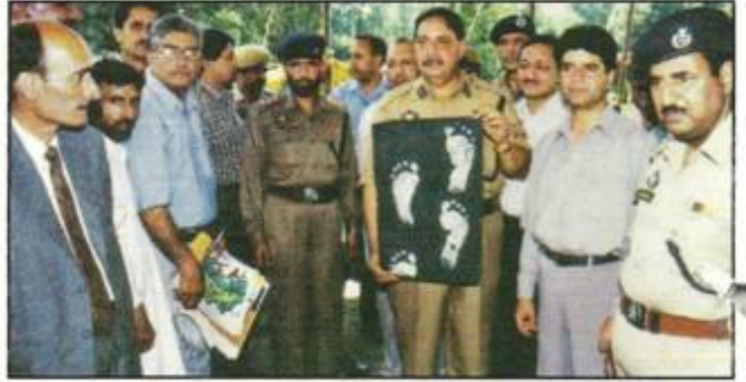
سرینگر میں منعقدہ 'پولیس ہفتہ' کے دوران ۱۲ جون کو مصوری مقابلہ کی اختتامی تقریب پر ریاستی پولیس کے سربراہ جناب گوپال شرما مصوری کے ایک نمونہ کی نمائش کرتے ہوئے۔