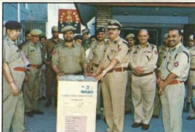
ABOVE: 7th Prize (A Washing Machine) being presented to its winner by the DGP.