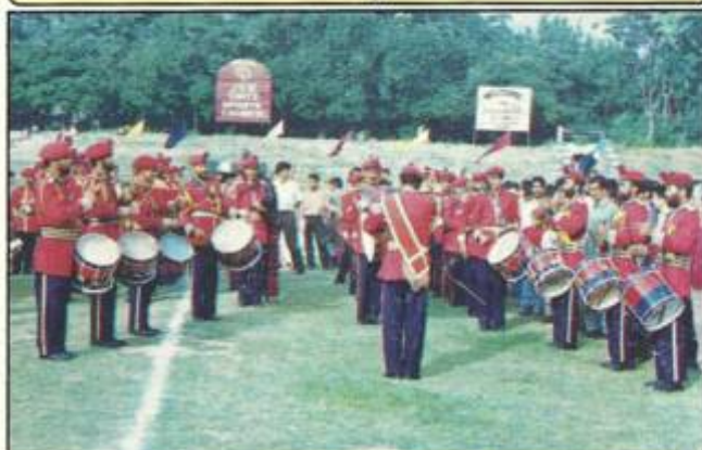
Band display at the concluding function.