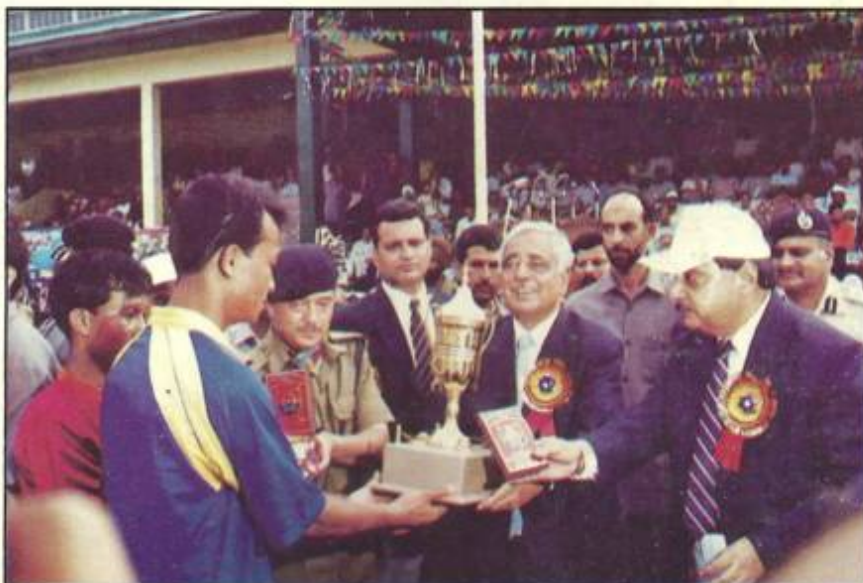
Hon'ble Chief Minister, Mufti Mohammad Sayeed, giving away the Trophy to the Captain of SSB Team at Bakshi Stadium, Srinagar.

Flag-hoisting, souvenir-releasing, tributes paying to Martyrs, releasing of Pigeons as peace messengers, spreading of multicolour balloons and an exhibition match marked the inaugural function.