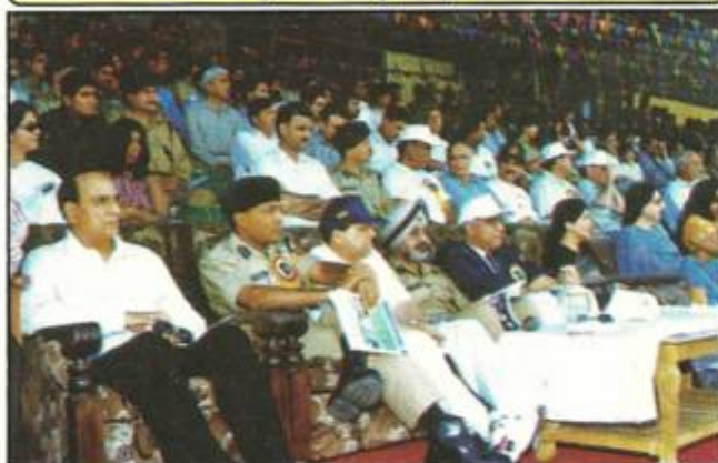
A cross section of Guests at the concluding function.