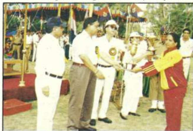
DGP J&K, ADGP Armed J&K, DIG Armed Police Jammu and Comdt. JKAP 1 st Bn. at the presentation ceremony