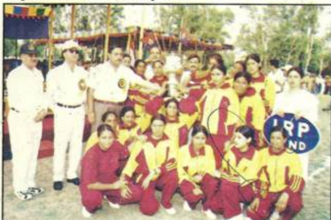
A group photograph of Jubilant Sports women of IRP 2 nd Bn. taken at the concluding function of the meet.