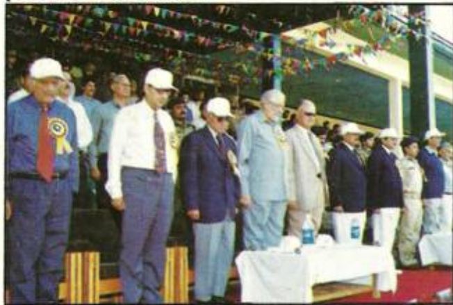
A homage to Police Martyrs by observing 2-minute silence.