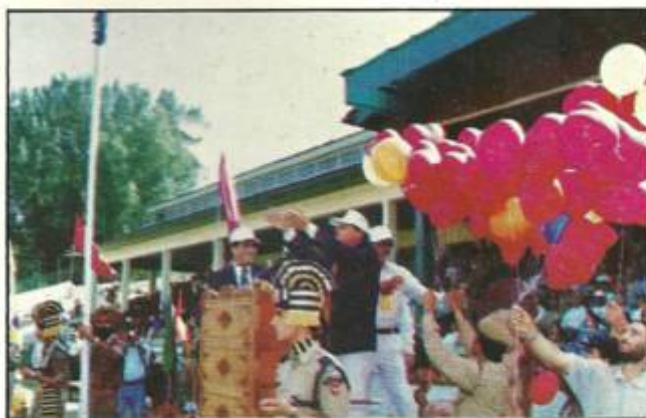
A view of the inaugural function.