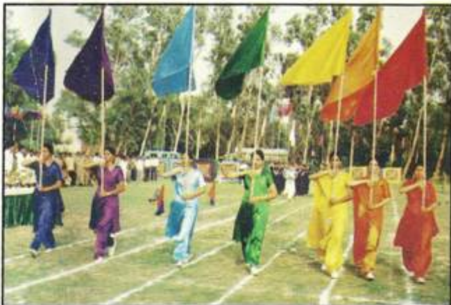
A scene of the concluding function of the Sports Meet