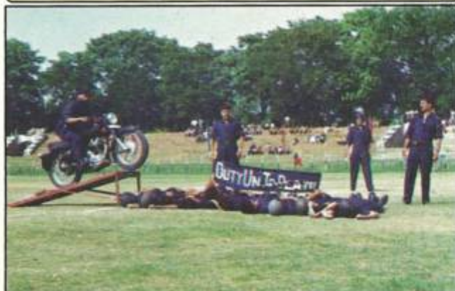
Dare-devil show by Police Riders.