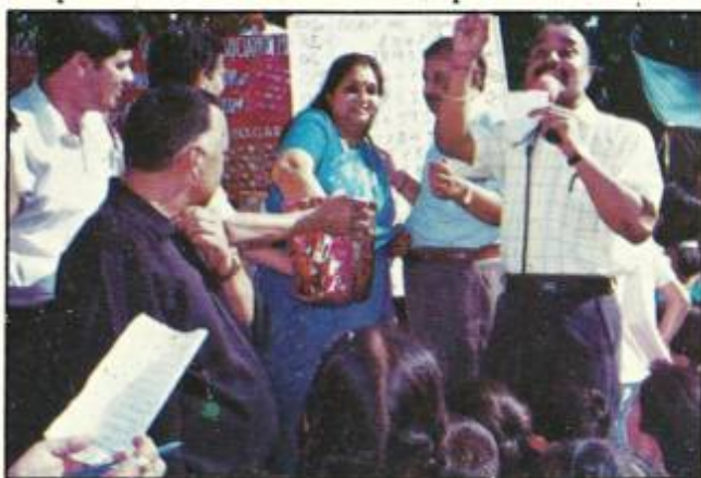
"Draw of lots" for prize distribution at the site of the Mela

For the pre-sold tickets, a draw of lots was held at the venue of the Mela and the prize winning ticket numbers were announced on the spot. The prizes included a Maruti Car, Yamaha Motor Cycle, Computer, Golden Ornament Set, Colour TV, Refrigerator, Washing Machine, Mobile Phone, CD Player/ Stereo, VCD Player, Carpet and over 1000 consolation prizes.