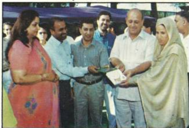
BELOW: Winner of the 4th Prize (Golden set) receiving the prize at the venue of the Mela