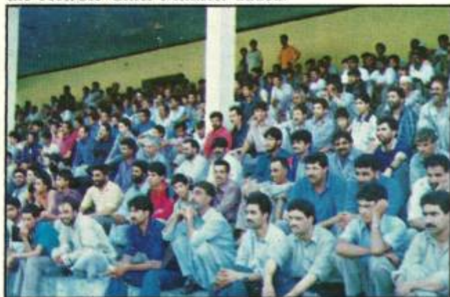
Sports enthusiasts watching the Final of the Foot Ball Match at Bakshi stadium, Srinagar.

Speaking on the occasion, the Chief Guest, Hon'ble Chief Minister, Mufti Mohammad Sayeed congratulated the Director General of Police J&K and lauded the role of J&K Police in organizing Sports Meets for reviving the sports culture in the state. The Chief Minister spelled out various measures that have been initiated to upgrade sports facilities with a view to raise the standards of physical education in the State. For achieving optimum results and to enhance the performance of youth, efforts shall be made to organize National Level Tournaments like "Santosh Trophy" and "Ranji Trophy" in the valley, the Hon'ble Chief Minister added.