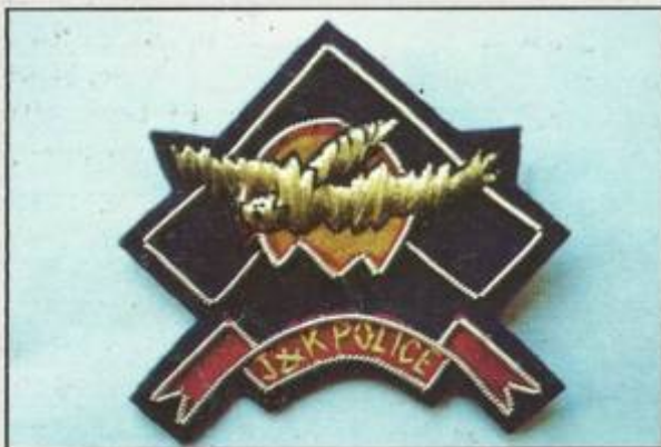
The scanned image of the "INSIGNIA"

T o commemorate the first anniversary of conferring the J&K Police with "colours" by H.E The President of India, it has been made imperative that all ranks of J&K Police wear the "INSIGNIA" culled from the "colours" on their uniforms from June 26, 2004 as a mark of respect to the "colours". The same shall be worn atop the nameplate on the right side of the uniform. A communique to this effect was issued by the Director General of Police J&K on June 26.