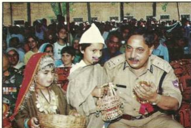
DGP J&K at the concluding function of the Festival—interacting with the tiny tots—participants of the cultural show.

The festival was held with the objective of cultivating Police-Public friendly relations through close contact with the local populace. This provided an opportunity to the youth of the region to exhibit their talent in the field of sports, culture and other activities.