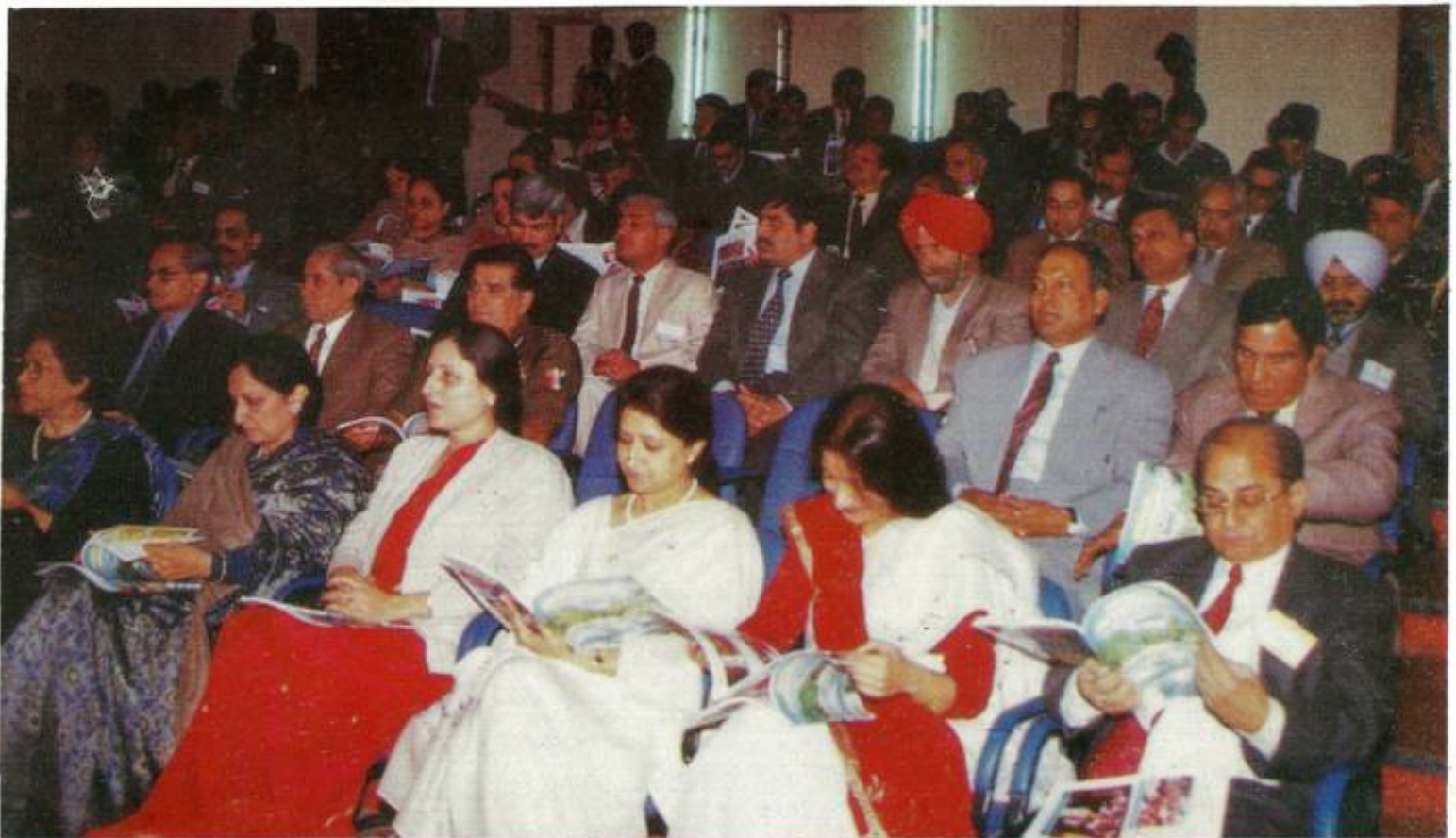
Participants of the inaugural function of XXXI All India Police Science Congress, Jammu, held in the Auditorium of Jammu University on December 01, 1999.