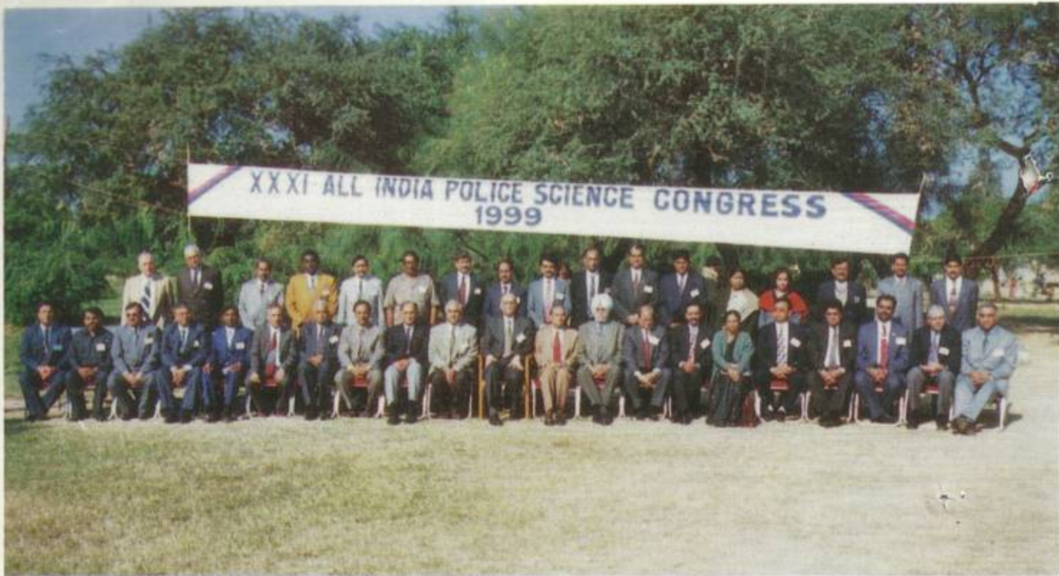
Delegates and Participants posing with H.E. the Governor of J& K after the inaugural function on December 01, 1999

police force abreast with computer technology and through better co-ordination within the country as well as effective international co-operation. H. E. the Governor, stressed on the need to improve the image and standing of Police through their behaviour and fair and honest discharge of duty to earn the good will, respect and co-operation from the people. He also expressed the need to improve the procedure and mechanism of recruitment and training, enhancing the mobility, upgrading the intelligence network and modernisation besides strengthening the manpower.