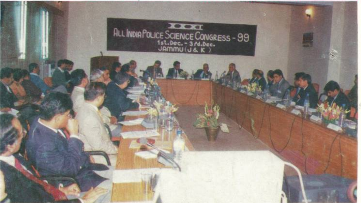
Delegates and participants of XXXI All India Police Science Congress, Jammu, transacting business in the Conference Hall of Jammu University