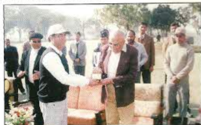
DGP J&K presenting memento to H.E. the Governor J&K State on January 27