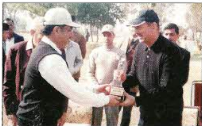
DGP J&K presenting memento to Hon'ble C.M. J&K on January 27