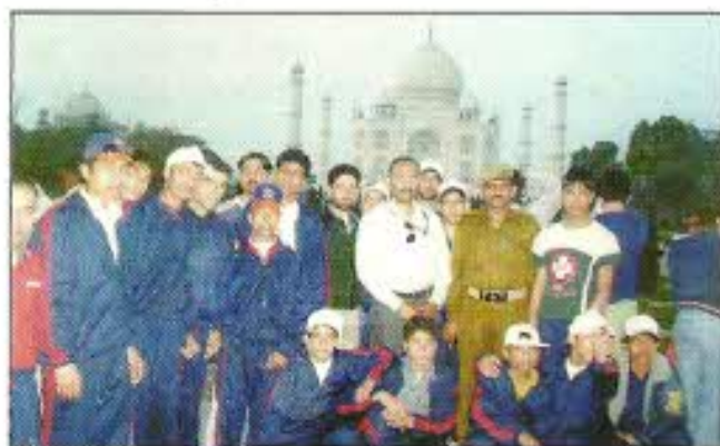
Students on "Wattan Ki Sair" posing for a photograph in front of Taj Mahal Agra

During interaction with the students, H.E. the Governor, J&K said that the tour provided an opportunity for the students to interact with the fellow students from different parts of the country and to see some historical places.