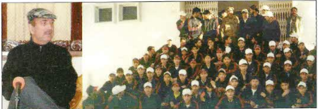
Shri Ghulam Nabi Azad Hon'ble Cheif Minister J&K interacting with the students at his official residence on January 21

During their tour to Delhi, the students visited Vijay Ghat, Shakti Shatal, Shantivan, Raj Ghat, Red fort.C.M.Sectt Delhi, Delhi Airport.Gurgoan, Delhi zoo, Jamia Masjid, Gurudawara Sahib Sheeshgunj, Chandni chowk, Qutub Minar, Birla Temple, Cannaught Palace, Palika Bazar and also enjoyed Metro Ride at Delhi. Mrs.Sheela Dixit, Hon'ble C.M.Delhi hosted a tea party to these students and interacted with them. At Jaipur students visited the historical places like City Palace, Janter Manter, Hawa Mahal, Museum, Pink City whereas at Ajmeer they visited Dargah Ajmeer Sharief, Fatehpur Sikry, Dargah Saleem Chisti and at Agra they visited Taj Mahal.