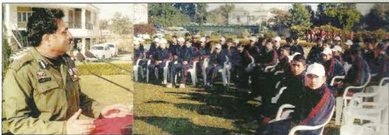
DGP J&K interacting with the students in the lawns of PHQ J&K Jammu on January 21