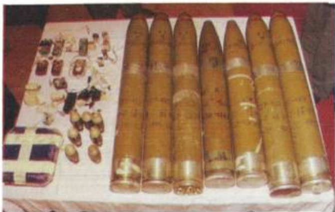
Chinese made rockets recovered by Jammu Police