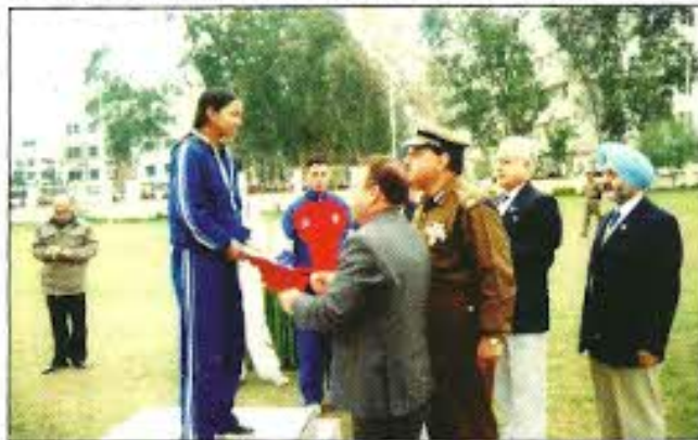
Sh. Babu Singh, Hon'ble Minister of State for Youth Services and Sports presenting the medals, reward money and certificates at the presentation ceremony

In his address, Hon'ble Minister of State spelled out various measures undertaken by the Government for promoting sports culture at tehsil, block and village level with a view to ensuring participation of youth in sporting activities in a big way. The Chief Guest complemented the DGP and his team of officers for organizing the mega event for the first time in Jammu. Hon'ble Minister underscored the need for harnessing the talent of sportsmen so that they could compete in national and international level in a better way.