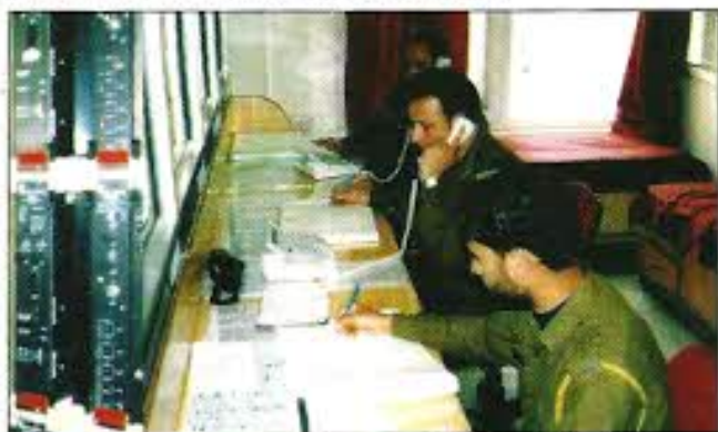
Operators on the job at 1024-line EPABX Zonal Signal Centre Tele-com, Srinagar.

A digital 1024- line EPABX Police Exchange, with Dial-100 system facility, was commissioned at Zonal Signal Centre, Srinagar, which provides round the clock landline/ mobile communication to Police and civil administration in the summer capital (Srinagar).