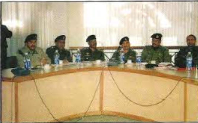
۲۲ فروری ۲۰۱۱ء کو ہست میں منعقد ملائند ریجنی پولیس کے کمانڈنٹ صاحبان کی کانفرنس کے دوران چھٹی گئی تصویر۔