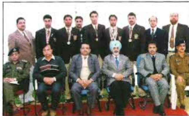
Group photograph of felicitated sports men of J&K Police with Senior officers. Sh. P.S. Gill, ADGP Armed J&K, (sitting - 3 rd from the right) is also in the picture