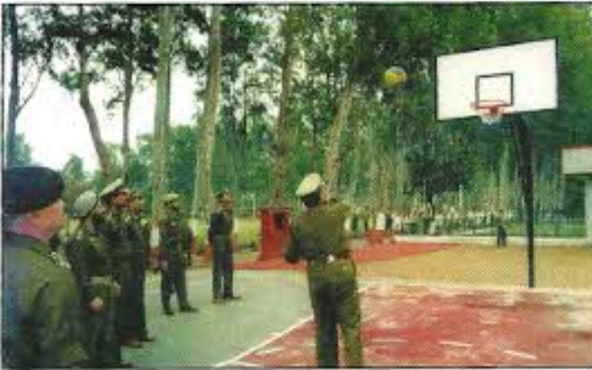
۳۰ فروری ۲۰۱۱ء کو پولیس کے ڈائریکٹر جنرل جناب گوپال شرما ریجنی ہفتا روزہ پولیس مارٹنگ سکول کھنولہ کے دورہ کے دوران ایک نئے خفیہ شدہ ہاسٹل ہال کورٹ کی افتتاحی رسم پر عمل آ رہے ہوئے۔