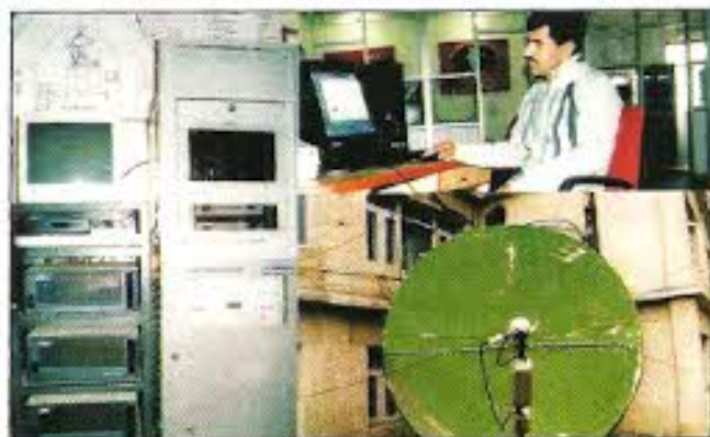
Shri Hilal Ahmad, SP, Telecom. Srinagar observing the status of Polnet Satellite Communication System at Srinagar

J&K Police achieved a milestone while introducing satellite based Polnet communication at all District Headquarters with its Hybrid station, installed at Zonal Signal Center, Srinagar at zonal level and Hub Station at national capital, New Delhi. The system provides fastest transfer of data, file and picture at a speed of 9600 bps with all the paramilitary Headquarters and all District Headquarters of the country.