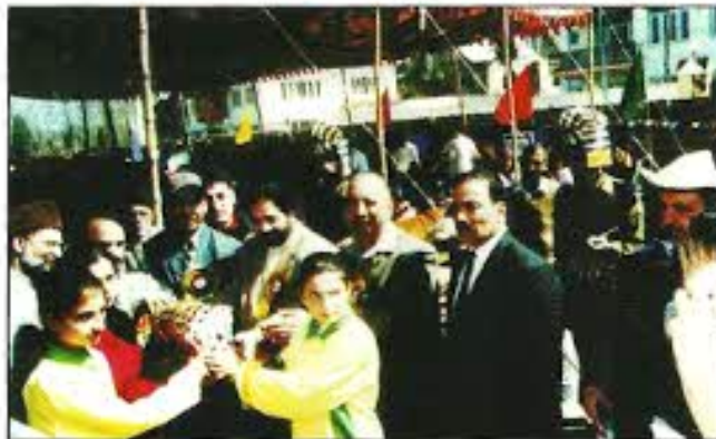
Shri Hakeem Mohd Yaseen Shah, Hon'ble Minister for Transport, J&K, while distributing the games material and mementos during the function

With a view to bridging the gap and cultivating good Police-Public Relationship, J&K Police has been undertaking a number of socially useful activities under Civic Action Programme for the benefit of general masses. Under the Civic action Programme (CAP), J&K