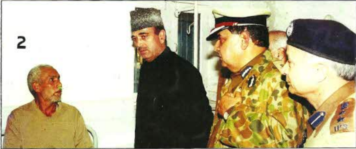
۲۳ فروری ۲۰۱۱ء کو ہاست کے وزیر اعلیٰ جناب غلام نبی آزاد پولیس اسپتال سرینگر کے معائنہ کے دوران اسپتال میں داخل ایک مریض سے حال وحوال پوچھتے ہوئے۔ تصویر میں موصوف کے سرکامیہ ریجنی پولیس کے ڈائریکٹر جنرل جناب گوپال شرما اور پولیس کنٹرول روم کے ڈیپٹی سپرنٹنڈنٹ پولیس جناب شوکت احمد ملک۔