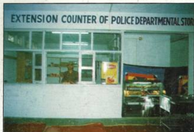
The Counter to provide canteen services to Police personnel inaugurated by DGP, J&K on January, 14

DGP, J&K inaugurated the extension counter of Police Departmental Store at Police Headquarters, Jammu on January, 14. The extension counter shall provide the canteen services to the police personnel in the premises of Police Headquarters on cheaper rates.