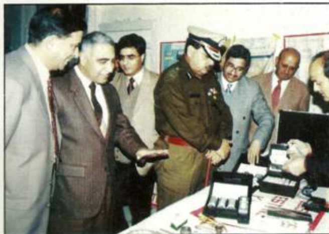
DGP, J&K, flanked by senior Police officers at the venue of the Exhibition-cum-workshop