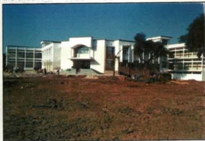
The newly constructed complex of Police Public School at Miran Sahib (Jammu), inaugurated on Jan. 03

Speaking on the occasion, the Hon'ble Chief Minister paid glowing tributes to the Police and Security Forces personnel who laid down their lives on January, 02 at Railway Station, Jammu to prevent civilian casualties. By their sacrifice and gallant action, they have made us all proud, he added. He complemented the role of Police and Security Forces in bringing turn around in the situation.