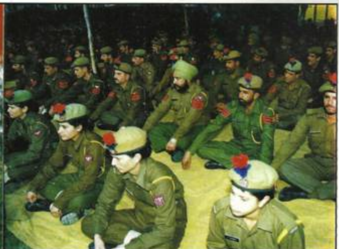
A view of the Darbar held at Armed Police Complex Channi Himat, Jammu by DGP, J&K on January, 08