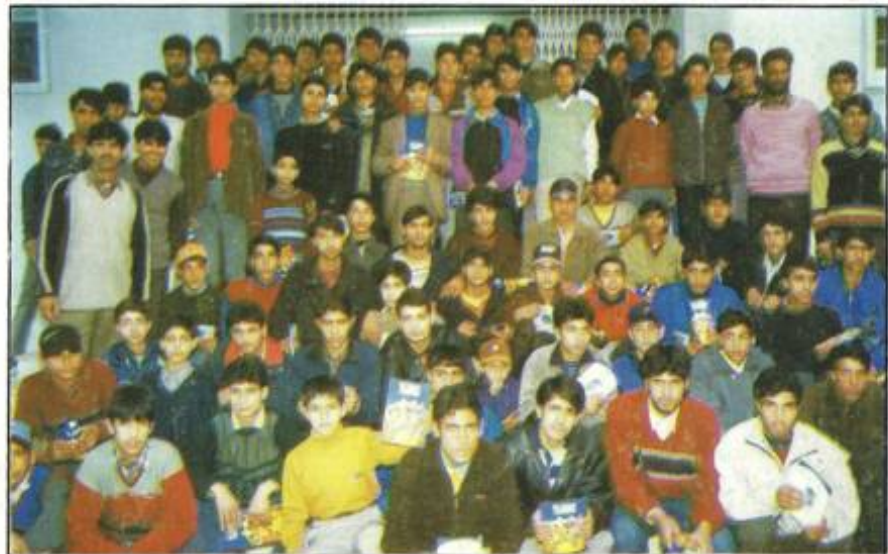
A Group Photograph of the touring boys taken at Jammu on January, 06

On January, 06, the touring boys participated in "Essay Writing" and "Drawing Competition" held in the