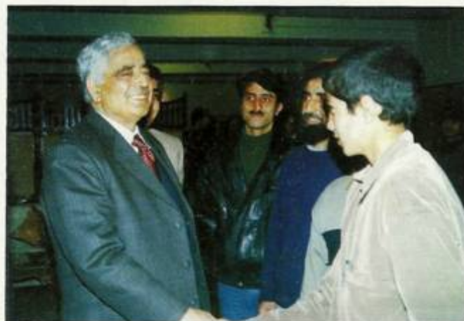
Above: Hon'ble C.M, J&K, interacting with the boys Below: Hon'ble C.M, J&K, receiving the bouquets

The spontaneous feed-back of impressions from the boys was quite revealing—the expressions were full of emotions and satisfaction; one and all had special words of gratitude for J&K Police in fulfilling their desire to visit these places; they were no longer wary of accepting the J&K Police as their friends and would love to befriend every J&K Policeman! The touring boys were highly impressed to see the vast country they belong to and the oneness of its people despite religious, cultural, linguistic, ethnic and climatic diversity. The tour had widened their mental horizons, claimed each one of them in their feed-back notes.