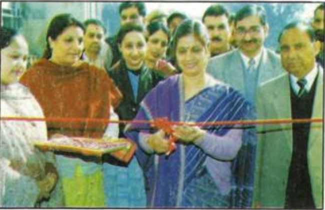
۹ جنوری ۲۰۰۳ء کو گاندھی میموریل کالج میں منعقدہ ادارک سائنس سے متعلق ”واپسی ہفتہ“ کی رسم افتتاح کا سحر۔ اس واقعہ کے انعقاد کا رزیک سائنس لبریری میں نے کیا تھا۔