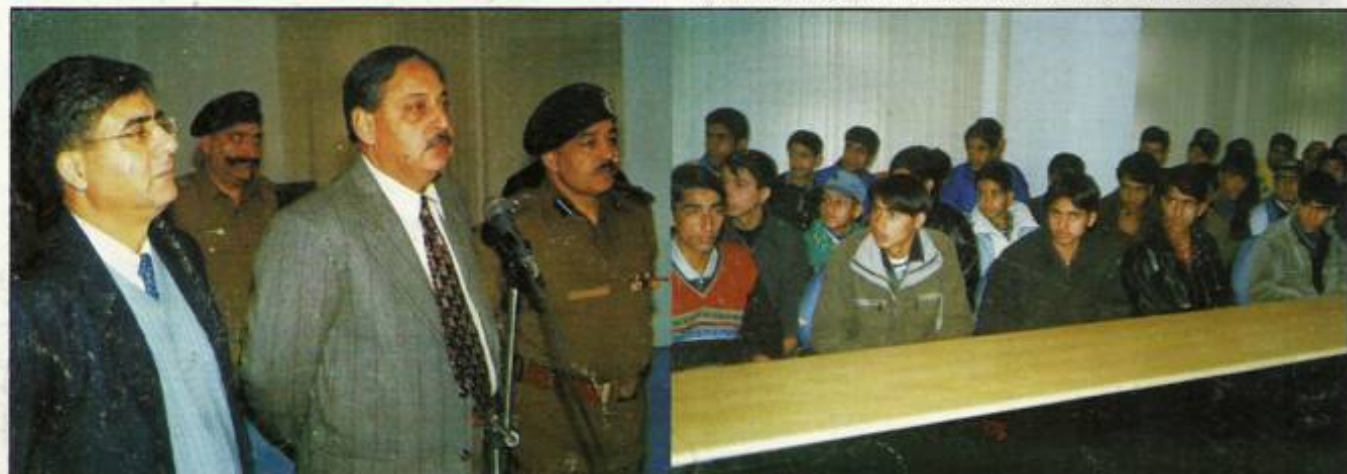
DGP, J&K, flanked by ADGP, Armed (Left) and DIG, Armed, Jammu (Right) briefing the boys about the tour in the Conference Hall of PHQ at Jammu, on December, 23

The group called on the Hon'ble Chief Minister, Jenab Mufti Mohammad Sayeed on January, 06. While interacting with the boys, the Hon'ble Chief Minister desired that exchange of students from different states should be promoted in a big way to provide the youth an opportunity to see the glorious traditions of the composite culture and plurality of the nation which shall help broadening their mental horizons. It gives a new vision to the youth, he added.