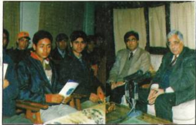
وادی کشمیر کے سکولی بچوں کی وزیر اعلیٰ کے ساتھ ملاقات کے دوران میٹھی گلی ایک تصویر۔

پولیس اور عوام کے مابین باہمی رشتوں کو سنوارنے اور آپسی تعلقات خوشگوار بنانے کی سمیت میں جموں کشمیر پولیس کے بڑھتے قدم ☆ ”بلدیاتی عملی پروگرام“ (Civic Action Programme) کے تحت ریاستی پولیس نے وادی کشمیر کے دور افتادہ دیہات سے منتخب ایک سو سکولی بچوں کے ہتھ کو ملک کی شمالی ریاستوں کے چند روزہ (۲۳ دسمبر ۲۰۰۳ء لغات ۶ جنوری ۲۰۰۴ء) دورہ کا اہتمام کیا۔ اس دورہ کے دوران سکولی بچوں نے پنجاب، دہلی، اتر پردیش اور مدھیہ پردیش کے متعدد توار سنجی مقامات، آثار قدیمہ، متبرک درگاہوں اور تہذیبی و ثقافتی مراکز کی سیاحت کی۔ ☆ ۲۳ دسمبر کو ریاستی پولیس کے قاید و سربراہ جناب گوپال شرما نے سکولی بچوں کے ہتھ کو جموں سے رکی طور پر جھنڈی دکھا کر روانہ کیا۔