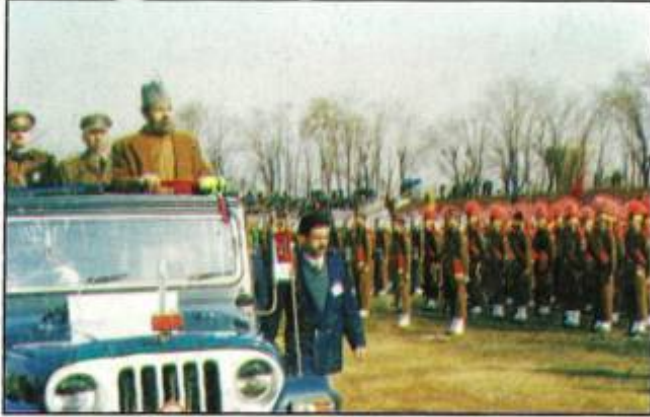
ایم جی کے موقع پر ریاست کے وزیر اعلیٰ عزت مآب جناب مفتی محمد سعید نے بچوں کو نصیحتیں پیش کیں اور موقع پر جشن جیہ ماحول برپا کیا۔

☆ ۶ جنوری کو سکولی بچوں نے ریاست کے وزیر اعلیٰ عزت مآب جناب مفتی محمد سعید سے ملاقات کی اور موصوف کو گلہ سے پیش کئے۔ اس ملاقات کے دوران وزیر اعلیٰ سکولی بچوں کے ساتھ غیر رسمی گفت و شنید میں بچوں کو نصیحتیں پیش کی گئیں اور موقع پر جشن جیہ ماحول برپا تھا۔ وزیر اعلیٰ نے بچوں سے دورہ کے علاوہ مختلف امور پر تبادلہ خیال کیا اور اس موقع پر خطاب کرتے ہوئے ریاست میں تعلیم کے معیار کو بڑھانے کی خاطر ریاستی سرکاری کوششوں اور اقدامات کا تفصیلی جائزہ پیش کیا۔