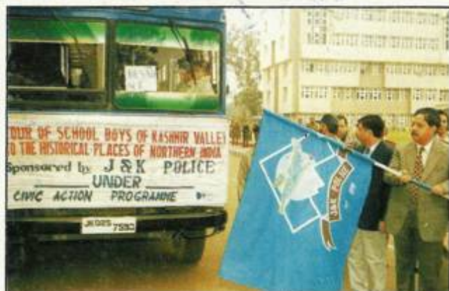
DGP, J&K, Flagging-off the buses carrying the boys for the tour on December, 23, from Jammu.