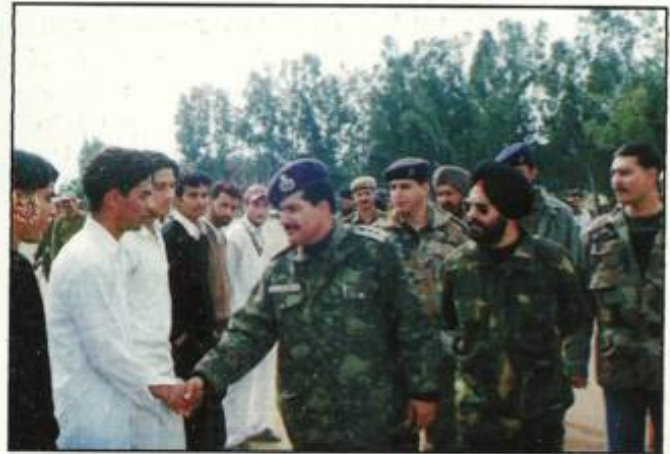
Cricket Players of the participating teams being introduced to SSP, Reasi and Commandant IR 7 Bn. on the concluding day of Bilal Memorial Tournament on Jan. 29