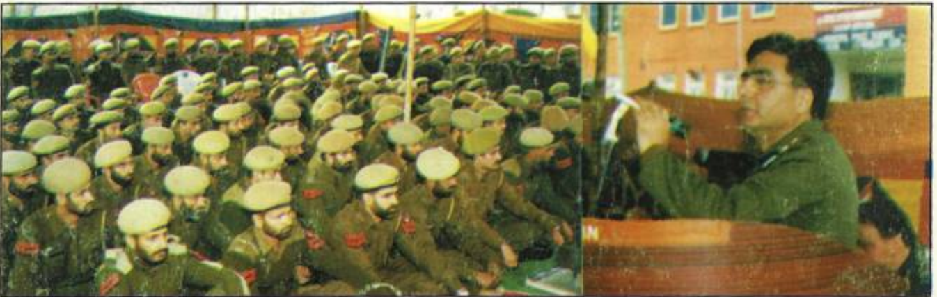
۲۰ جنوری ۲۰۰۳ء کو ریاستی سطح پر پولیس کے سربراہ جناب گڈ پھ کھڑا میاں (سربراہ) میں منعقدہ پولیس کے جوانوں سے خطاب کرتے ہوئے۔