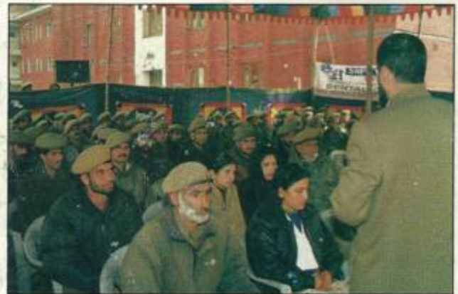
ضلع پولیس لائن سرچر میں ۳۶ نمبر کو منعقدہ "آگنی سہتہ دندان پروگرام" کے موقع پر ملازمین پولیس کو (دائیں) کی سہتہ اور دیگر مہتمومین کی قرانی کا منظر۔