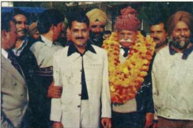
شرقی گوبند سنگھ ASI کو آگنی سیکورٹی کے حلقہ پر پولیس کنٹرول دم ہون میں مہمانوں کوئی گلی ایکسپریس ادا کی پارٹی کا منظر۔