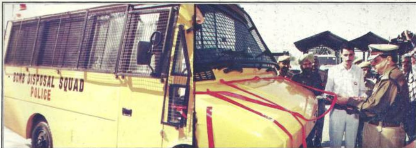
DGP J&K inaugurating the Vehicle equipped with the gadgets and tools for Bomb Disposal on October, 31.