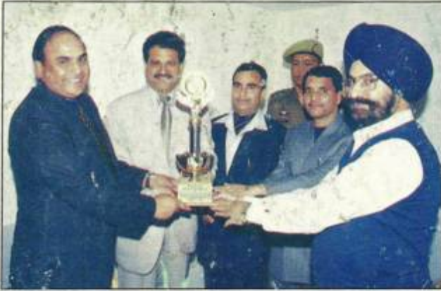
راجا اچنار علی خان ڈائریکٹر شعبہ مواصلات ریاستی پولیس جن کا تقریر بطور مہمان خصوصی ایڈیشنل جنرل پولیس بارہمولہ راج ہوا تھا کو انھیں کوئی گلی ایکسپریس ادا کی پارٹی کا منظر۔ تصویر میں دیگر افسران کے ساتھ (بائیں سے سربر) جناب اشوک کمار چٹا DIG جن کا تقریر کا شہیتہ ڈائریکٹر شعبہ مواصلات ریاستی پولیس نہا ہے بھی ہیں۔