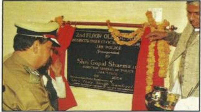
DGP, J&K at the inaugural function of second floor of "Old Age Home" building at Udhampur on Nov. 30, constructed by J&K Police under C AP.