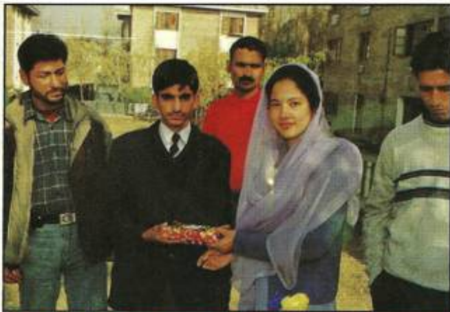
A picture of the prize distribution to participants of seminar, at Police Public School Srinagar, held on Children's Day function.