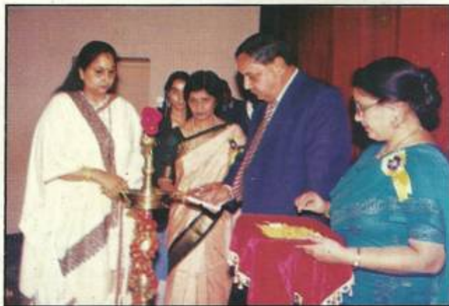
DGP J&K lighting the "traditional lamp" at the Annual Day function.