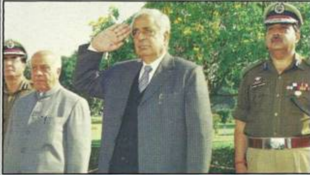
On the opening of Darbar at winter capital Jammu, Hon'ble C.M J&K flanked by Hon'ble Dy. C.M., DGP, J&K and ADGP, Armed, taking salute in the Secretariat complex.