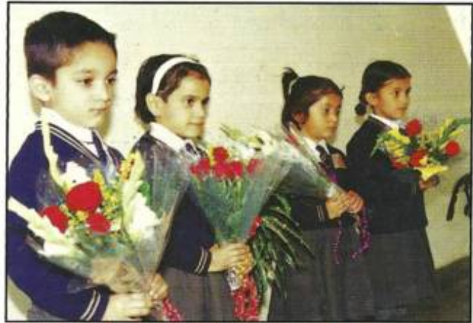
Tiny tots of Police Public School, Jammu with bouquets in their hands to greet the Guests at Children's Day function.