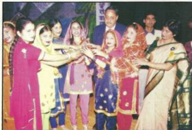
A view of "Cultural Show" by the wards of the School.