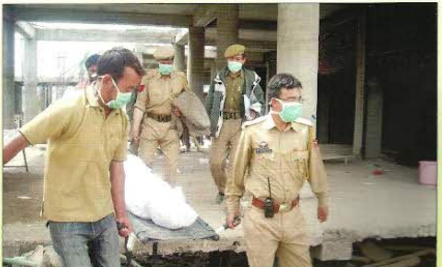
J&K Police personnel carrying out the rescue operation at Leh