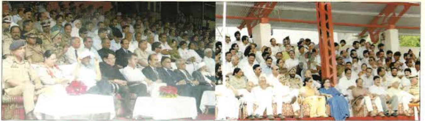
Audience witnessing the Independence Day functions at Bakshi Stadium Srinagar (Left) and Mini stadium Parade Jammu(Right)