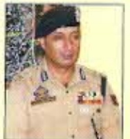
Farooq Ahmad IPS IGP