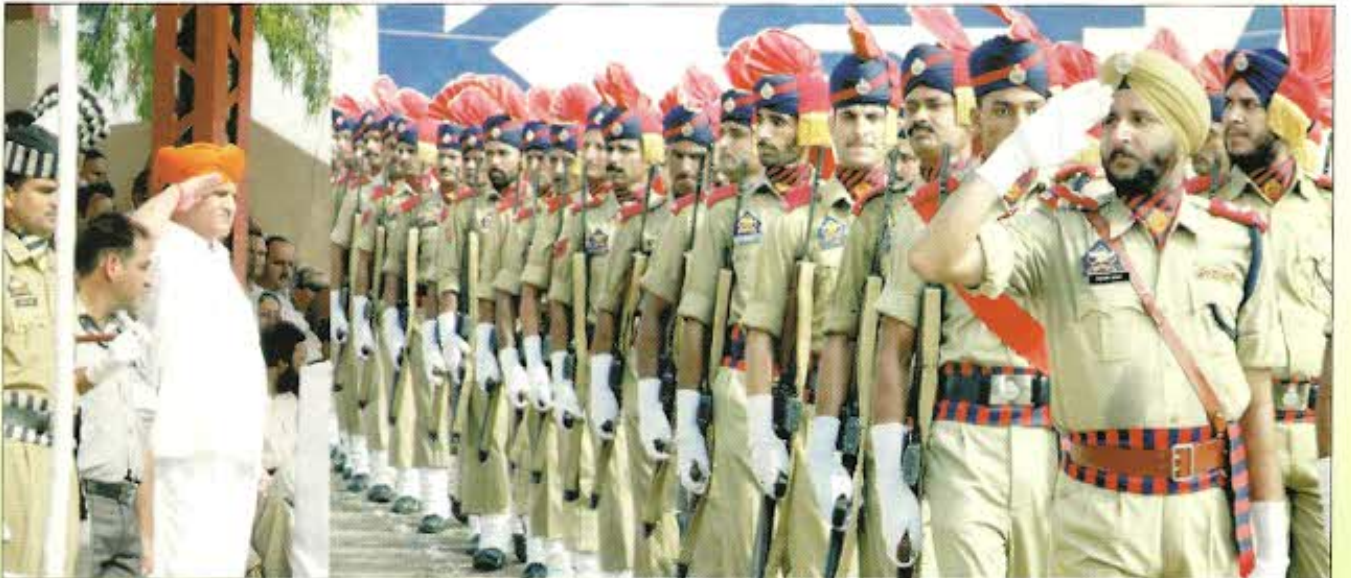
Shri Tara Chand Hon'ble Deputy Chief Minister J&K taking salute at the march past during Independence Day Parade at Mini Stadium Parade Ground Jammu on August 15, 2010