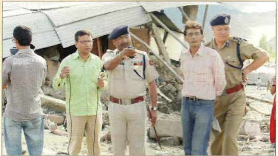
Shri Dilbag Singh IPS IGP Armed J&K and Shri T.Punchok IPS DIG AP Jammu supervising the rescue operation launched by J&K Police during colossal tragedy which struck Leh during the intervening night of August 5&6, 2010

There had been extensive damage to public utilities such as BSNL Exchange, Civil Hospital, Airport, Drinking Water supply works, National Highways connecting Leh-Manali, Leh Kargil and also the private properties.