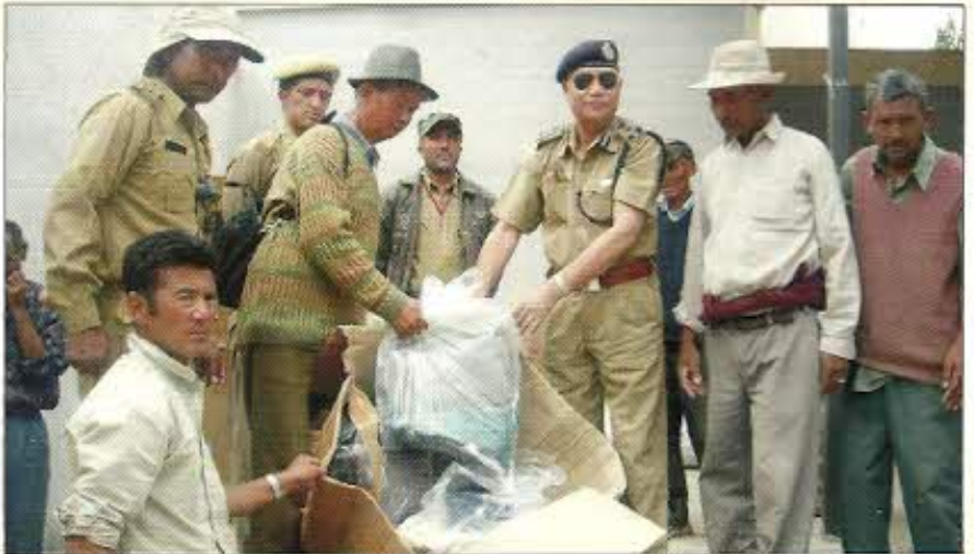
Shri T.Punchok IPS DIG Armed Jammu personally supervising the distribution of relief items among the cloud burst victims at Leh