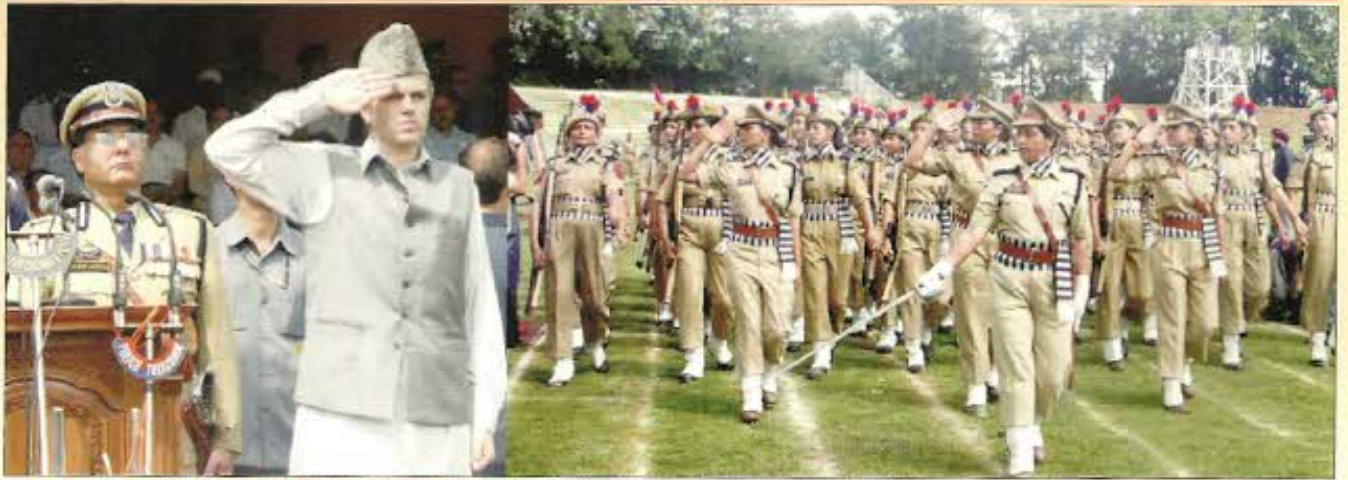
Shri Omar Abdullah Hon'ble Chief Minister J&K flanked by DGP J&K taking salute at the march past during Independence Day Parade at Bakshi Stadium, Srinagar on August 15, 2010