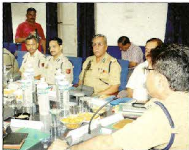
A view of the meeting presided by DGP J&K at PCR Jammu on August 03, 2009