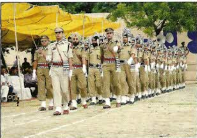
A view of the Marchpast by J&K Armed Police contingent during Independence Day parade at Jammu