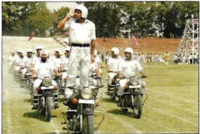
A view of the J&K Police Dare Devil show during Independence Day Parade at Srinagar