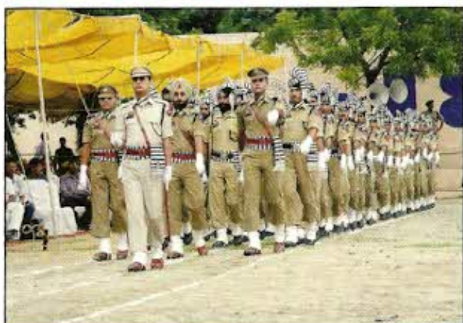
A view of the Marchpast by J&K Armed Police contingent during Independence Day parade at Jammu