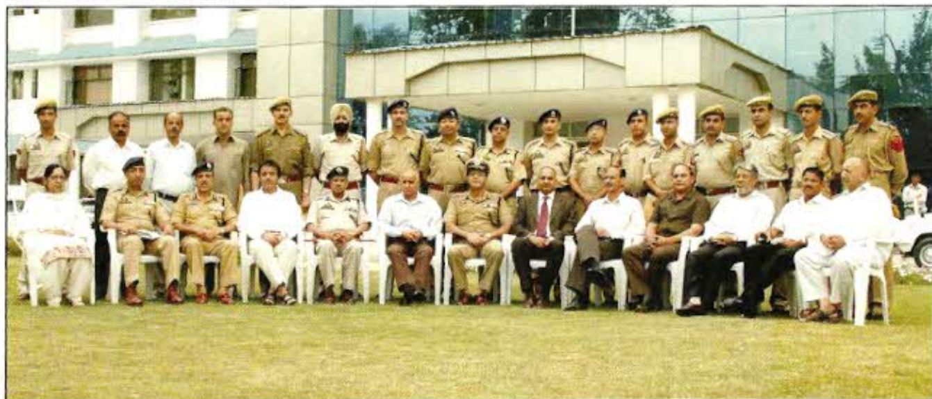
A group photograph of the recipients of President's Police Medal of Kashmir Province with the DGP J&K and other senior Police officers taken at PHQ J&K during a function organized for felicitation of awardees

Speaking on the occasion, the DGP congratulated the awardees and said that these awards have been conferred in recognition of their service. He further added that the awardees are role models as their deeds will inspire others to emulate.