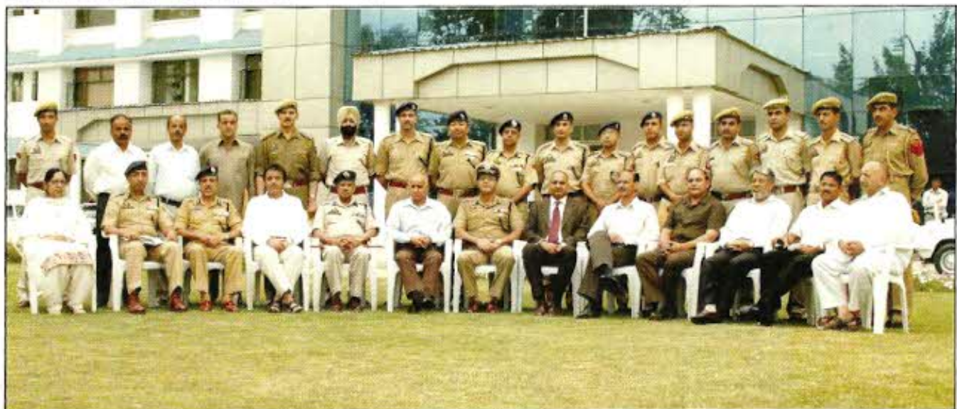
A group photograph of the recipients of President's Police Medal of Kashmir Province with the DGP J&K and other senior Police officers taken at PHQ J&K during a function organized for felicitation of awardees

Speaking on the occasion, the DGP congratulated the awardees and said that these awards have been conferred in recognition of their service. He further added that the awardees are role models as their deeds will inspire others to emulate.