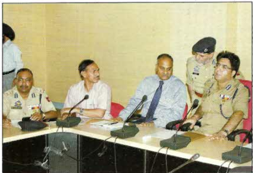
A meeting of the senior police officers presided by DGP J&K on the occasion of launching of IT connectivity with District Hqs. at PHQ J&K Srinagar