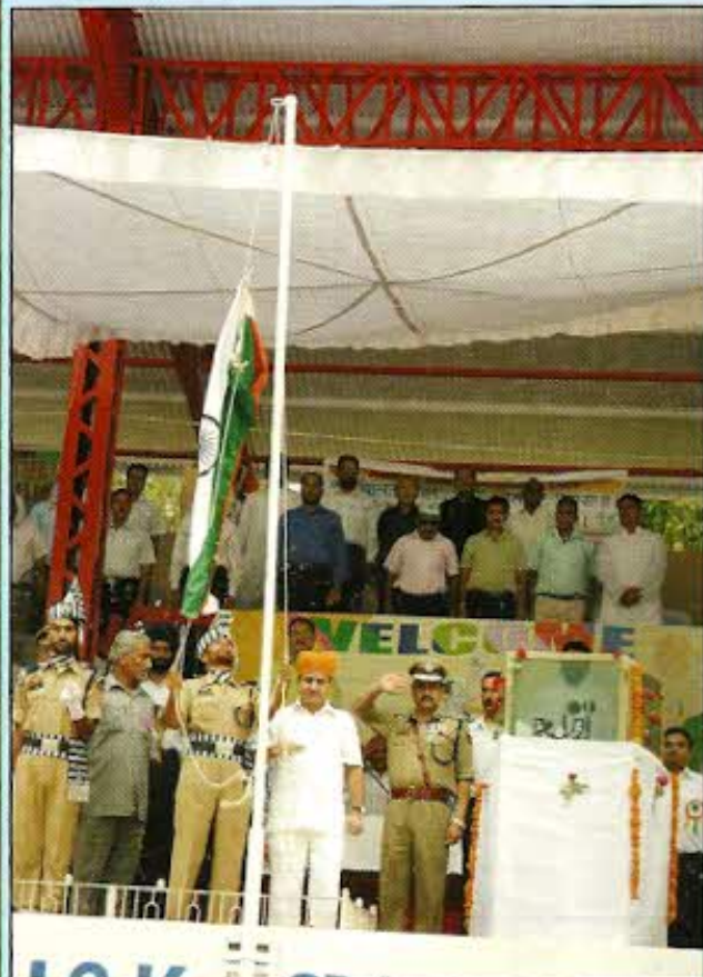
Shri Tara Chand Hon'ble Deputy Chief Minister J&K unfurling the tri-colour at Mini Stadium Jammu on Independence Day 2009

Shri Omar Abdullah Hon'ble CM J&K, saluting the national flag at Bakshi Stadium Srinagar on Independence Day 2009.