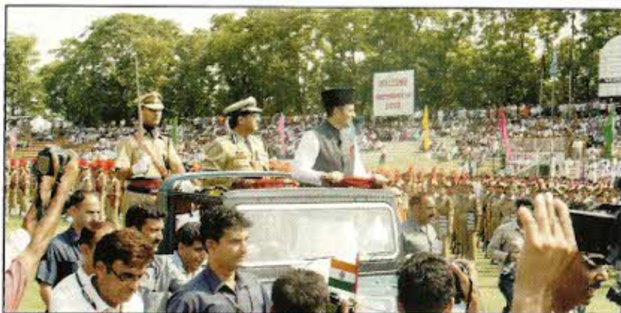
Shri Omar Abdullah Hon'ble CM J&K inspecting the contingents during Independence Day Parade at Srinagar

A similar function was organized at Mini Stadium, Parade Jammu where Shri Tara Chand Hon'ble Deputy Chief Minister J&K hoisted the tricolor and took the salute