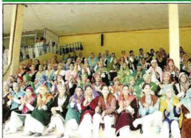
A view of the school girls witnessing the Independence Day function at Bakshi Stadium Srinagar on August 15, 2009