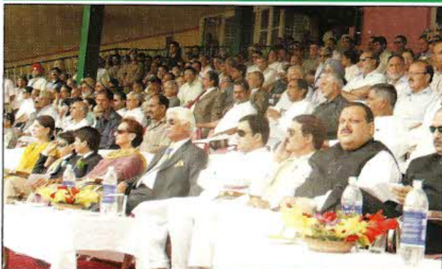
A cross section of the VIPs witnessing the Independence Day function at Srinagar