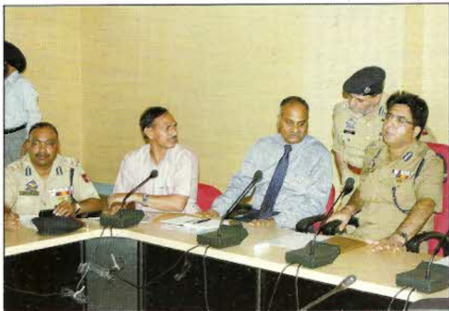
A meeting of the senior police officers presided by DGP J&K on the occasion of launching of IT connectivity with District Hqrs. at PHQ J&K Srinagar