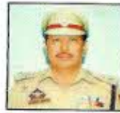
Zakir Hussain SP