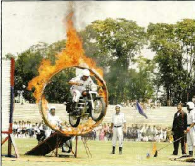
A stunt displayed by Dare Devil Team of J&K Police during the Independence Day function at Bakshi Stadium Srinagar