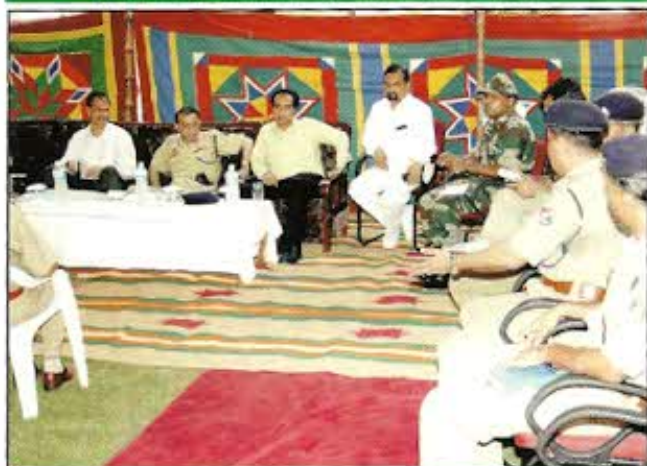
A view of meeting with security agencies presided by Shri S.Gopal Reddy IPS IGP Railways J&K on August 10, 2009 at Jammu