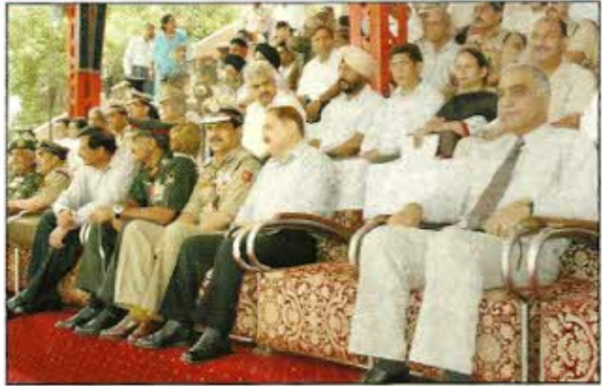
A cross section of VIPs witnessing the Independence Day function at Jammu