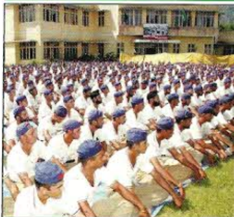
IGP Armed J&K addressing a durbar of trainees at STC Talwara Reasi on August 19, 2009