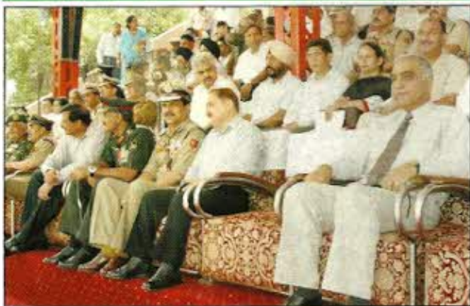
A cross section of VIPs witnessing the Independence Day function at Jammu