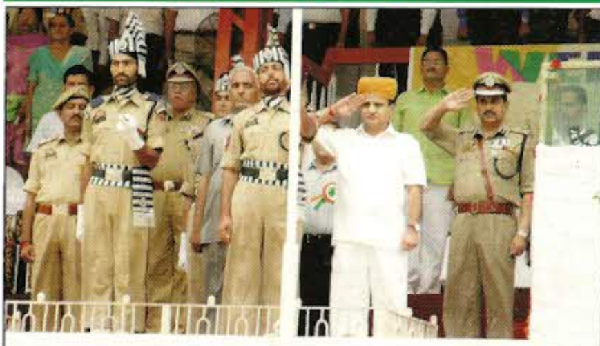
Shri Tara Chand Hon'ble Deputy CM J&K saluting the national flag during the Independence Day function at Jammu