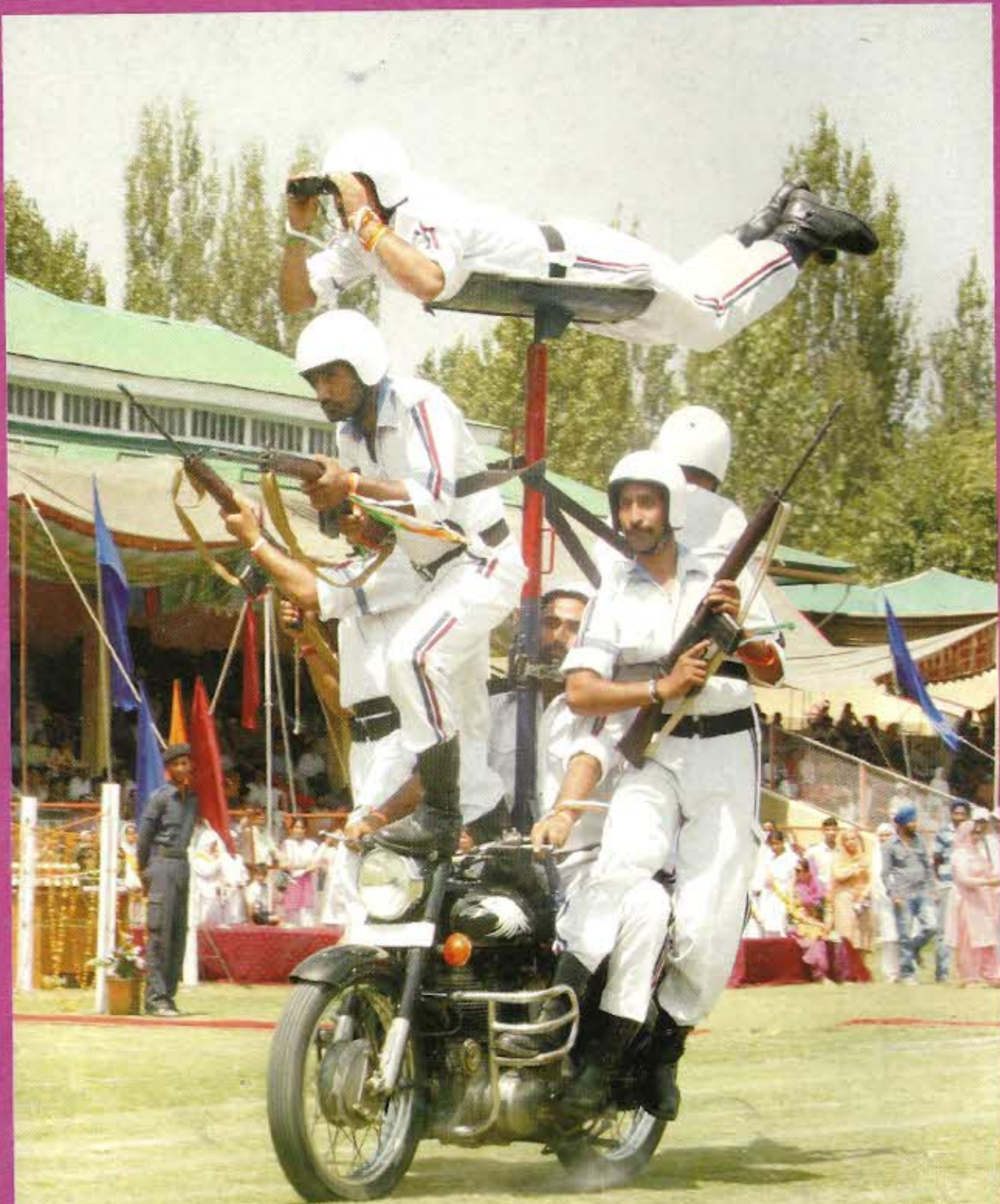
Dare Devils of J&K Police while displaying their thrilling stunts on the occasion of Independence Day 2009 function at Bakshi Stadium Srinagar, J&K