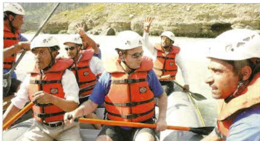
Shri Omar Abdullah Hon'ble CM J&K 2nd from right front row with J&K Police Water Sports Team during 2nd International Rafting Championship held in river Sindh at Sonamarg

will definitely boost adventure sports in J&K State and also up lift the moral of J&K Police Sports as a whole.