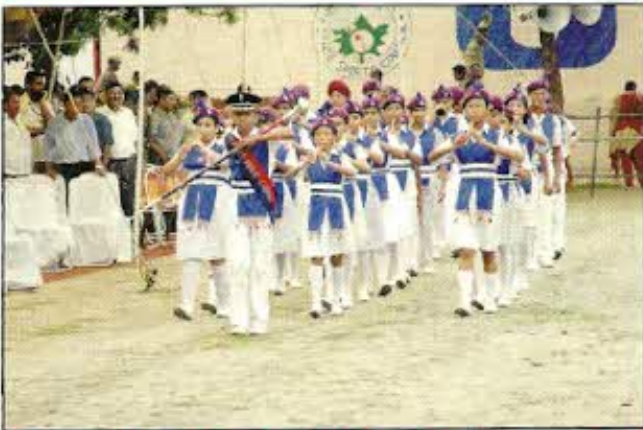
Children of Police Public School Miran Sahib Jammu during Independence Day Parade at Jammu