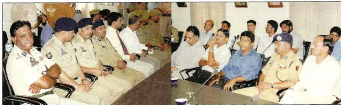
Senior Police officers of J&K Police during the inaugural ceremony of official website of J&K traffic police and release of traffic journal