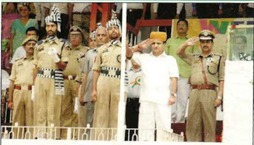
Shri Tara Chand Hon'ble Deputy CM J&K saluting the national flag during the Independence Day function at Jammu