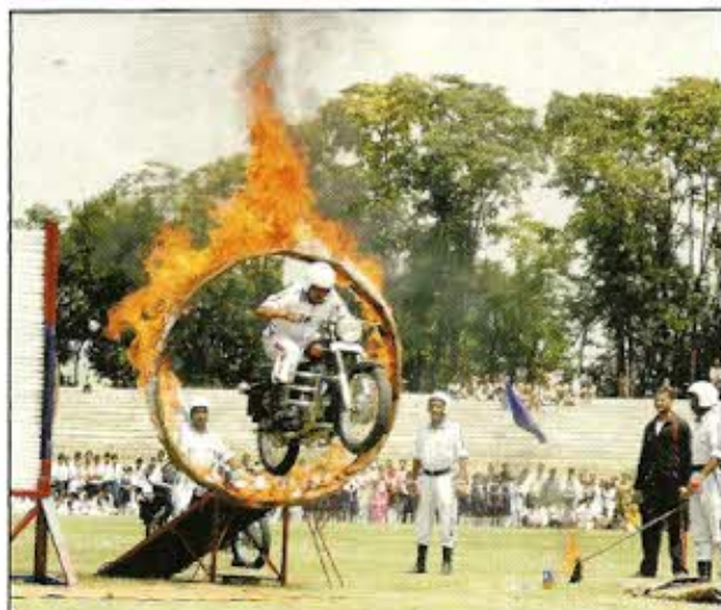
A stunt displayed by Dare Devil Team of J&K Police during the Independence Day function at Bakshi Stadium Srinagar