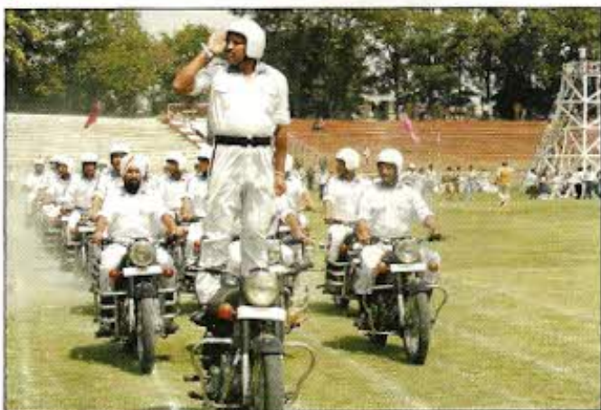
A view of the J&K Police Dare Devil show during Independence Day Parade at Srinagar