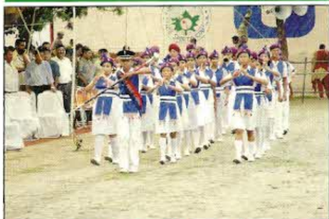
Children of Police Public School Miran Sahib Jammu during Independence Day Parade at Jammu