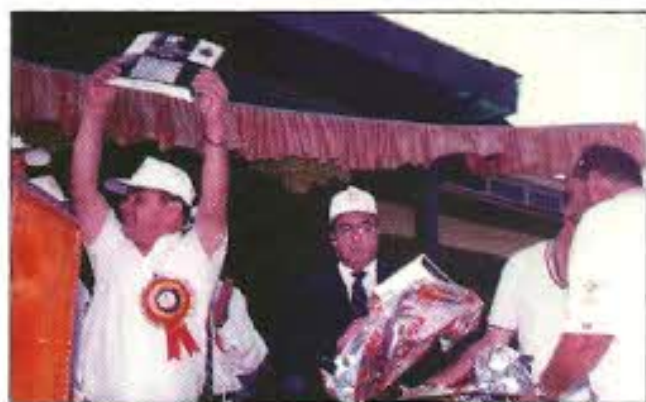
Shri Babu Singh, Hon'ble Minister of State for Sports, while releasing the souvenir at the inaugural function, on August 20

On behalf of J&K Police, Shri Kuldeep Khoda, DGP presented a memento to Shri Ghulam Nabi Azad, Hon'ble Chief Minister J&K.