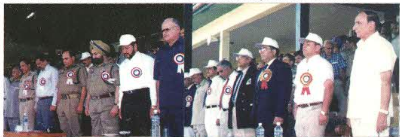
Observing 2-minute silence to pay homage to J&K Police Martyrs at the inaugural function of 10th J&K Police Martyrs Memorial Football Tournament – 2007 at Bakshi Stadium on August 20