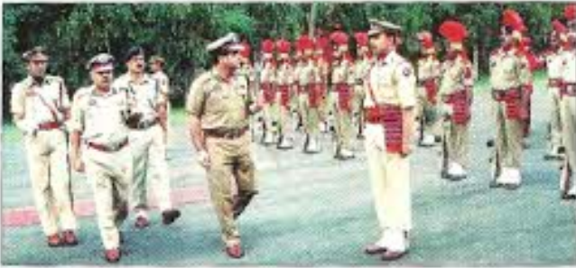
3 مارچ کو سرحدی اضلاع میں چھوڑا جانے والے دورہ کے دوران ریاستی پولیس کے ڈائریکٹر جنرل جناب گلدیپ کھڈا نے پولیس کے اسلامی دہشت گرد کا معائنہ کرتے ہوئے۔