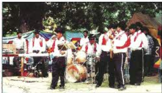
Naka boys of District Police Srinagar, while entertaining the gathering at the venue of the Mela