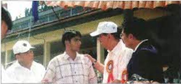
3 مارچ کو ریاست کے پولیس شہداء کی یاد میں ہونے والے رونا منٹ کی اختتامی تقریب پر وزیر اعلیٰ جناب غلام نبی آزاد پولیس شہداء کے لواحقین کو تحفہ چلتی فیش کرنے کے دوران ان سے حال و حال پوچھتے ہوئے۔