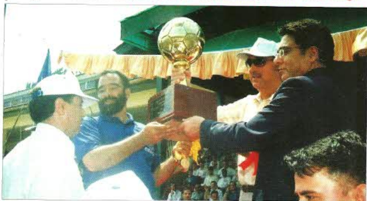
Shri Ghulam Nabi Azad, Hon'ble Chief Minister J&K, while presenting the 'Running Trophy' to J&K Bank XI at the presentation ceremony of 10 th J&K Police Martyrs Memorial Football Tournament - 2007 at Bakshi Stadium on Sept. 03

10 th J&K Police Martyrs Soccer Tournament held at Srinagar