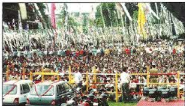
A view of the gathering at the raffle draw at the venue of the mela