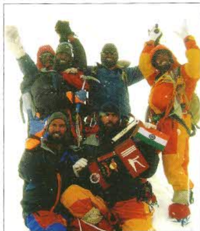
Mountaineers of J&K Police succeeded in hoisting the J&K Police Flag atop the Himalayan peak of NUN

On August 04, the mountaineers of J&K Police succeeded in hoisting the J&K Police Flag atop the Himalayan peak of NUN. The Nun-peak (7140 meters above the sea level), located in the Suru valley of Ladakh, is rated as the most technical and one of strategically toughest peak in the world.