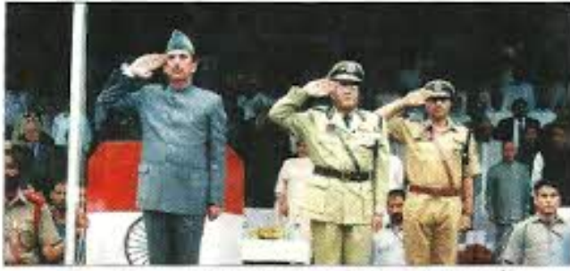
15 مارچ کو منعقد ہونے والے آزادی کی تقریب پر ریاست کے وزیر اعلیٰ جناب غلام نبی آزاد کو قومی پرچم لہرایا۔