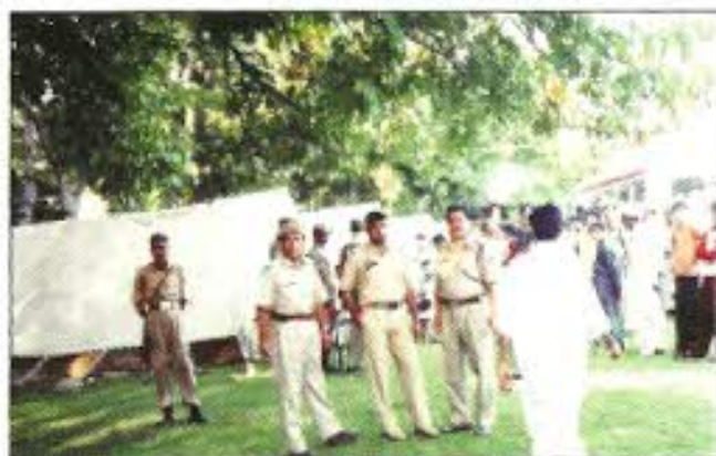
A view of the police relief camp established at Shangus

The humane gestures of J&K Police to help the people in distress have earned them appreciation from all quarters.