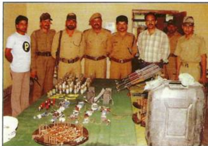
Weapons and Ammunition recovered by Srinagar Police on July 12.