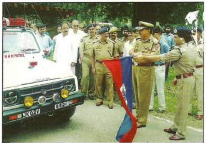
DGP J&K flagging off the Patrolling Gypsies