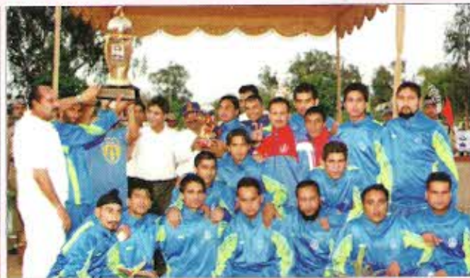
Felicitation of J&K Police football team