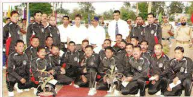
Dare-devil team with senior police officers