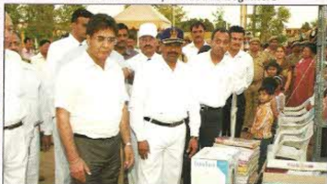
Items provided to orphanage