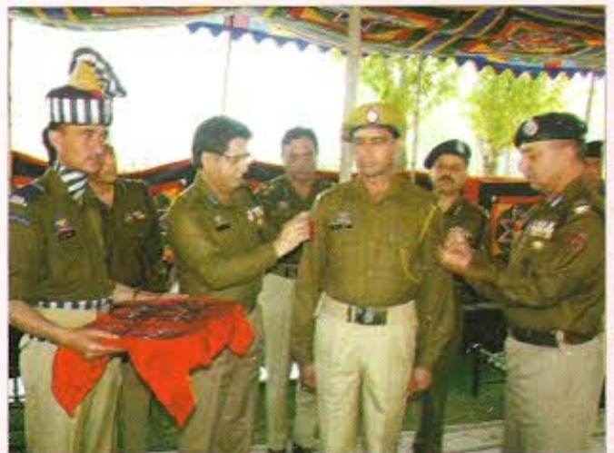
DGP J&K (L) and IGP Kashmir Zone (R) honouring a valiant police personnel with one rank up out of turn promotion at PCR Srinagar on April 08, 2010

DGP further disclosed that there is need to win the trust of people by displaying true professionalism in the days to come. During the meeting, the DGP stressed upon the officers to maintain close vigil on the activities of anti-social elements who always try to disrupt the normal life for their vested interests. DGP expressed satisfaction over the recent successful operations against militants in different parts of the State.