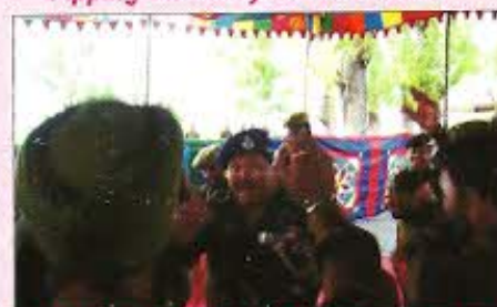
The jubilant promoted officials dancing with their commanding officer in IRP 4th Bn.