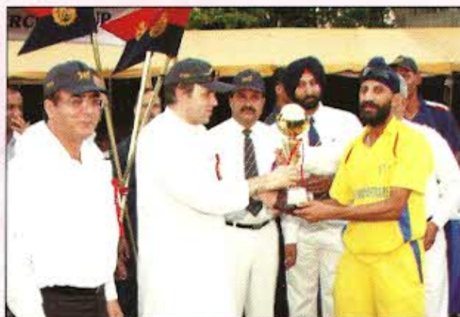
Presentation of trophy to man of the series