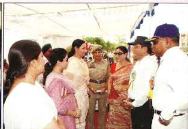
DGP J&K, ADGP CID & Chairperson JKPWWA interacting with the NoKs of Police Martyrs