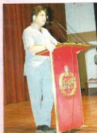
DGP J&K Addressing during the debate