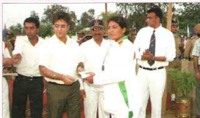
Women boxer receiving cash reward from DGP J&K