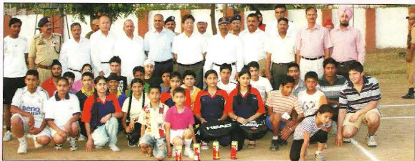
Lawn Tennis beginners with senior police officers on the inauguration of lawn tennis clay court at DPL Jammu