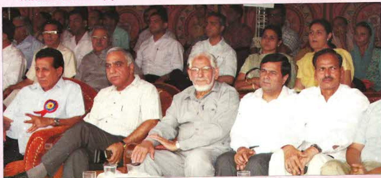
Distinguished guests witnessing the final match