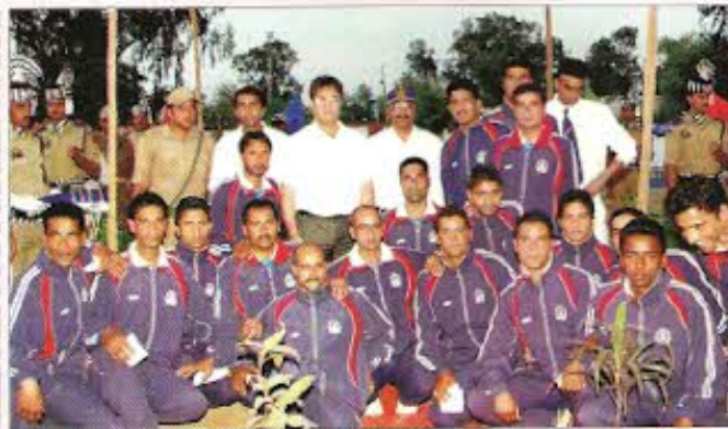
Water sports team of J&K Police with senior police officers