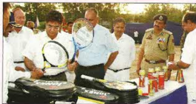
Lawn tennis kit provided to beginners