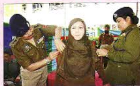
Pipping ceremony in IRP 4th Bn.