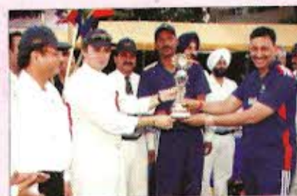
Presentation of runners trophy