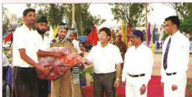
Volleyball team receiving Sports material