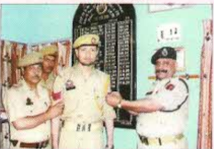
JKAP 13th Bn. Doda