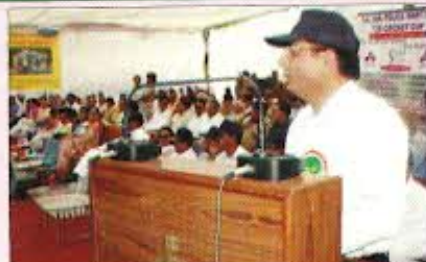
DGP J&K addressing on the closing