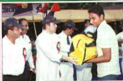
Hon'ble CM J&K presenting sports kit