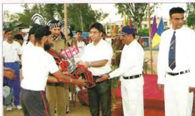
Hockey team receiving sports kit