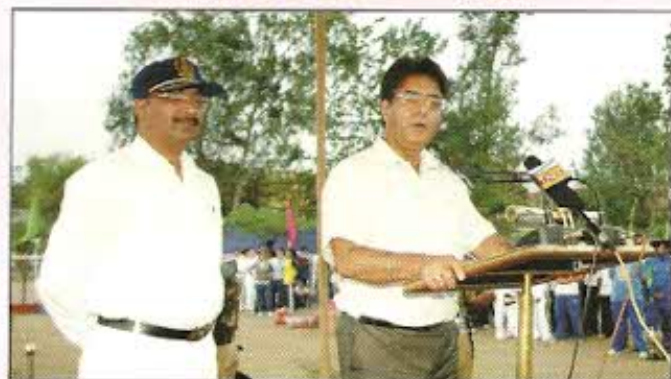
DGP J&K addressing the function