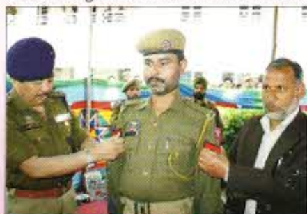
IRP 4 th Bn.