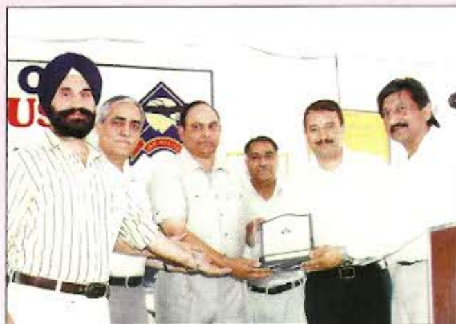
Presentation of memento to the Chief Guest