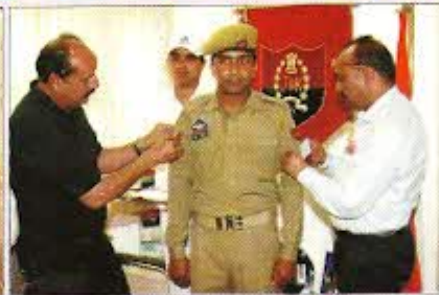
Pipping ceremony at APHQ Jammu