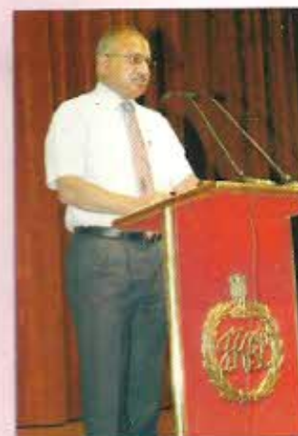
ADGP CID J&K Addressing during the debate