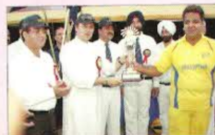
Presentation of winners trophy