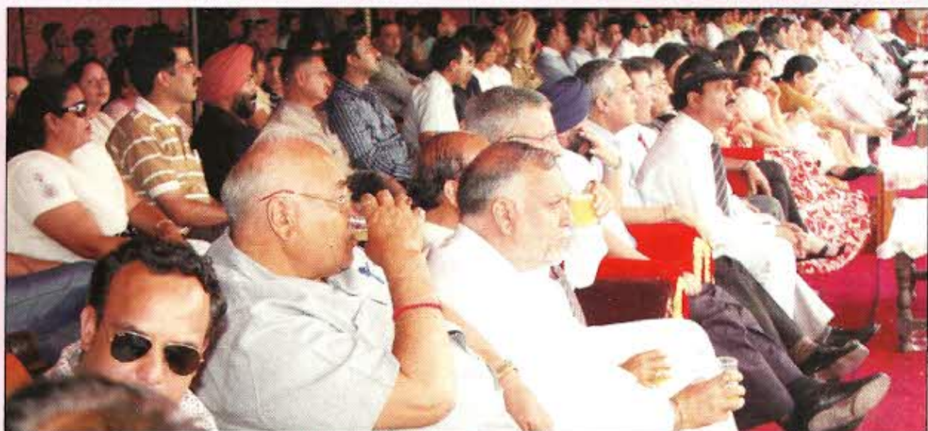
A galaxy of dignitaries during closing ceremony