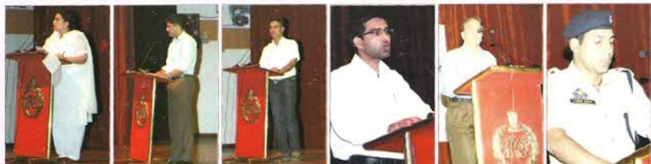
Above and below : Participants speaking on the topic "there should be equal condemnation of human rights violation committed by security forces and Terrorists" during the debate competition