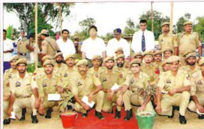
Turban Tying and Bugle playing competitors posing for a photograph with senior police officers after receiving cash rewards