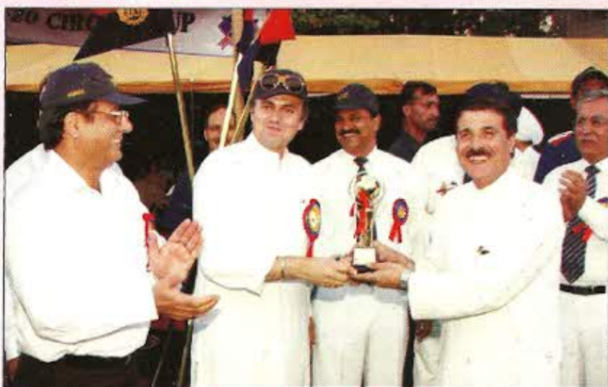
Presentation of trophy to best fielder

The opening match of the tournament played between Chief Minister XI and PDD XI was won by the later.