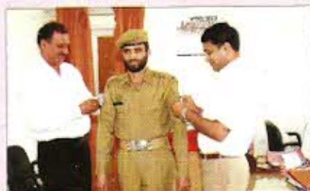
Pipping ceremony at PHQ Jammu