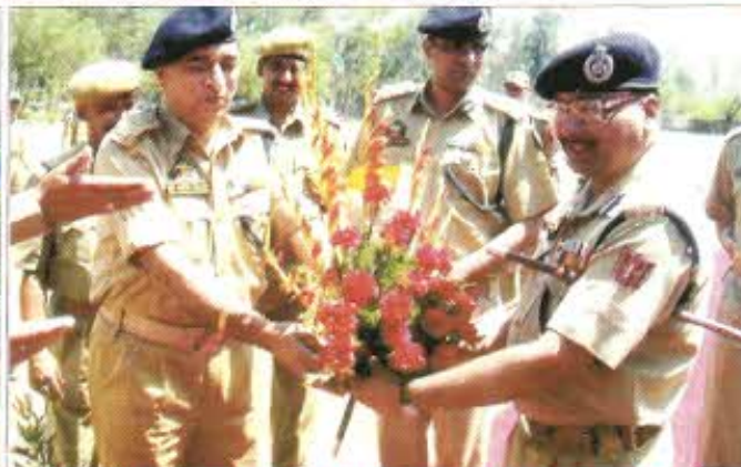
Commandant IRP 17th Bn. Shri Mohammad Amin Khan presenting bouquet to IGP Armed J&K Shri Dilbag Singh IPS during the later visit to IRP 17th Bn. Hqrs. on April 26, 2010

On this occasion, IGP Armed also planted Devdar/ Kail tree saplings at Batamalo during a plantation drive initiated by him.