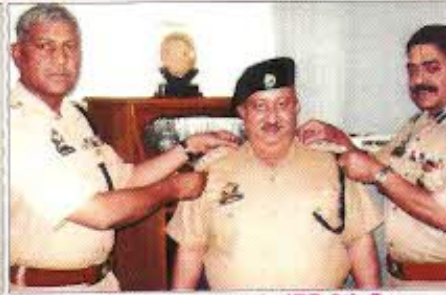
Pipping ceremony in IRP 8th Bn.