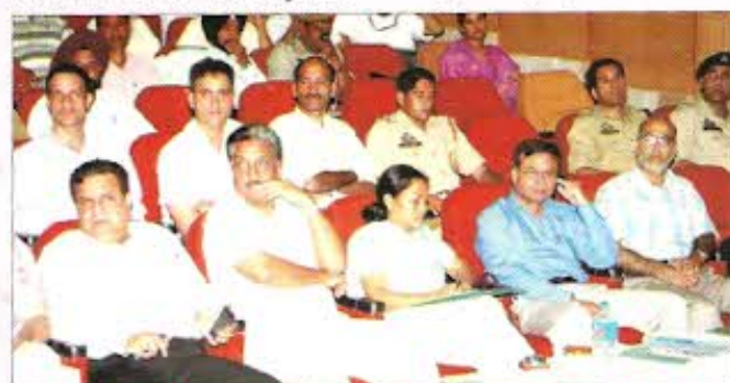
A galaxy of senior police officers witnessing the debate competition on Human Right Violation enthusiastically