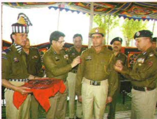
DGP J&K (L) and IGP Kashmir Zone (R) honouring a valiant police personnel with one rank up out of turn promotion at PCR Srinagar on April 08, 2010

Prior to this function, a high-level meeting convened to review the security scenario in the valley was chaired by DGP J&K in PCR Srinagar. While addressing the meeting the DGP reiterated that Jammu and Kashmir