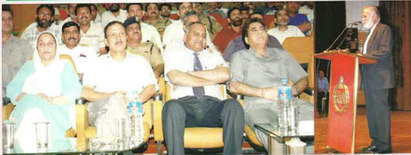
Hon'ble Justice (Retd.) Syed Bashir-ud-Din, Chairperson, J&K State Human Rights Commission addressing the gathering on the occasion of a debate competition on "Human Rights Violation by Police/Security Forces and Militants" organized by CID J&K at Police Auditorium Gulshan Ground Jammu on April 15, 2010