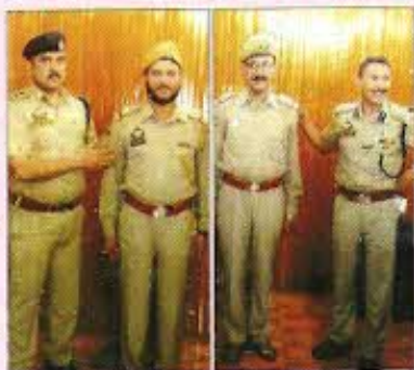
Pipping ceremony at DPO Doda