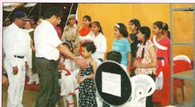
DGP J&K flanked by IGP Armed interacting with orphan children

"A Police official should keep his temper thoroughly under control and act with courtesy on all occasion. He should not allow his composure to be disturbed by the behaviour of others".