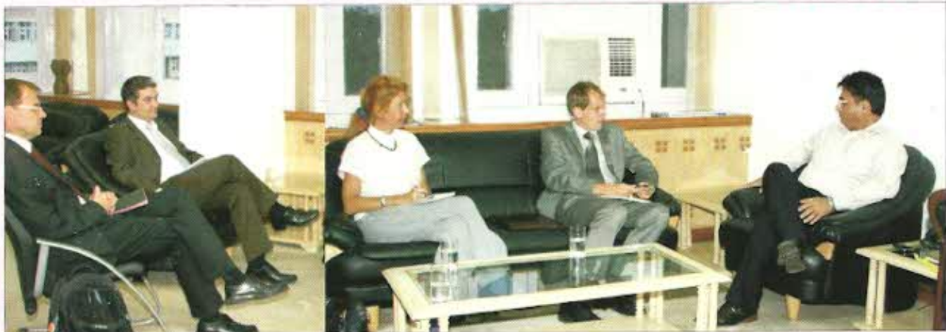
Shri Kuldeep Khoda IPS DGP J&K interacting with a delegation of Danish Embassy during the later visit to PHQ J&K Jammu on April 20, 2010