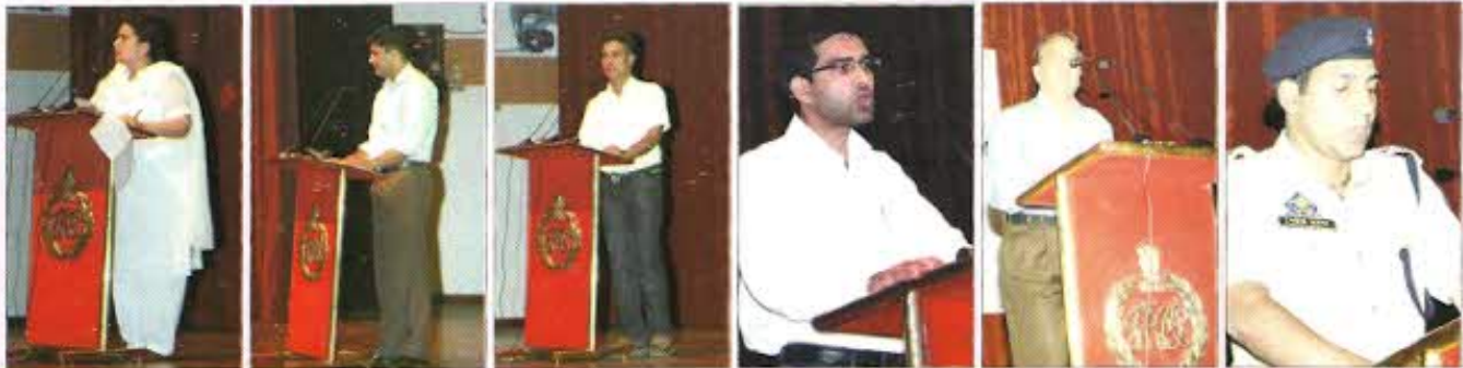
Above and below : Participants speaking on the topic "there should be equal condemnation of human rights violation committed by security forces and Terrorists" during the debate competition