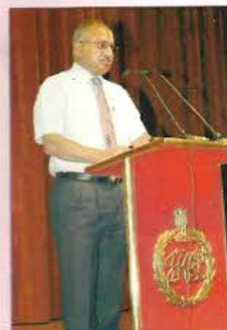
ADGP CID J&K Addressing during the debate