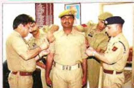
Pipping ceremony at PHQ Jammu