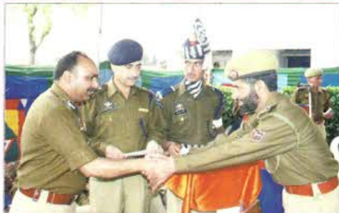
IGP Armed J&K presenting cash rewards to officers and jawans at Srinagar on April 09, 2010