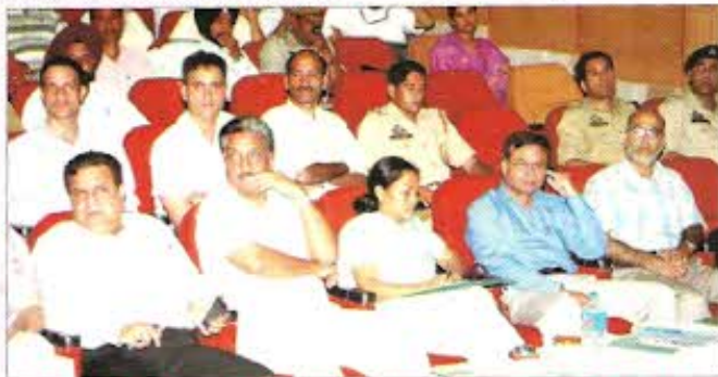
A galaxy of senior police officers witnessing the debate competition on Human Right Violation enthusiastically