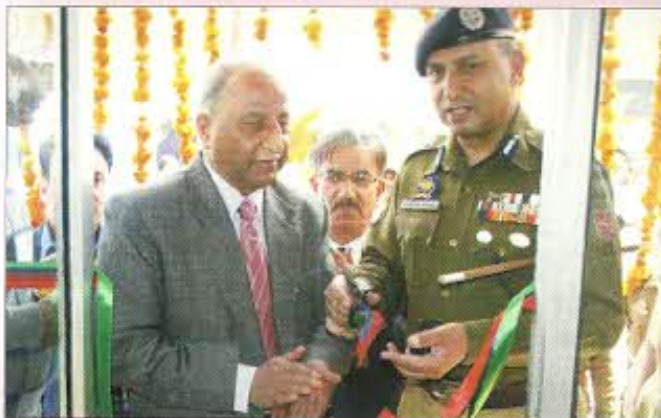
IGP Kashmir Zone Shri Farooq Ahmad IPS inaugurating the ATM installed at PTS Manigam by J&K Bank on April 07, 2010