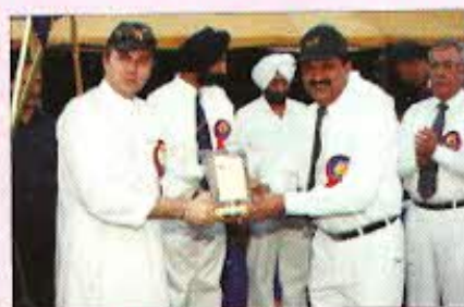
Hon'ble CM J&K presenting memento to IGP Jammu