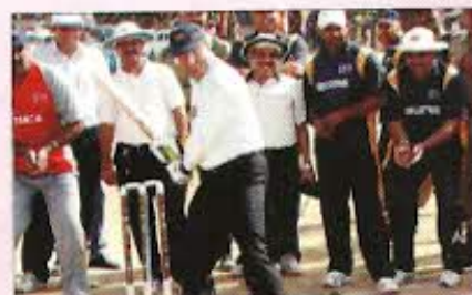
DGP J&K playing during opening function