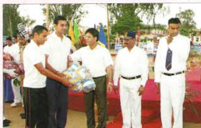
Presentation of basket ball game kit to players