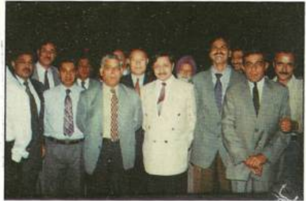
Participants at the dinner party, hosted by the DGP, J&K, to honour the officers inducted into IPS