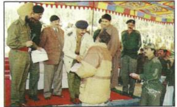
کپواڑہ میں منفقہ و ایک تقریب پر ۱۰ کم عمر بچوں کو اپنے والدین / اوارخان کے ساتھ ملانے جانے کا منظر۔

کپواڑہ پولیس نے ۱۰ کم عمر بچوں کو، جنہیں ورغلا بھسلا کر سرحد پار جانے کی تحریک دی گئی تھی، لائن آف کنٹرول پر گرفتار کیا۔ ۲۶ مارچ کو جذبہ خیر سگالی کے تحت ان کم عمر بچوں کو کپواڑہ میں ایک تقریب پر اپنے والدین / اوارخان کے حوالہ کیا گیا۔