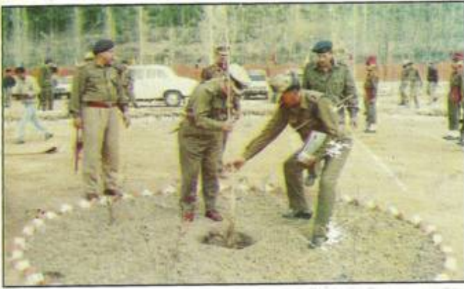
۱۹ مارچ کو پولیس ٹریننگ سکول شیری (پارہول) کے احاطہ میں جناب اے کے سوری، ڈائریکٹر جنرل پولیس ایک چنار کا پودا لگاتے ہوئے۔