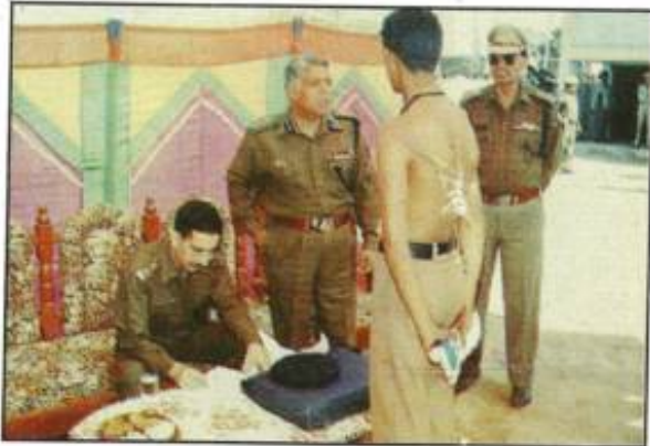
DGP J&K, Personally Supervising on-the-spot recruitment in Makhwal area of R.S. Pura on March 02