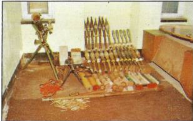
Weapons and Ammunition recovered by Anantnag Police